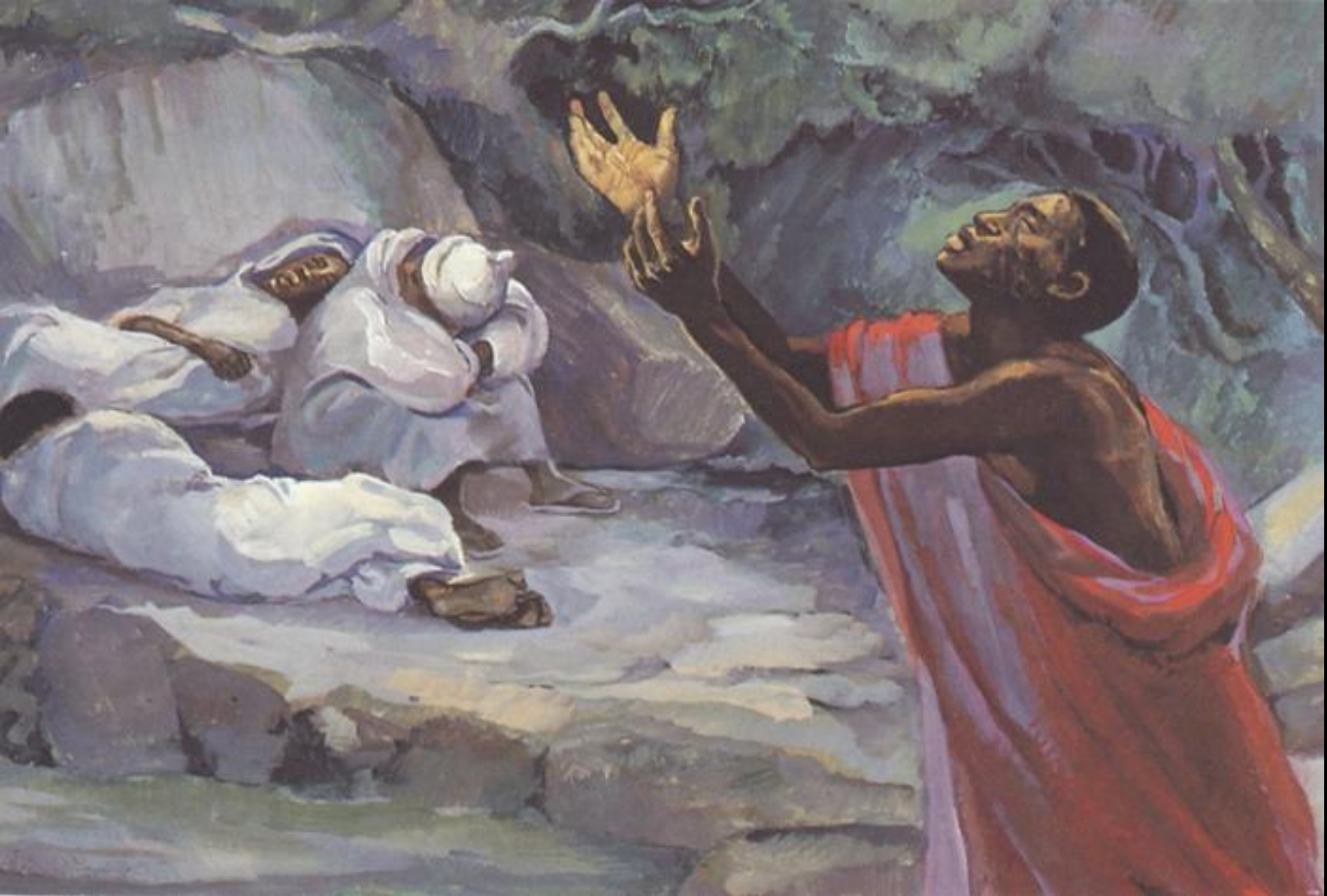
Praying at Gethsemane -- JESUS MAFA, Cameroon