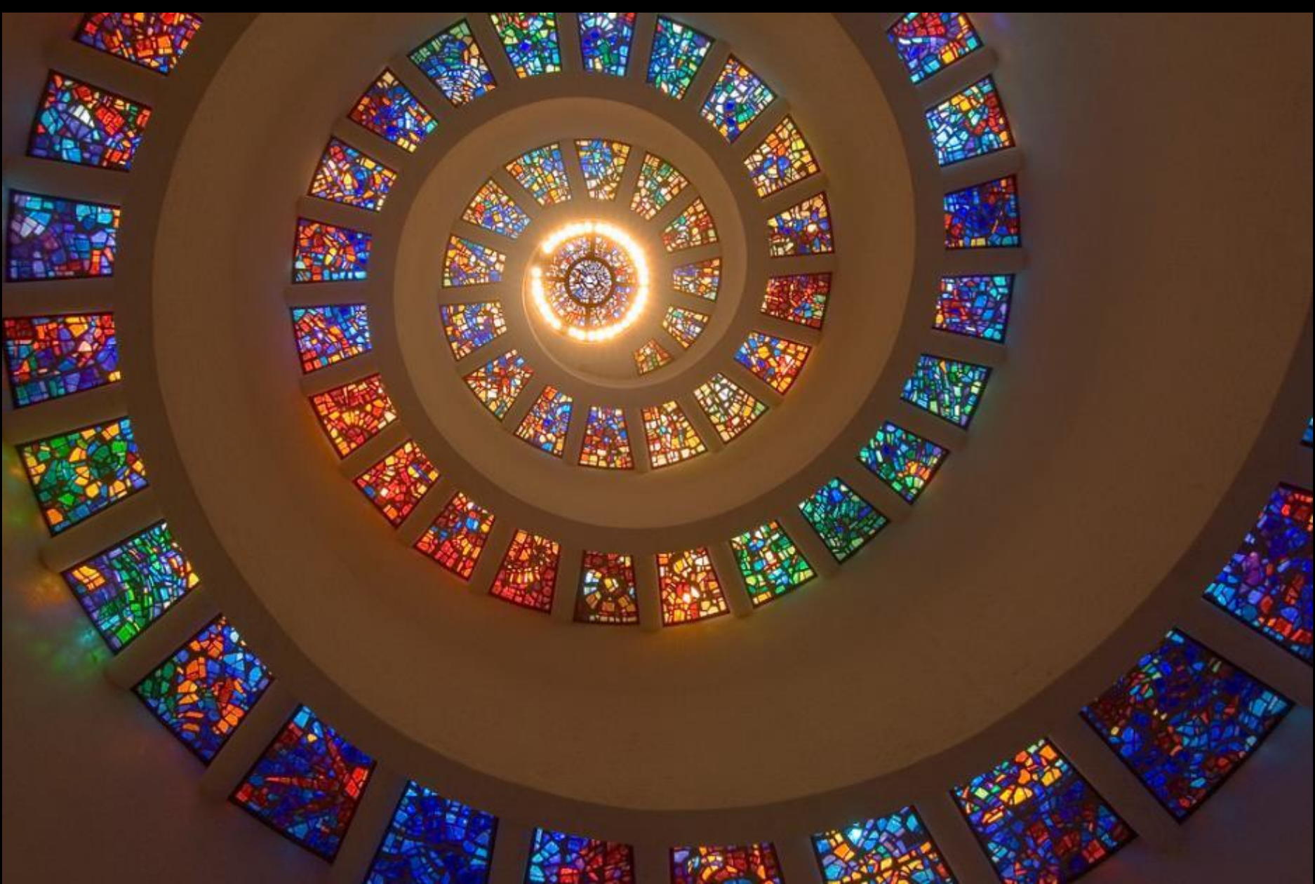
Thanksgiving Chapel -- Thanksgiving Square, Dallas, TX