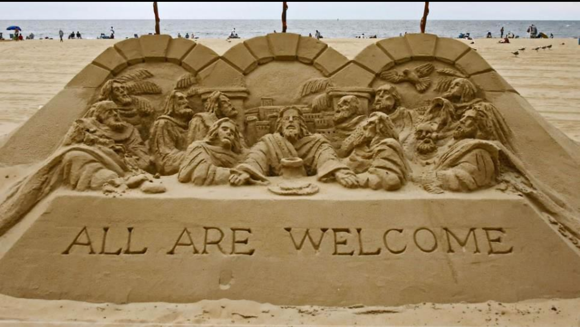
All Are Welcome in the Kingdom of God -- Sand sculpture, Ocean City, MD