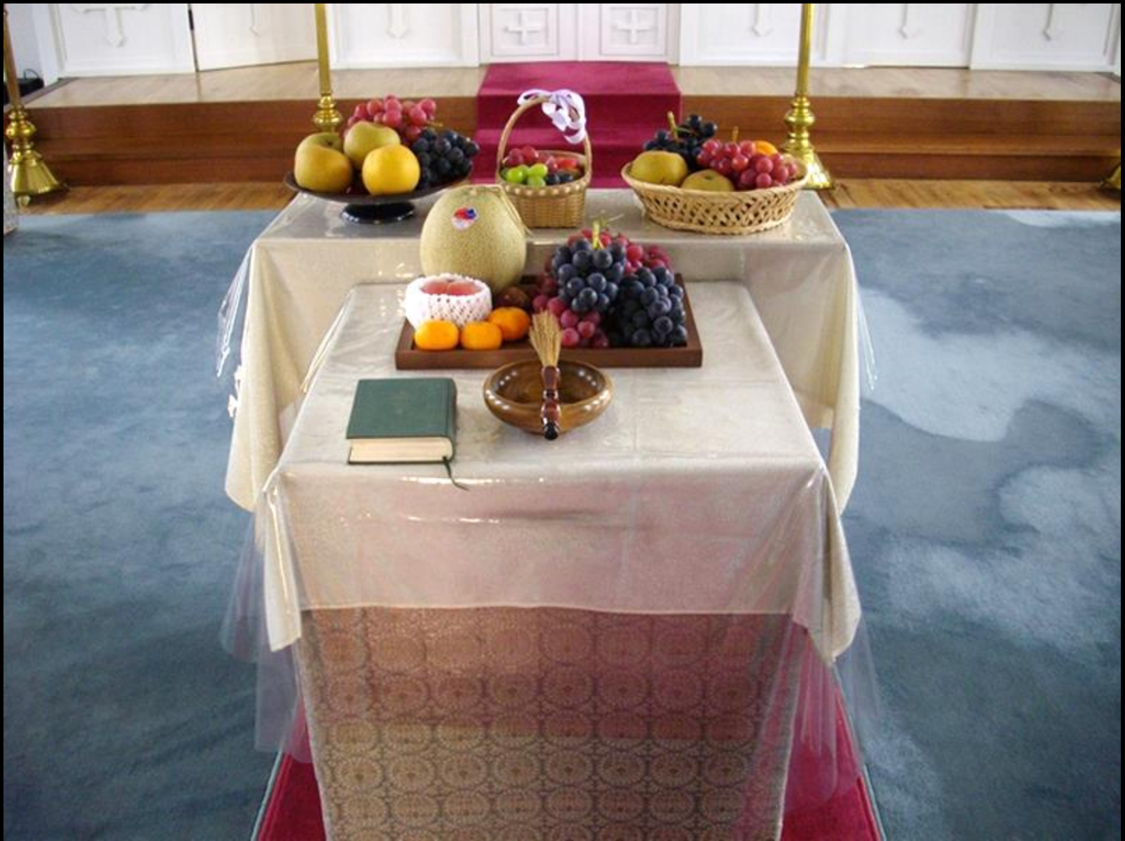
Altar Offering of First Fruits, Japanese Orthodox Holy Resurrection Cathedral, Tokyo, Japan