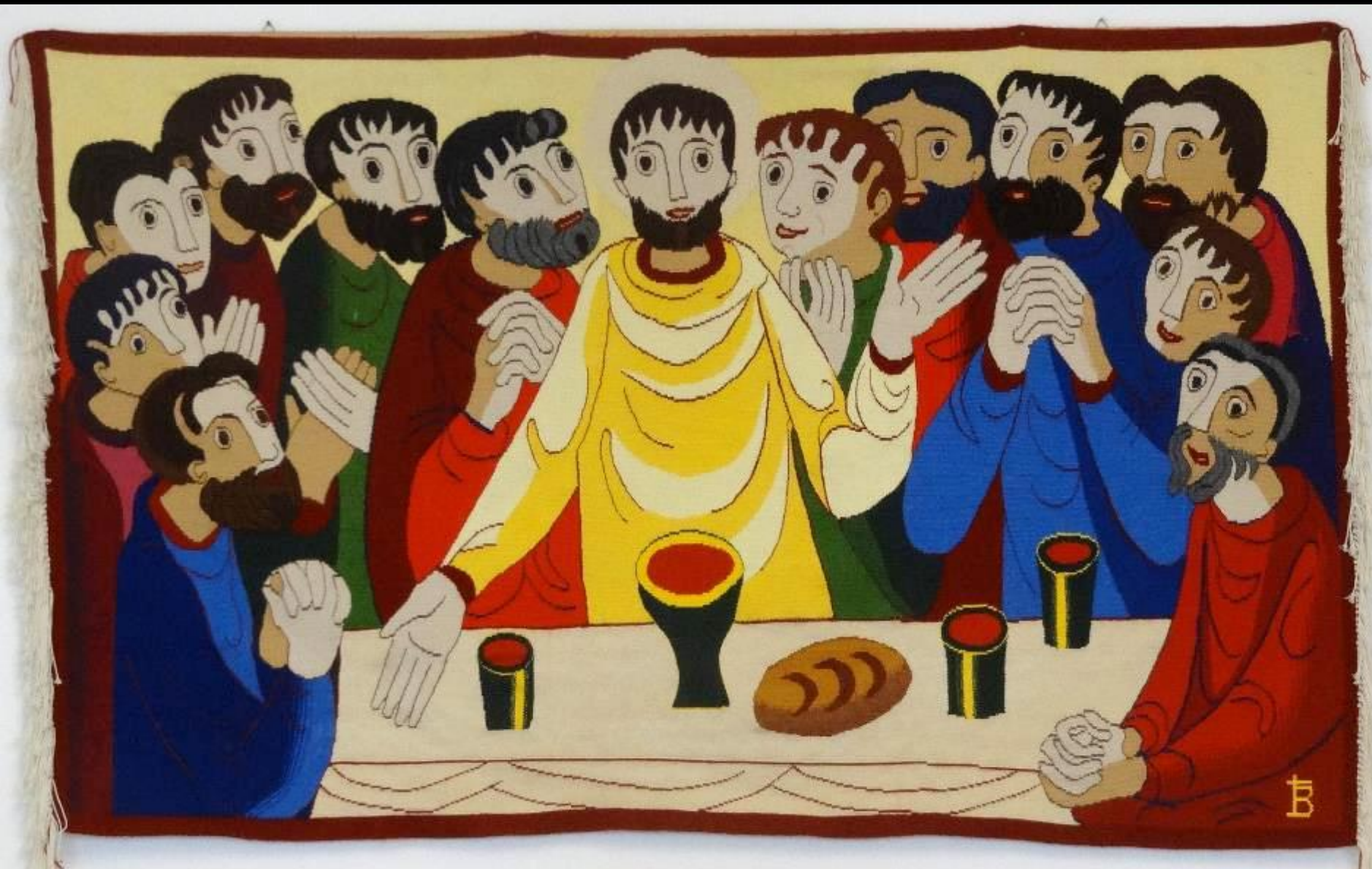
The Last Supper -- Bose Monastery, Bose, Italy