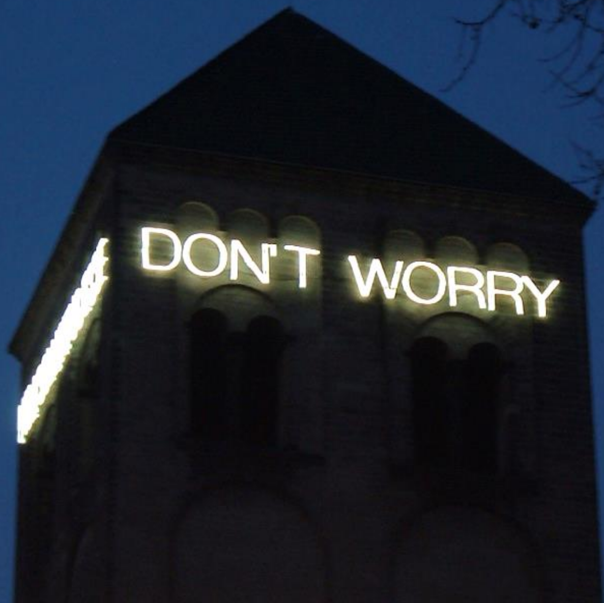
Don't Worry -- Martin Creed, permanent installation, St. Peter's Cathedral, Cologne, Germany