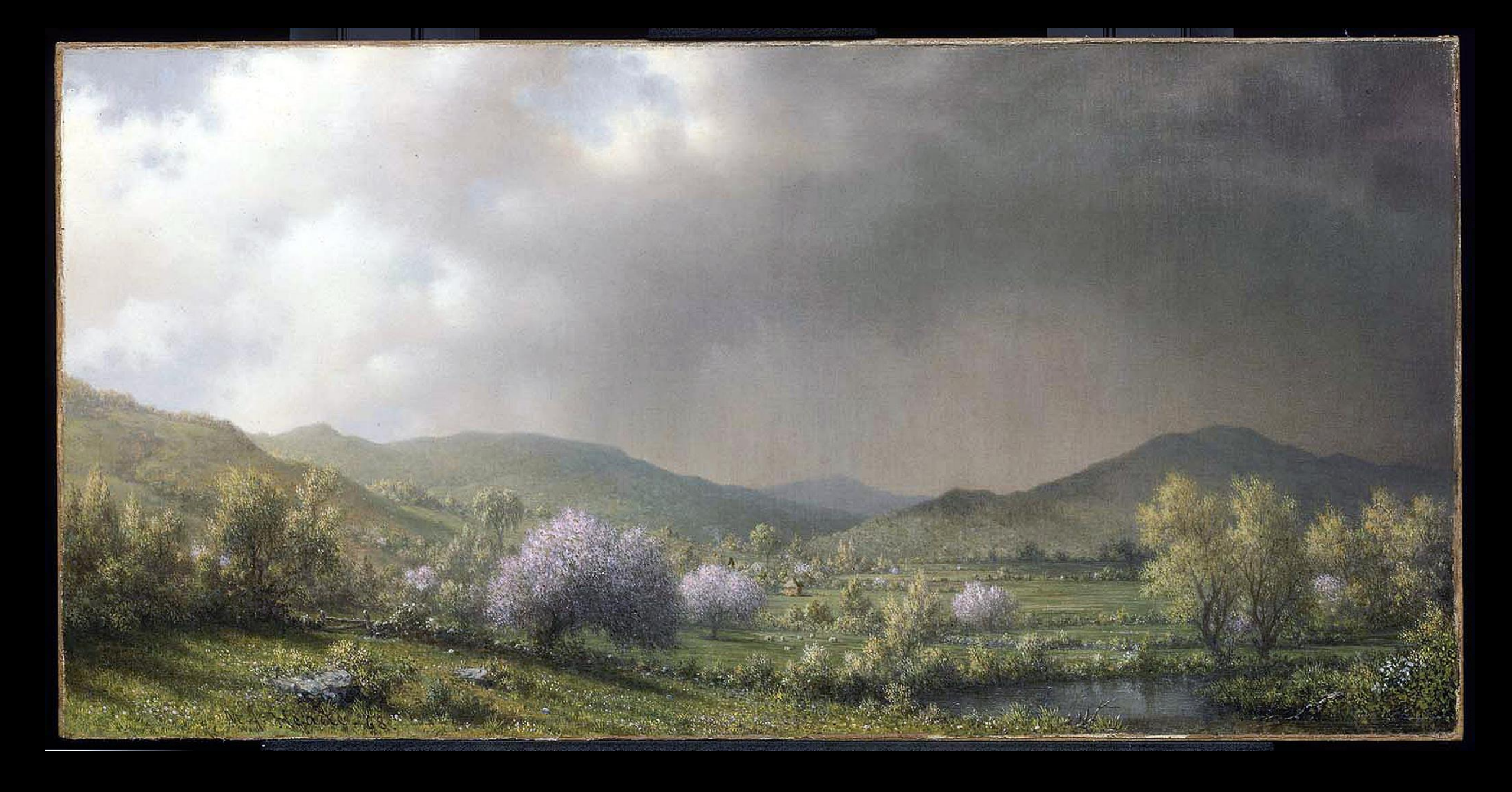
April Showers -- Martin Heade, Museum of Fine Arts, Boston, MA