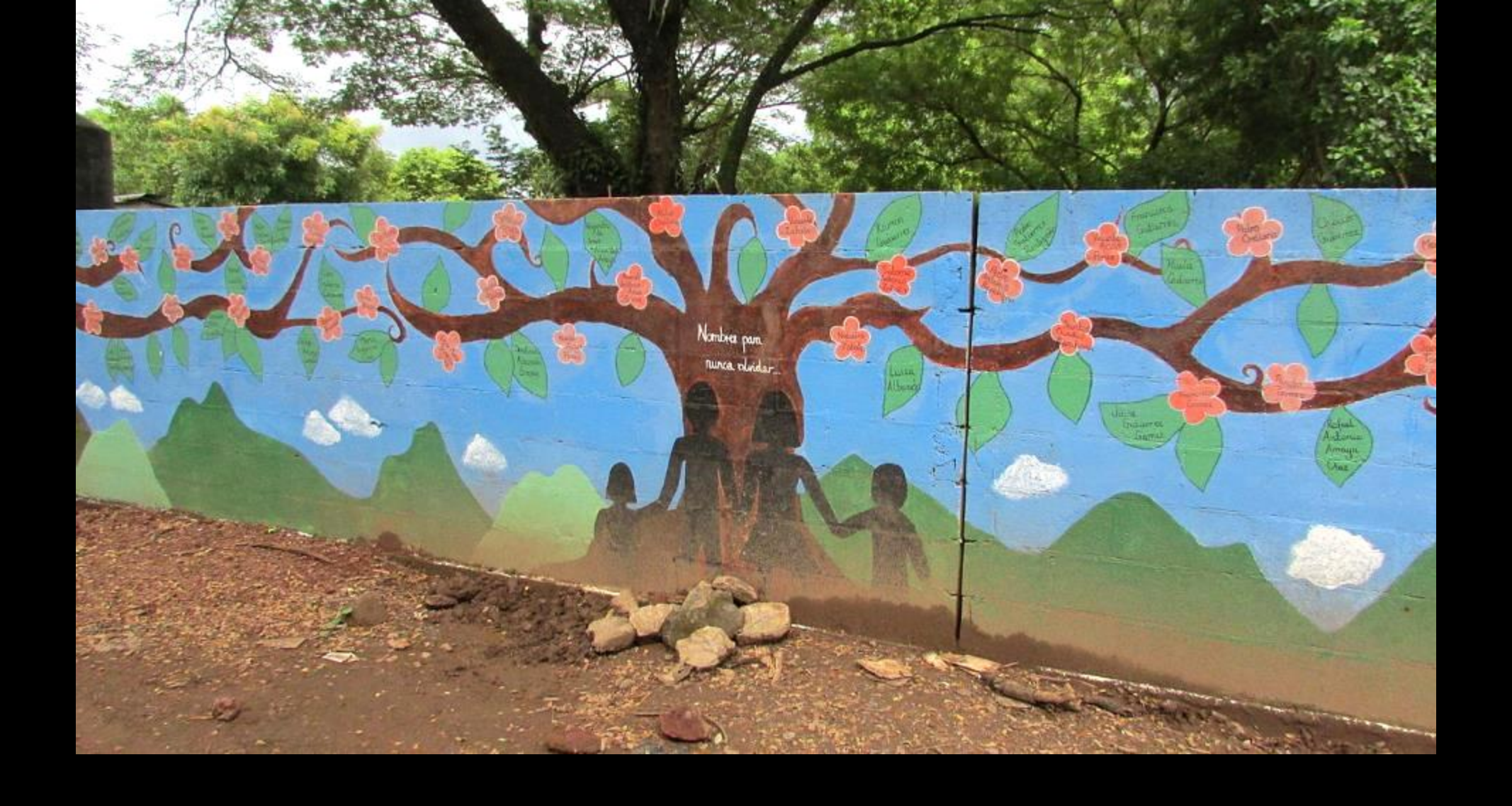
Tribute to the Lost Community Members from the Civil War -- Nuevo Gualcho, El Salvador