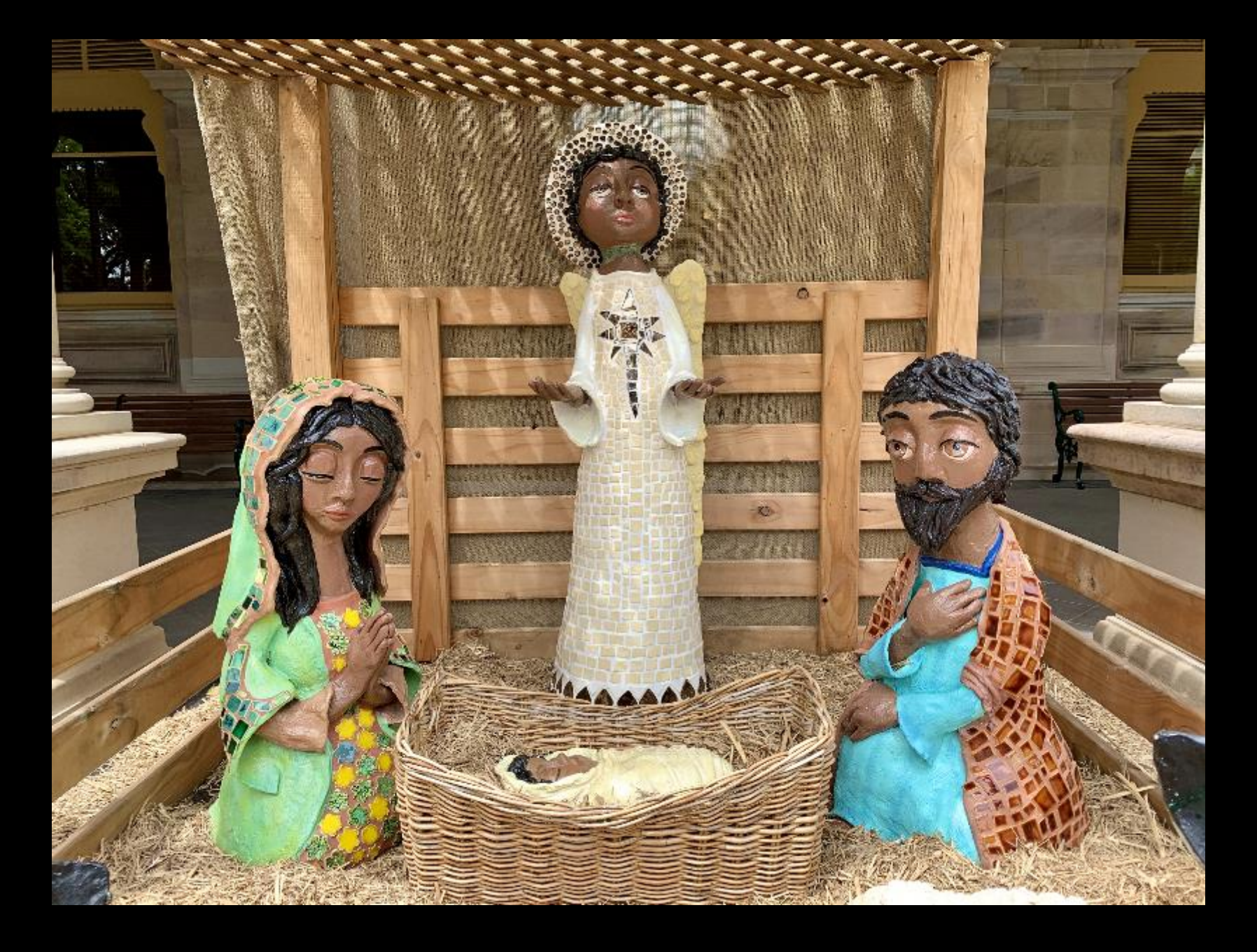
Nativity -- Parliament House, Brisbane, Australia