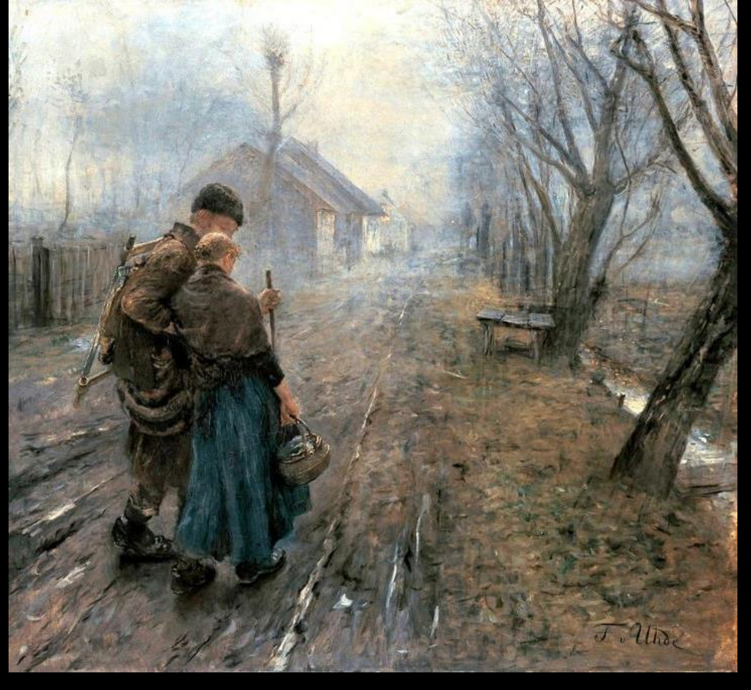
Difficult Journey – Transition to Bethelehem – Fritz von Uhde, Neue Pinakothek, Munich, Germany