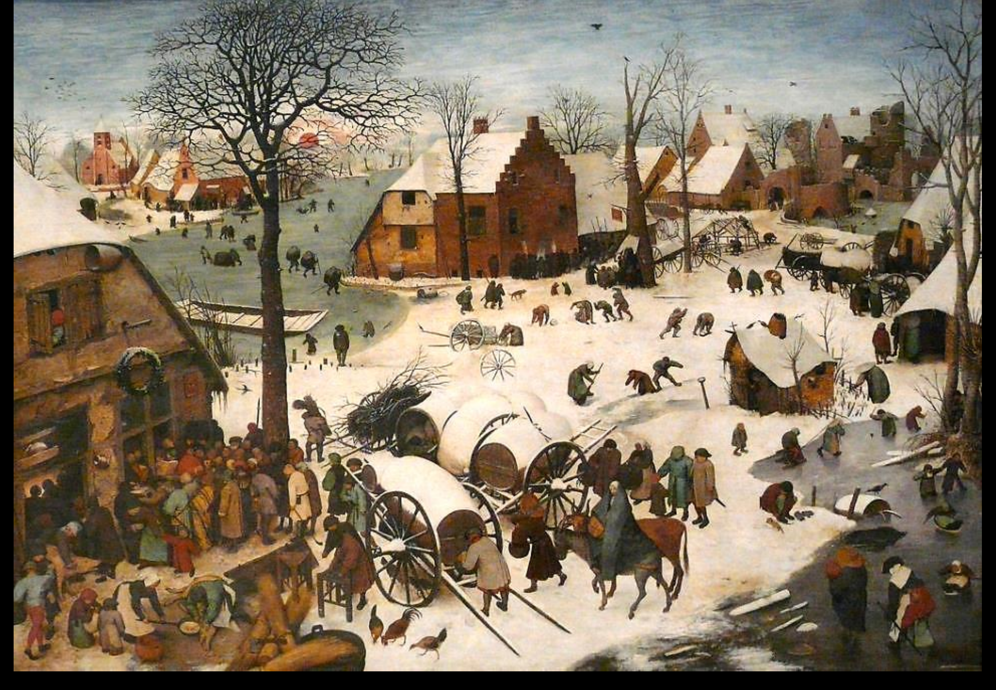
The Census at Bethlehem -- Pieter Brueghel the Elder, Brussels Museum of Fine Arts, Brussels, Belgium