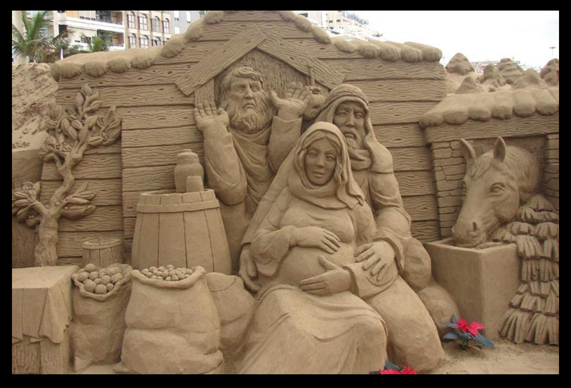
No Room in the Inn -- Peter Busch, Sand sculpture, Canary Islands, Spain