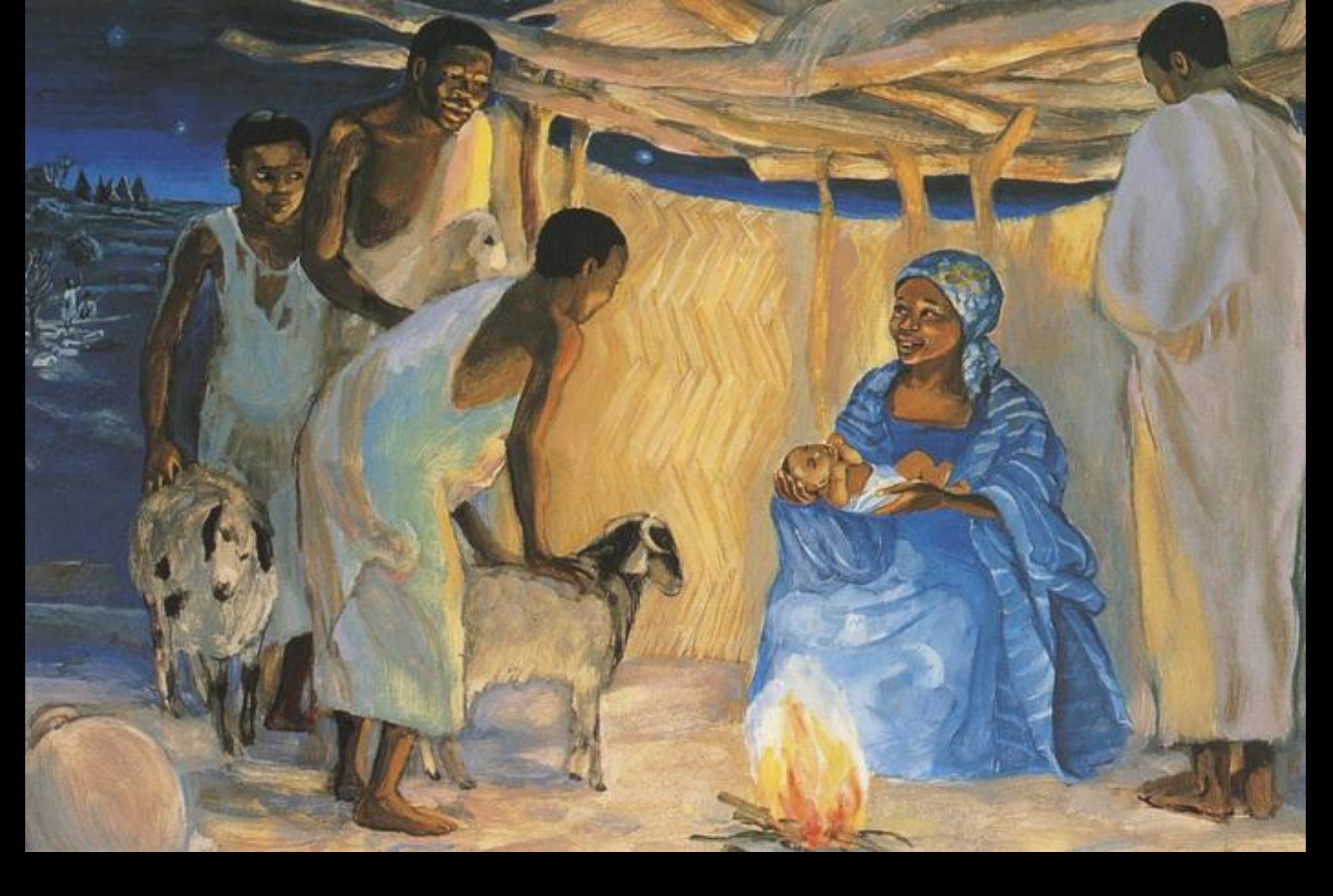
Birth of Jesus with the Shepherds -- JESUS MAFA, Cameroon