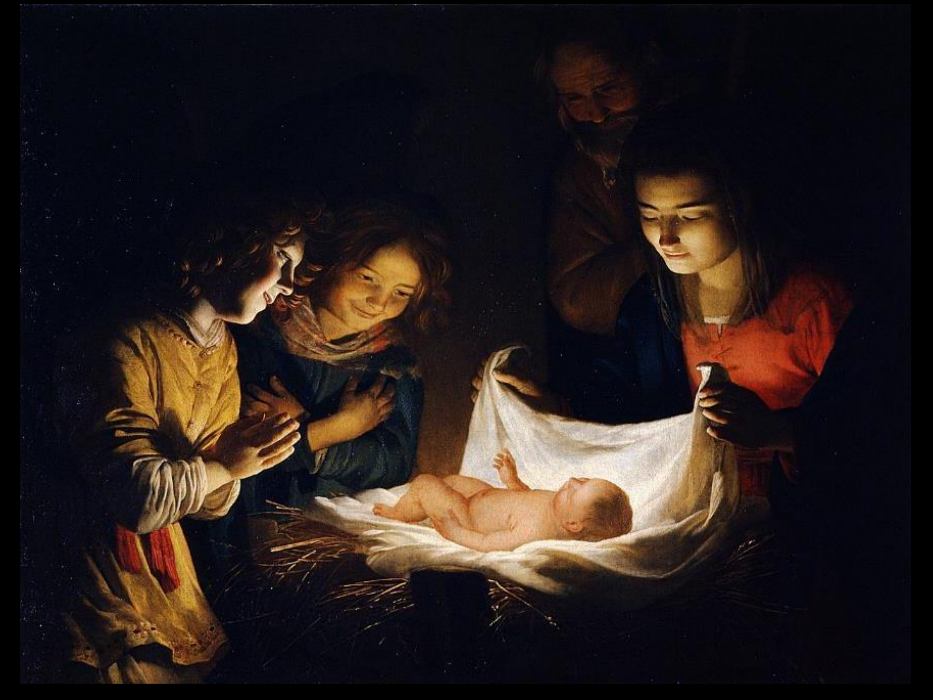
Adoration of the Child -- Gerard van Honthorst, Uffizi Gallery, Florence, Italy