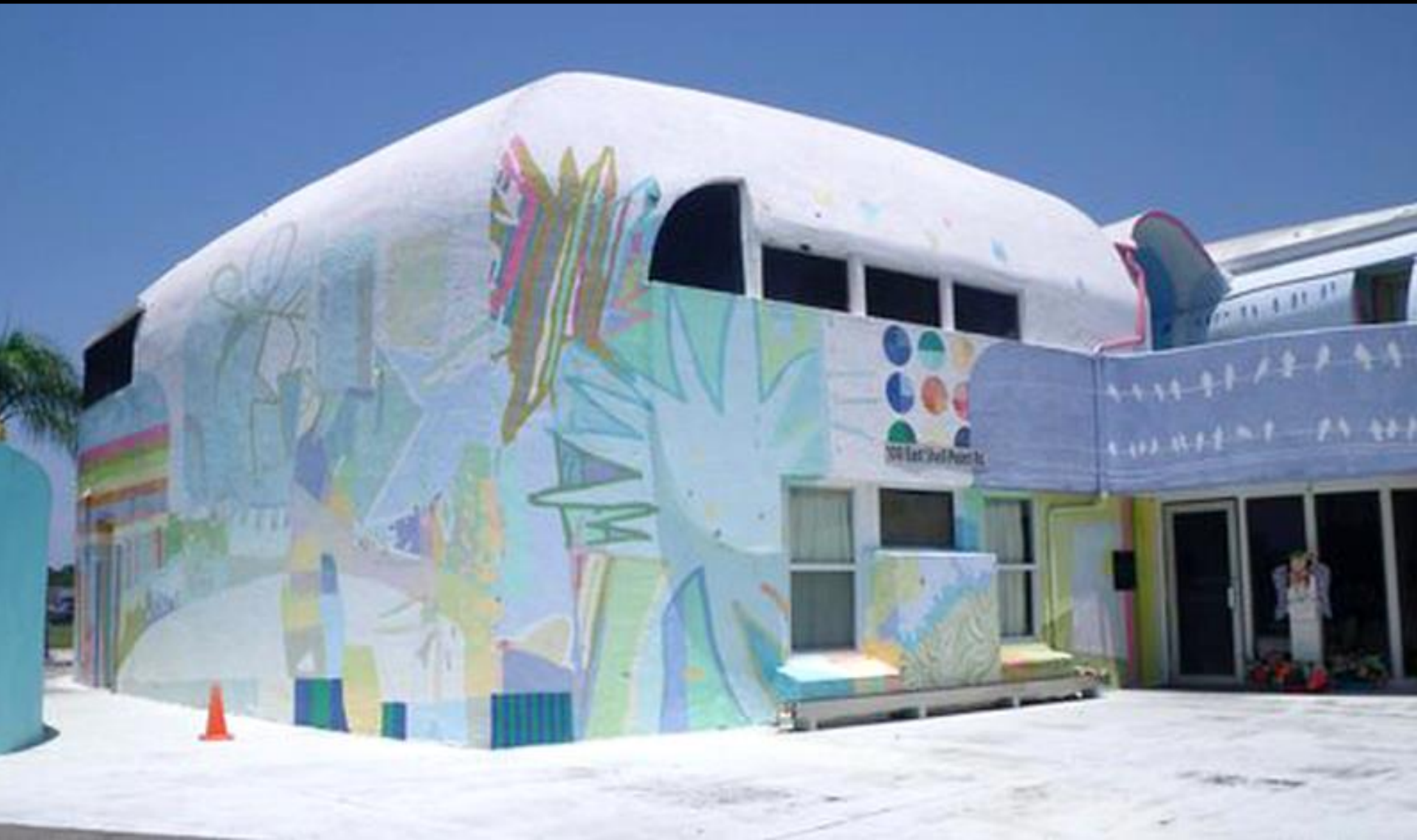
Mary and Martha House -- Domestic Violence Homeless Shelter for Women in Ruskin, FL