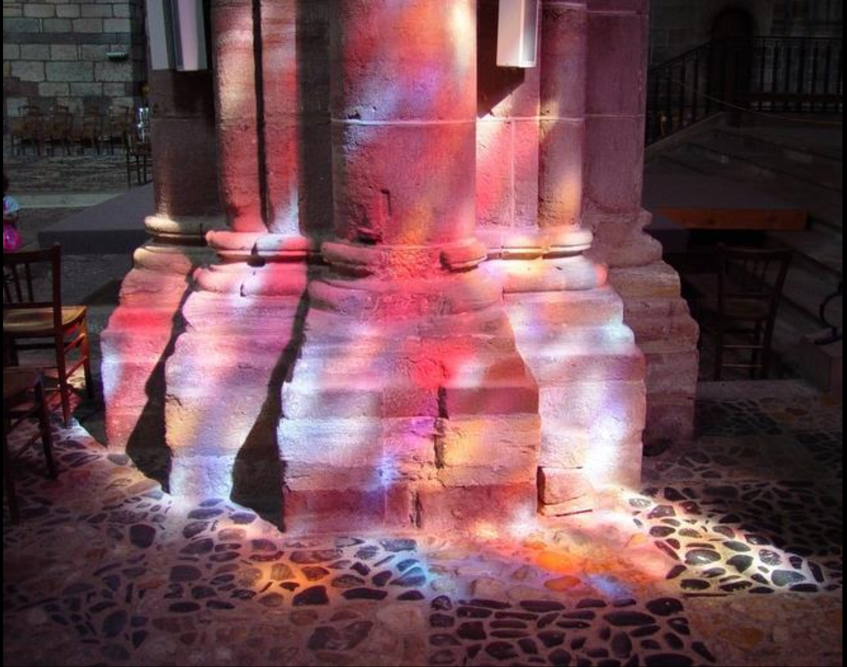
Interior Light -- Saint-Julien de Brioude, Brioude, France