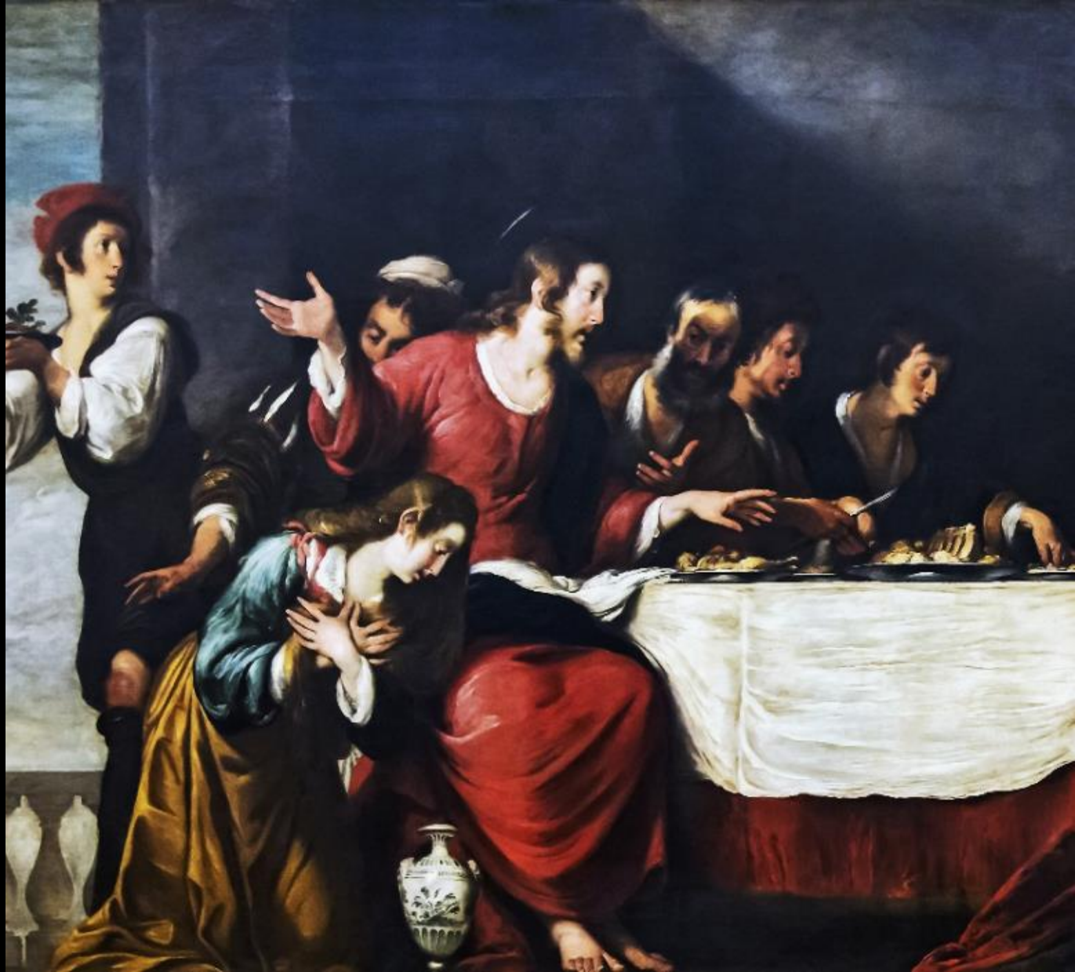
Banquet at the House of Simon

Bernardo Strozzi, Gallerie dell'Accademia, Venice, Italy