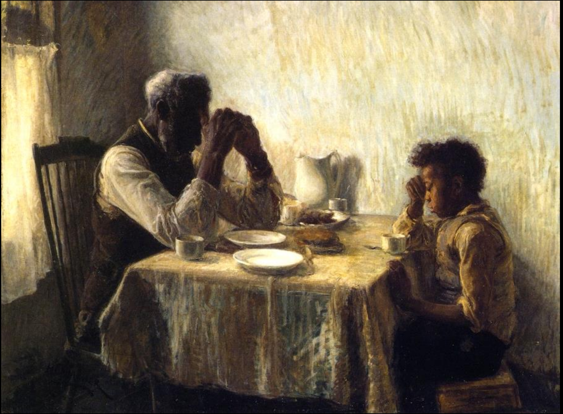
Giving Thanks -- Henry Ossawa Tanner