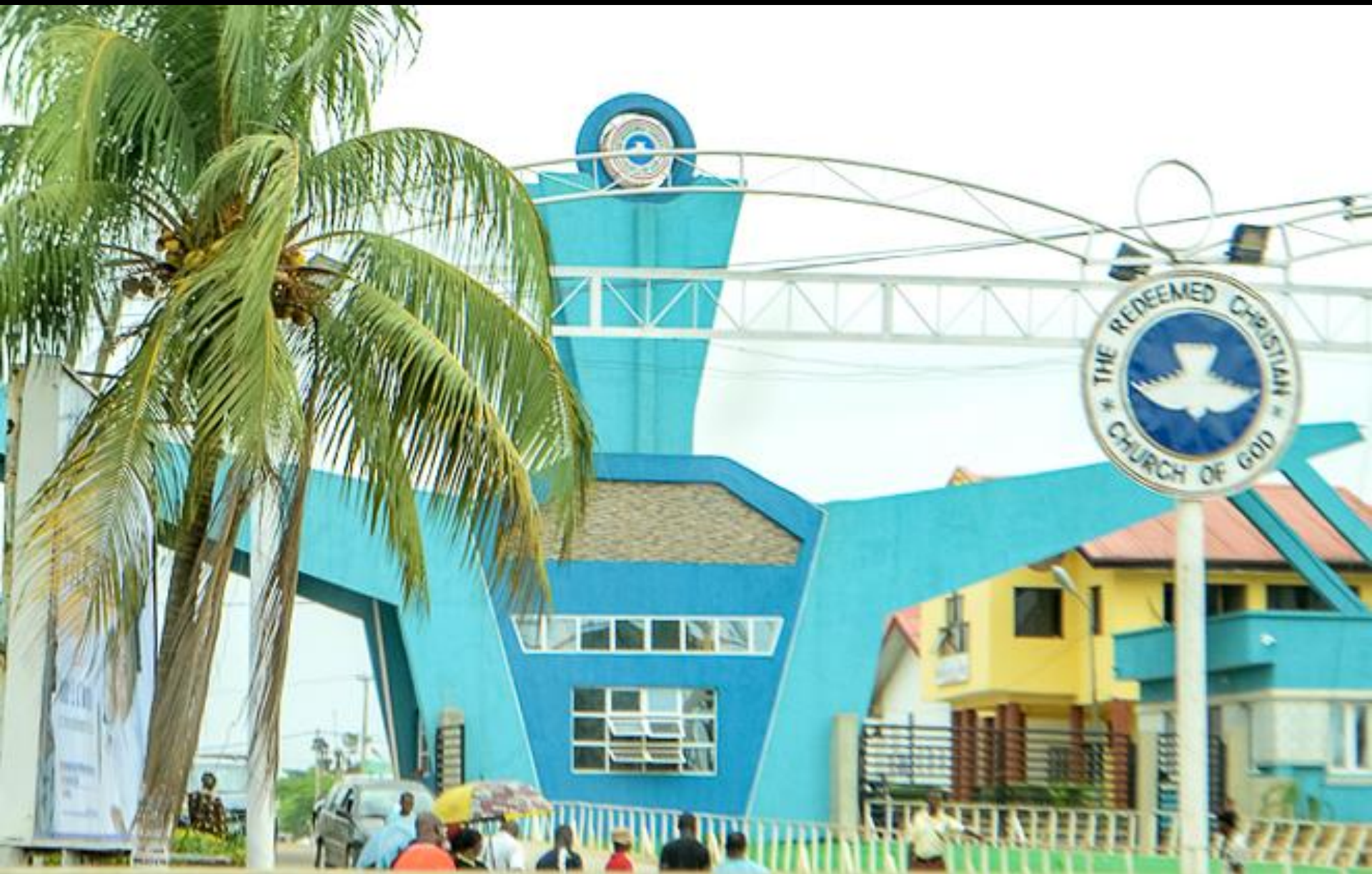
The Redeemed Christian Church of God, Lagos Nigeria