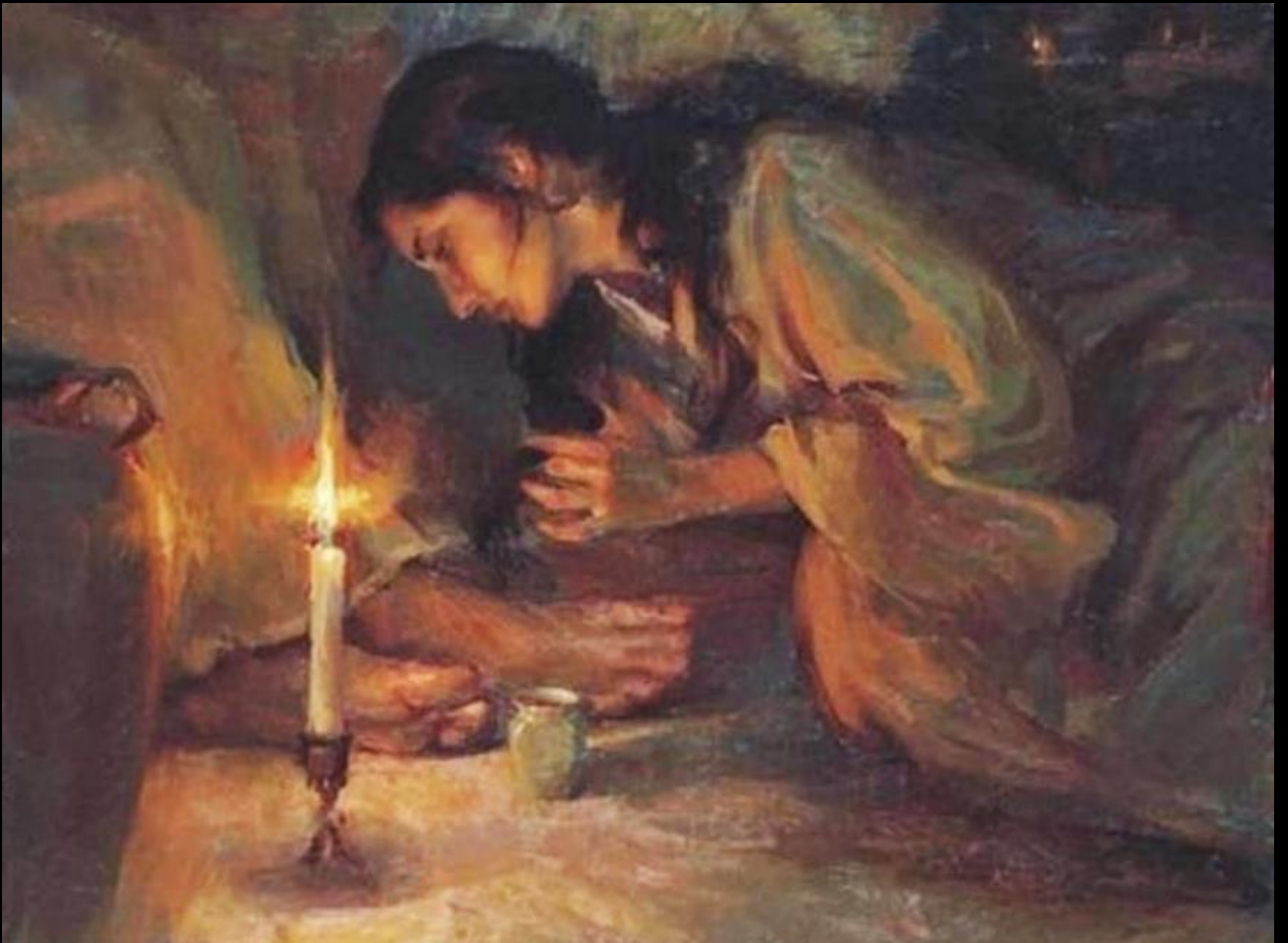
Mary Wipes Christ's Feet -- Unidentified Russian artist