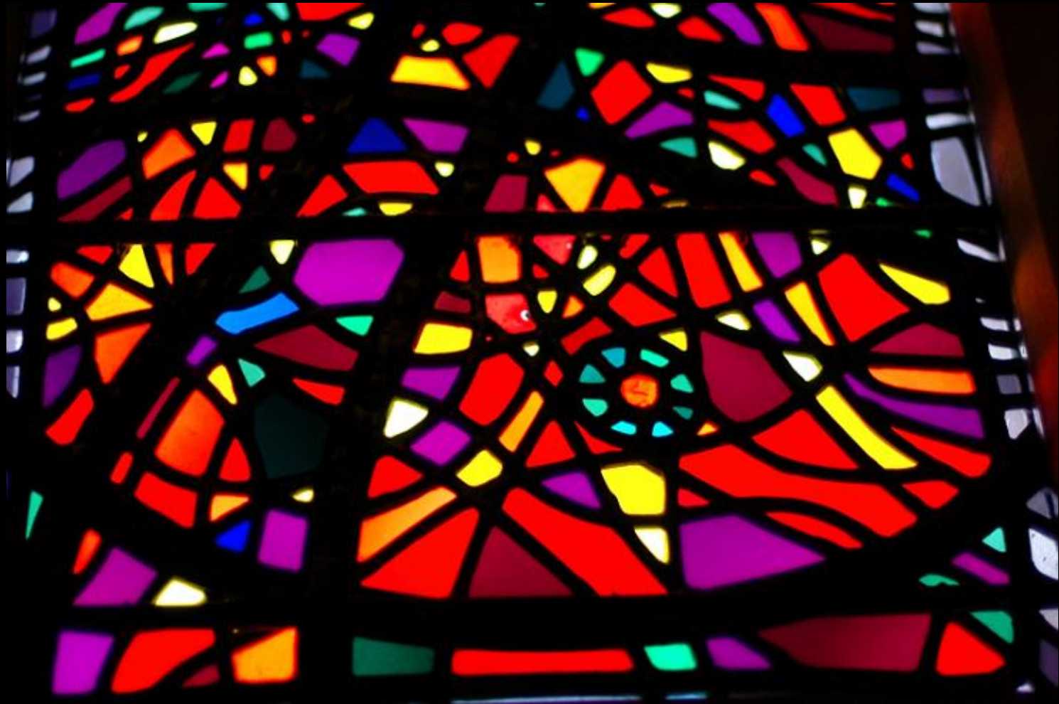
Light and Color -- Stained Glass Window, Washington National Cathedral, Washington, DC