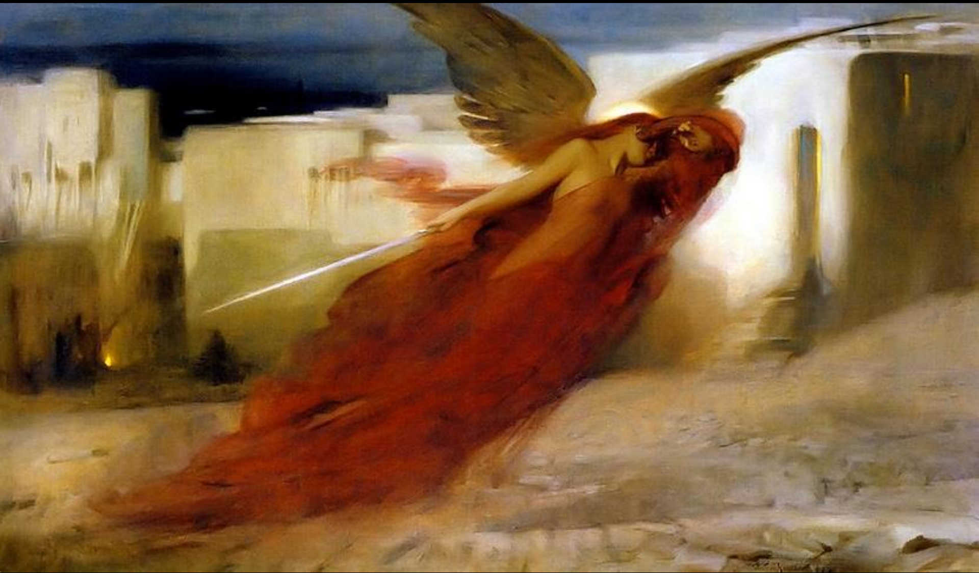
There Was a Great Cry in Egypt (Passover) -- Arthur Hacker