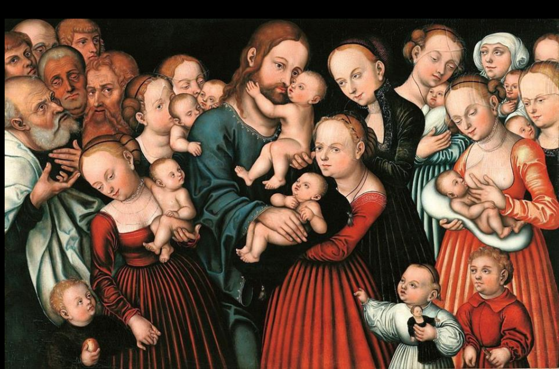
Christ Blessing the Children -- Lucas Cranach, Wawel Castle, Krakow, Poland