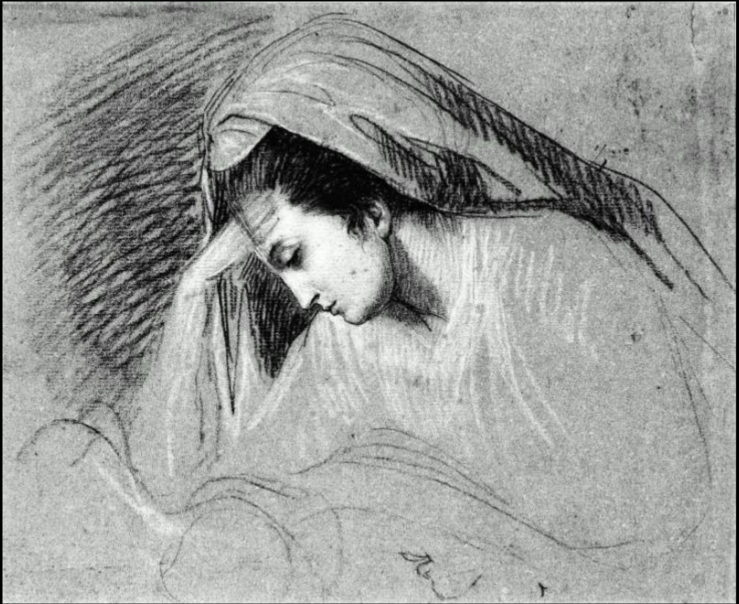
Study for the Head of the Virgin -- John Singleton Copley, Museum of Fine Arts, Boston, MA