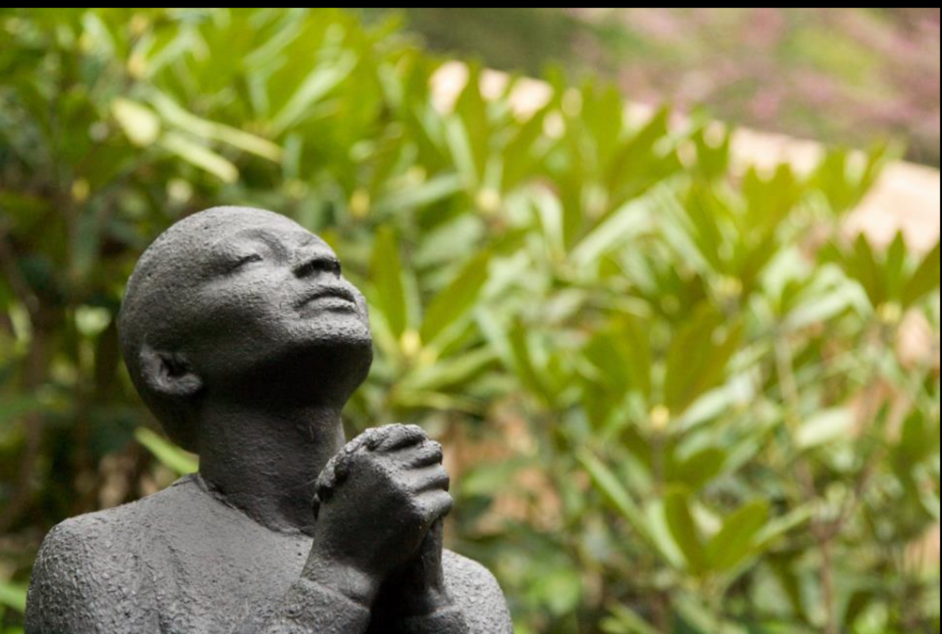
Rose McClendon in Prayer -- Richmond Barthe, Fallingwater, PA