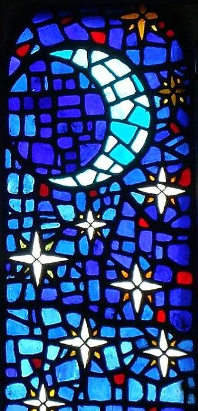
Moon and the Stars Window