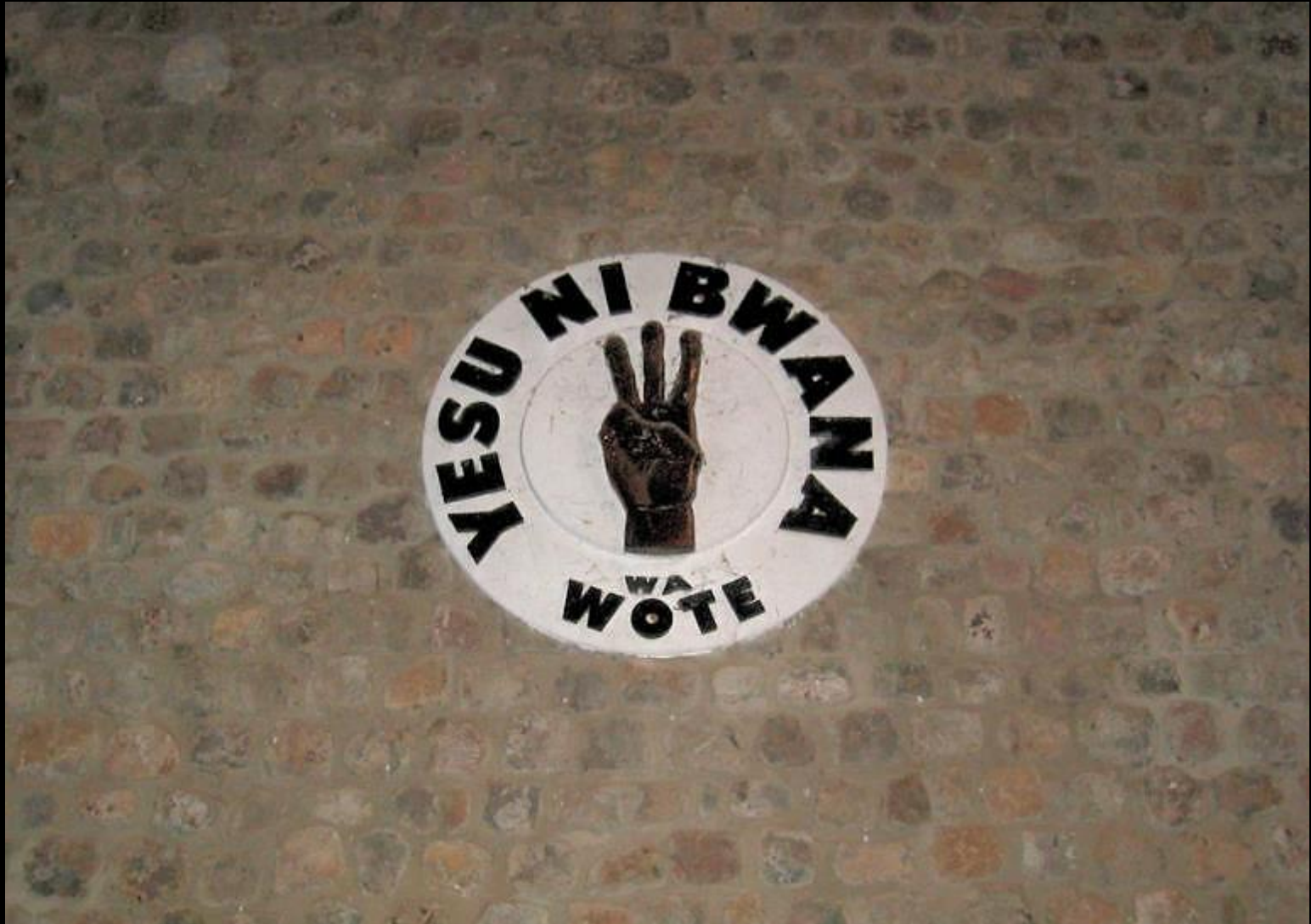
Jesus is Lord of All -- Panel in Chapel, Mulungwishi Mission, D. R. Congo