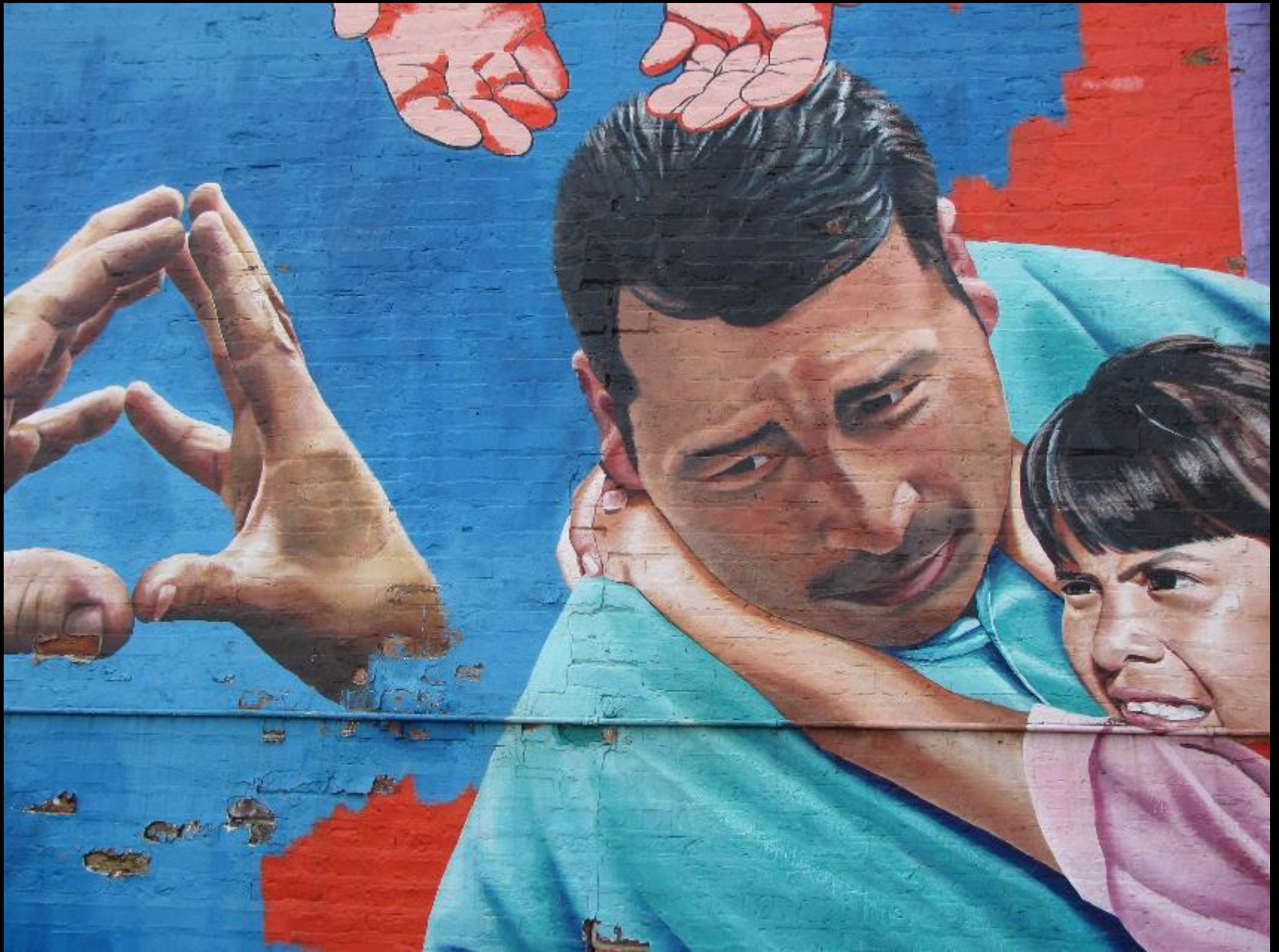
Father and Daughter -- Community Mural in Pilsen neighborhood, Chicago, IL