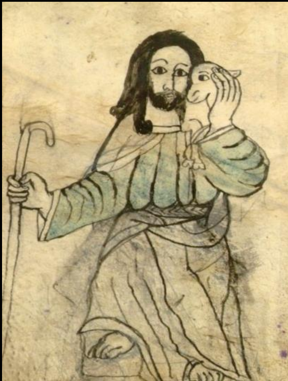
Jesus as Shepherd -- Ethiopia, 20 th c., Bibliotheque nationale de France, Paris, France