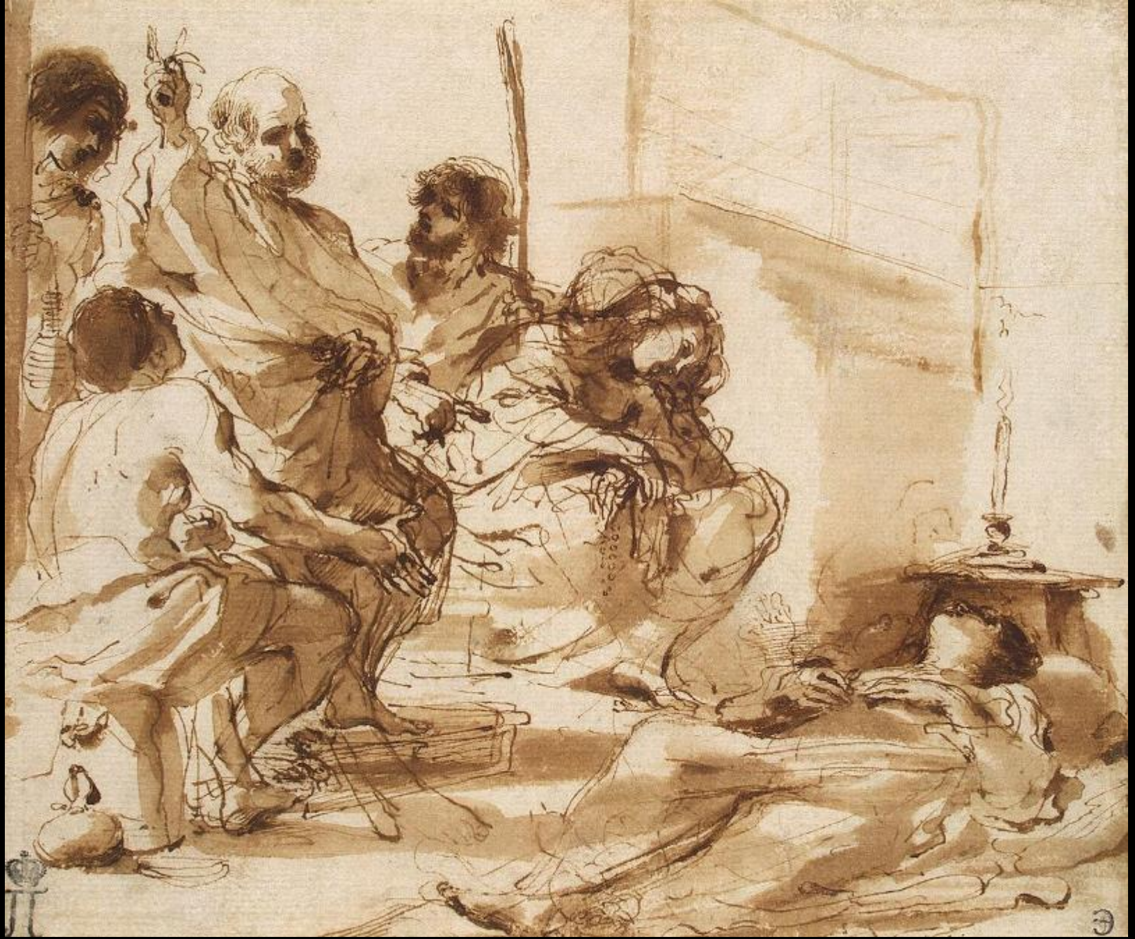
Raising of Tabitha -- Guercino, Hermitage, St. Petersburg, Russia