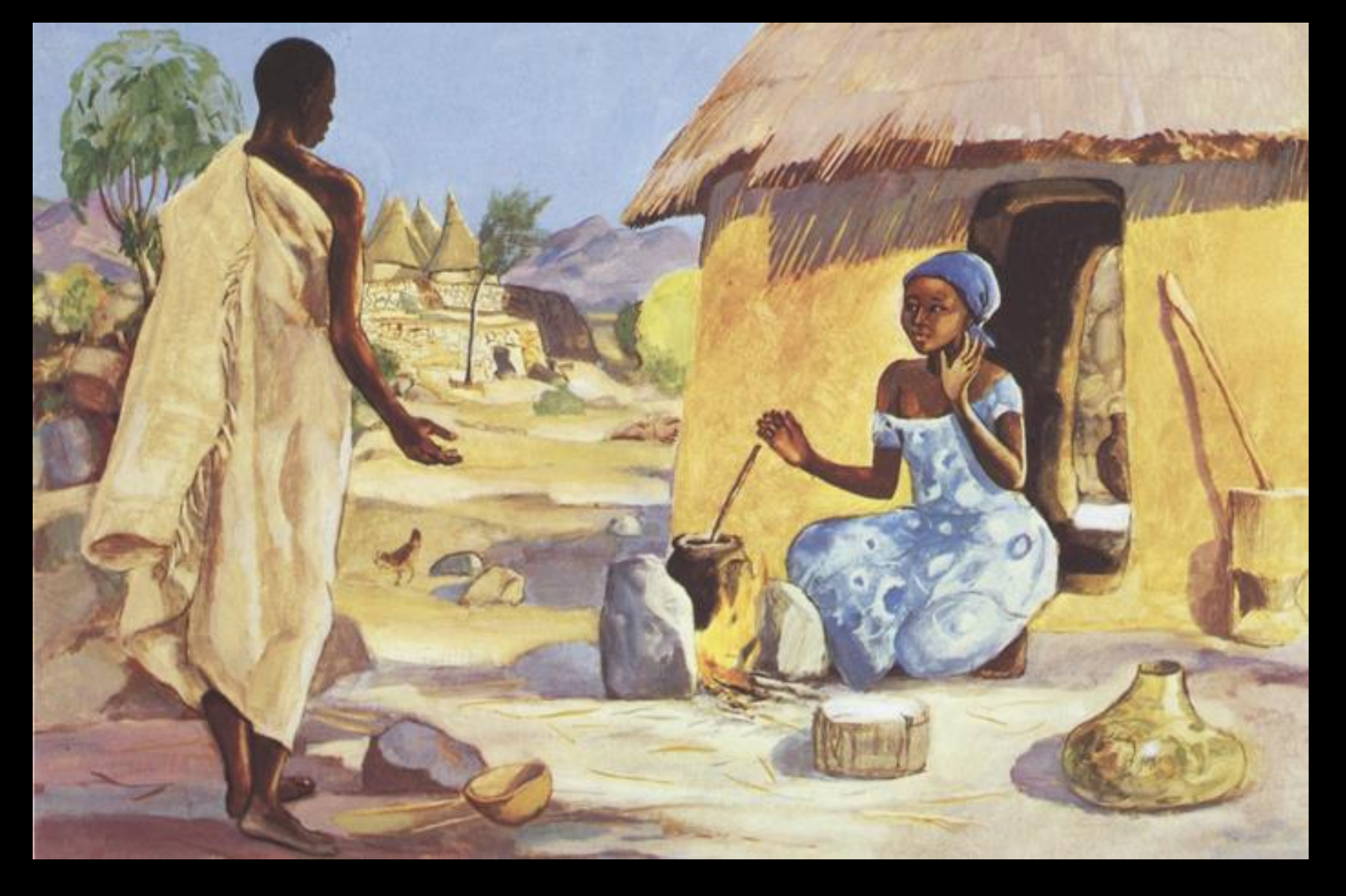
Annunciation -- JESUS MAFA, Cameroon