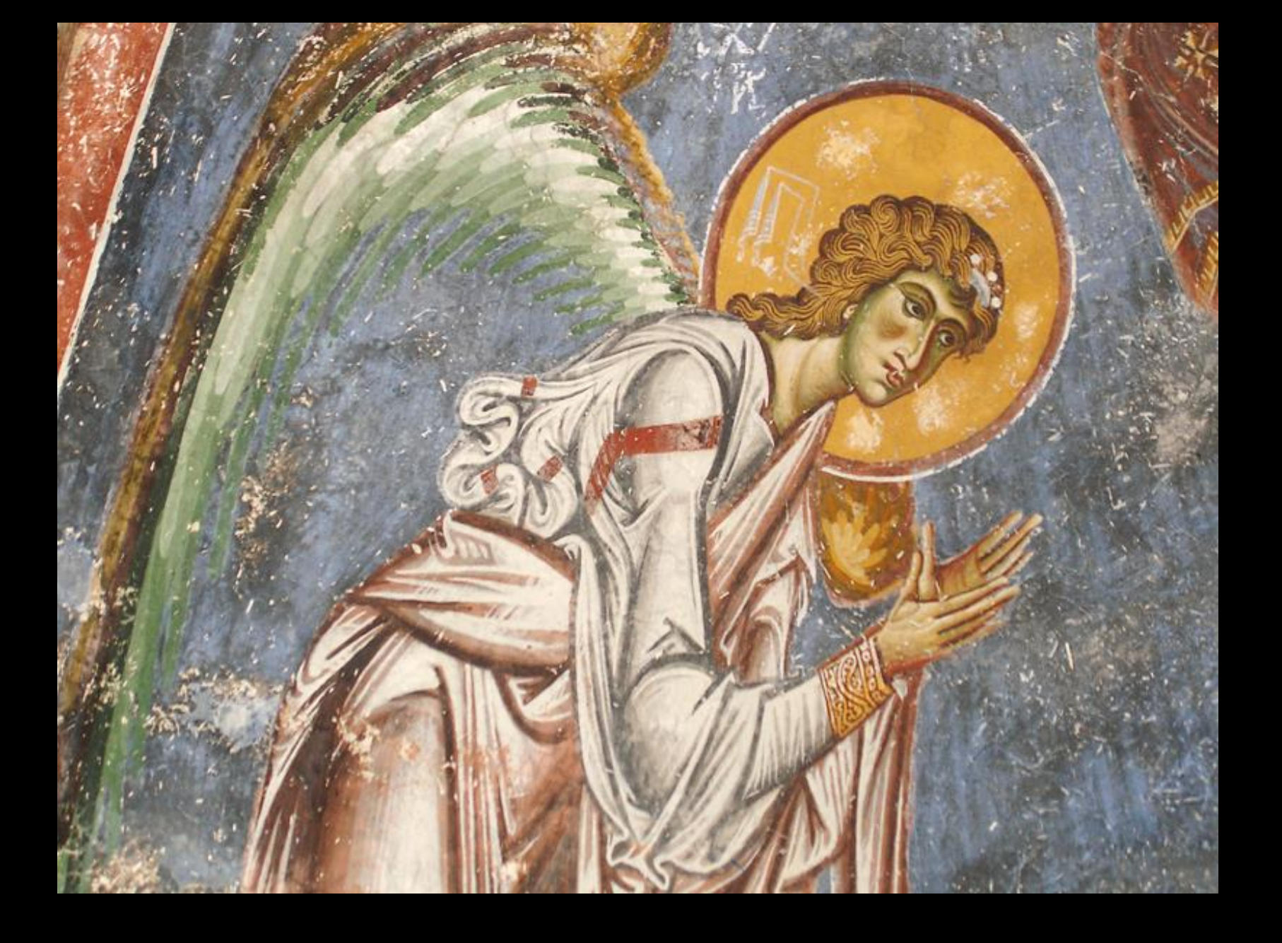
Gabriel -- St. George Church, Kurbinovo, Macedonia