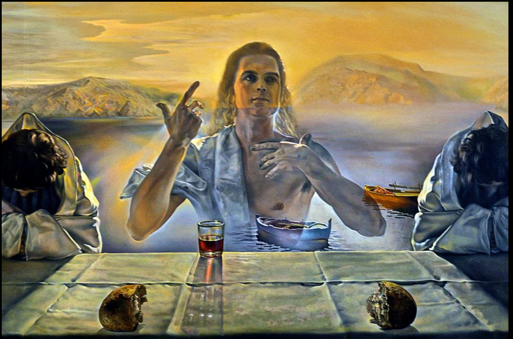
Last Supper, detail -- Salvador Dali, National Gallery of Art, Washington, DC