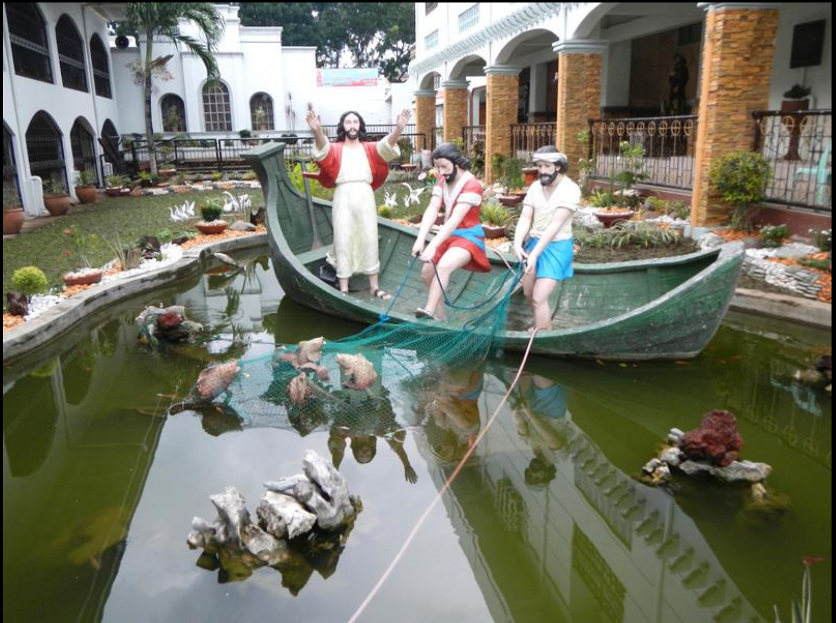
Christ Calling the Disciples -- Nuestra Senora de la Candelaria, Candelaria, Philippines