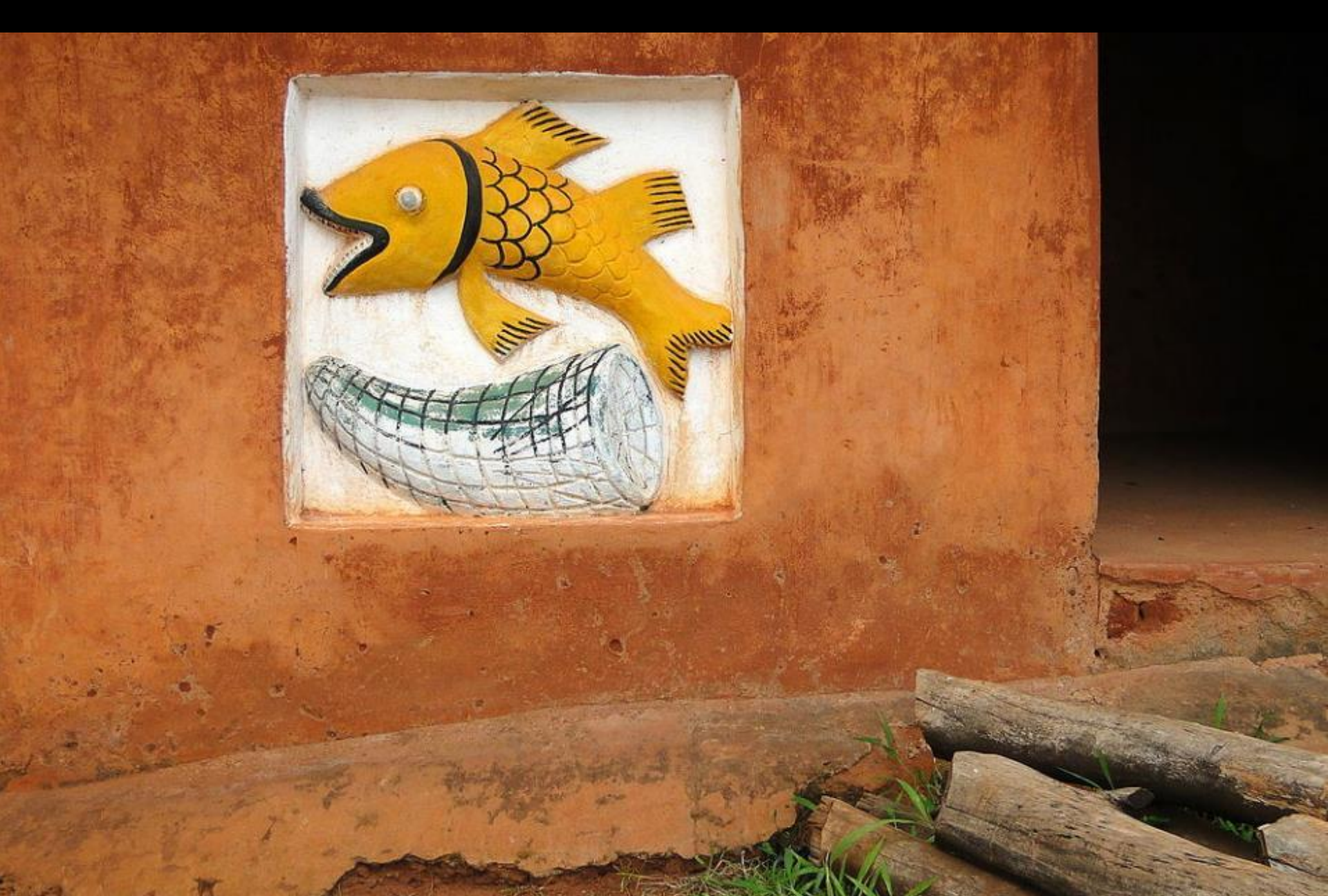
Fish Symbol on Shrine Wall -- Abomey, Benin