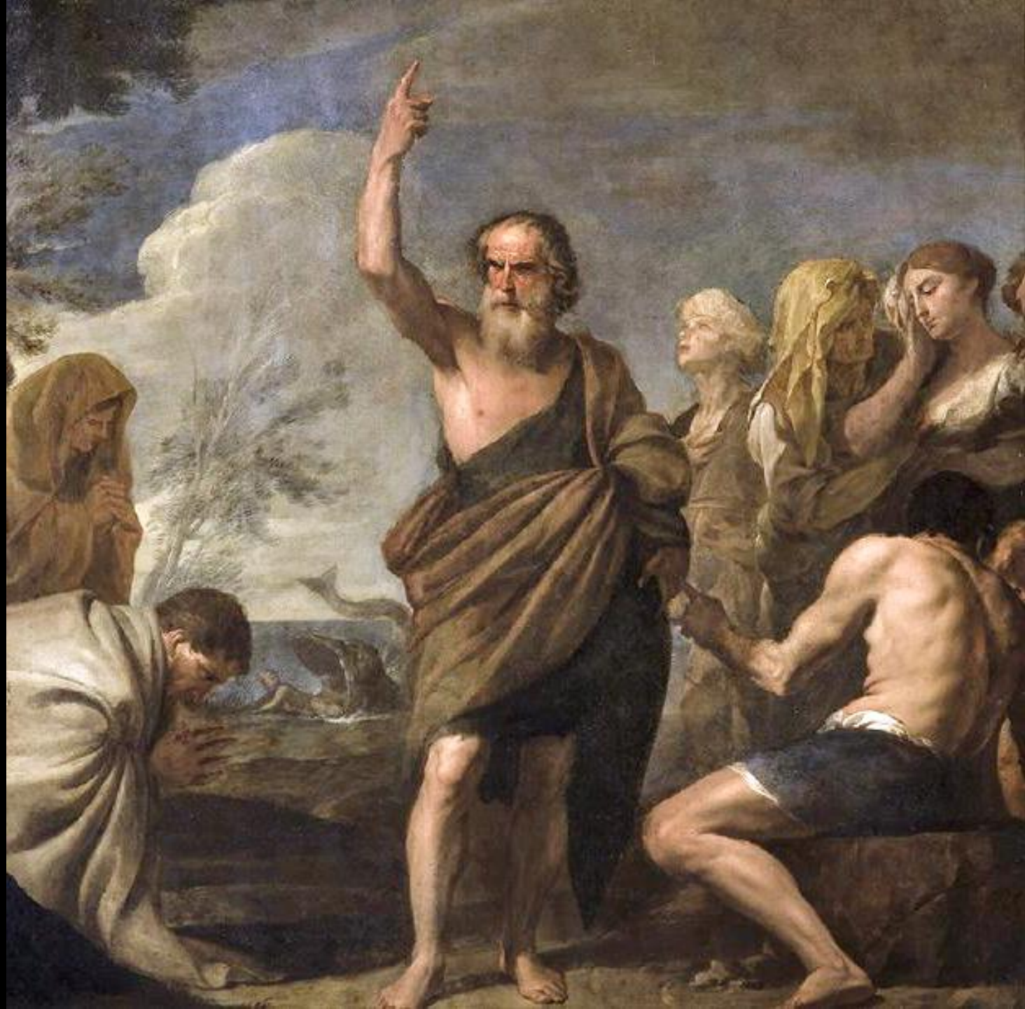
Jonah Preaching to the People of Nineveh