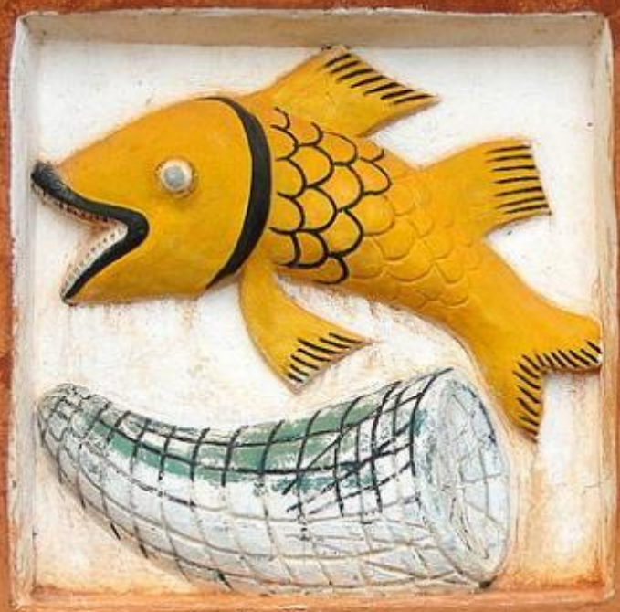
Fish Symbol on Shrine Wall -- Abomey, Benin