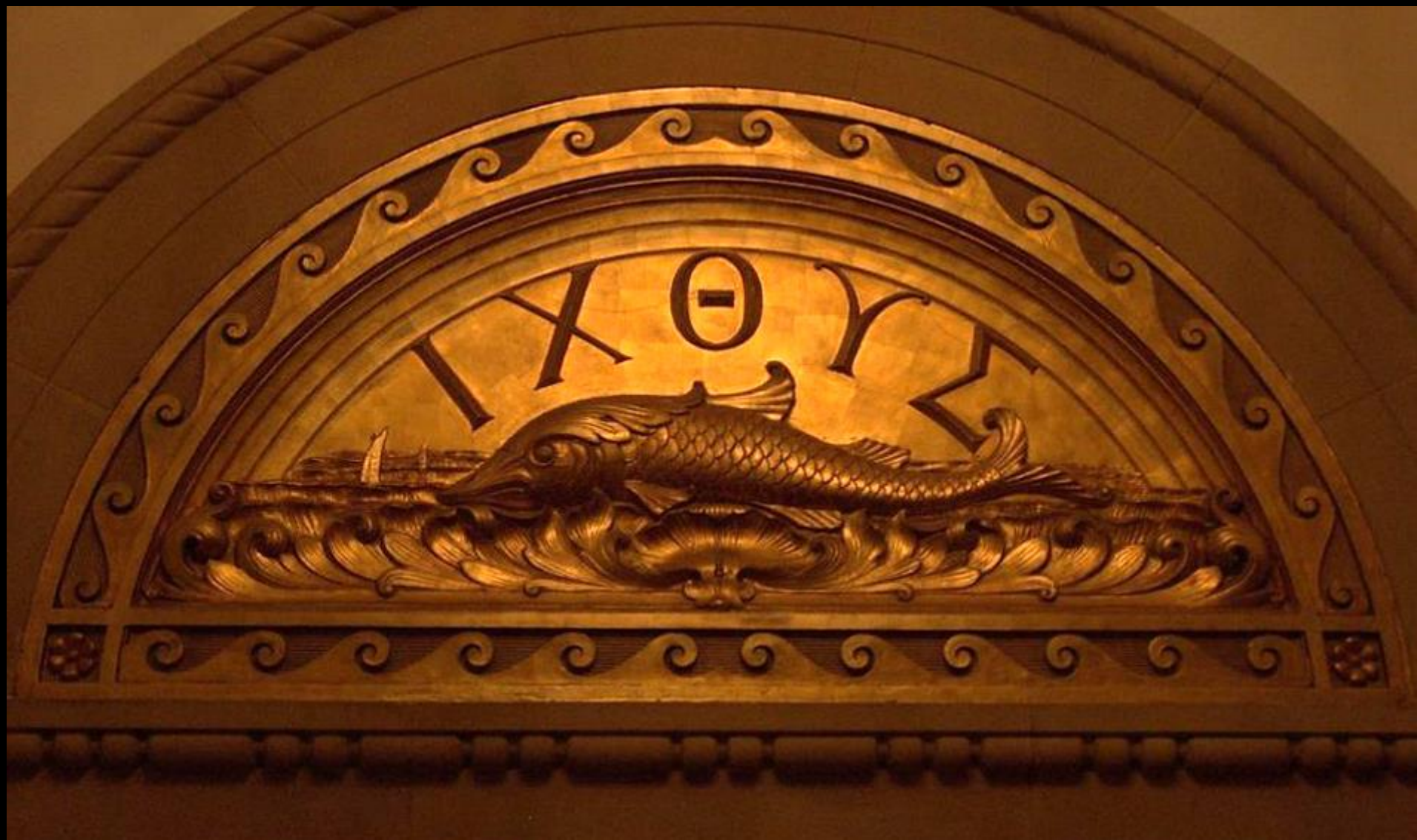
Ixthus Door -- Brite Divinity School, Texas Christian University, Fort Worth, TX