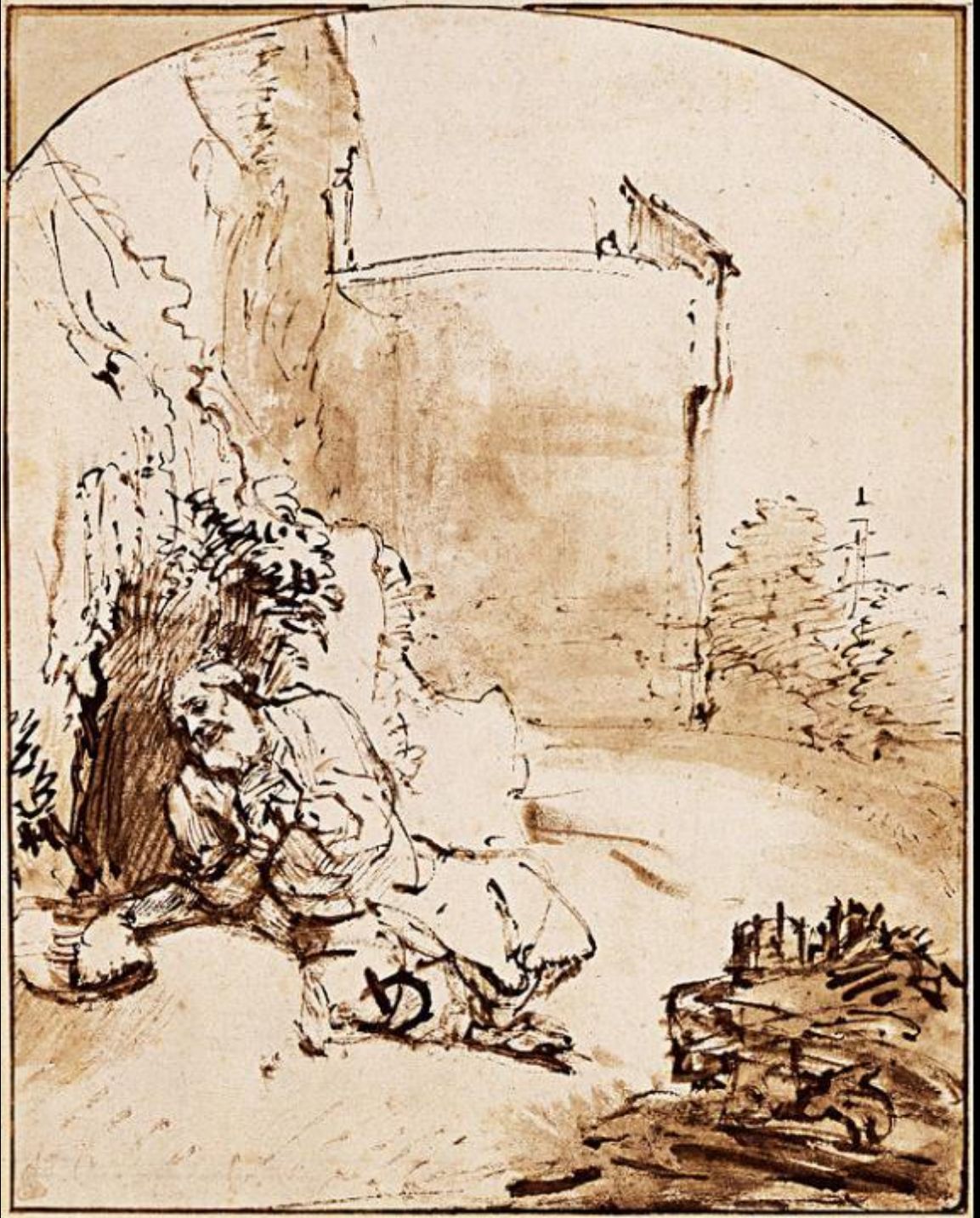
The Prophet Jonah before the Walls of Nineveh

Rembrandt Albertina Museum Vienna, Austria