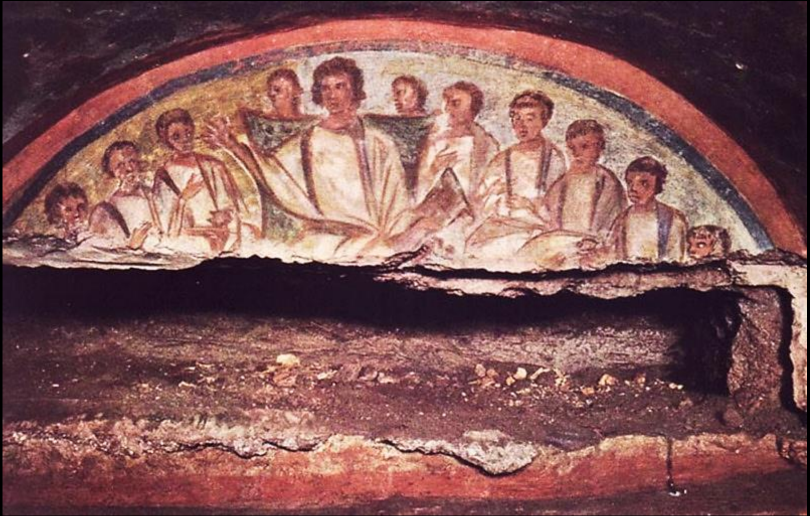
Christ as Teacher (Traditio Legis) -- Catacombs, mid 3 rd century, Rome, Italy