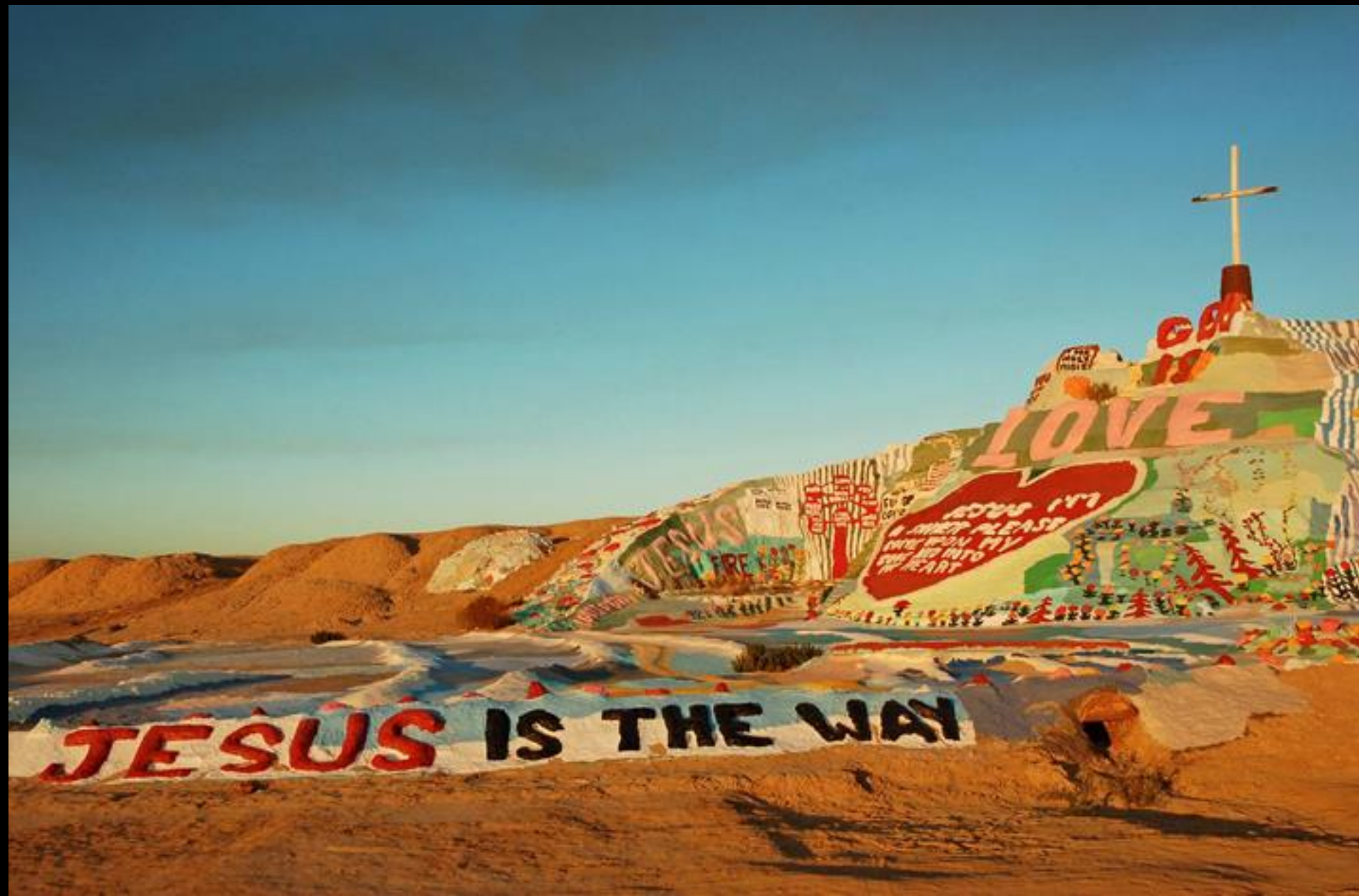
Salvation Mountain -- Leonard Knight, Niland, CA