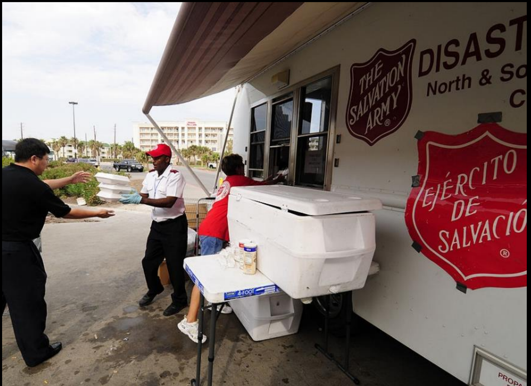
Salvation Army Disaster Relief, Galveston, TX, 2008