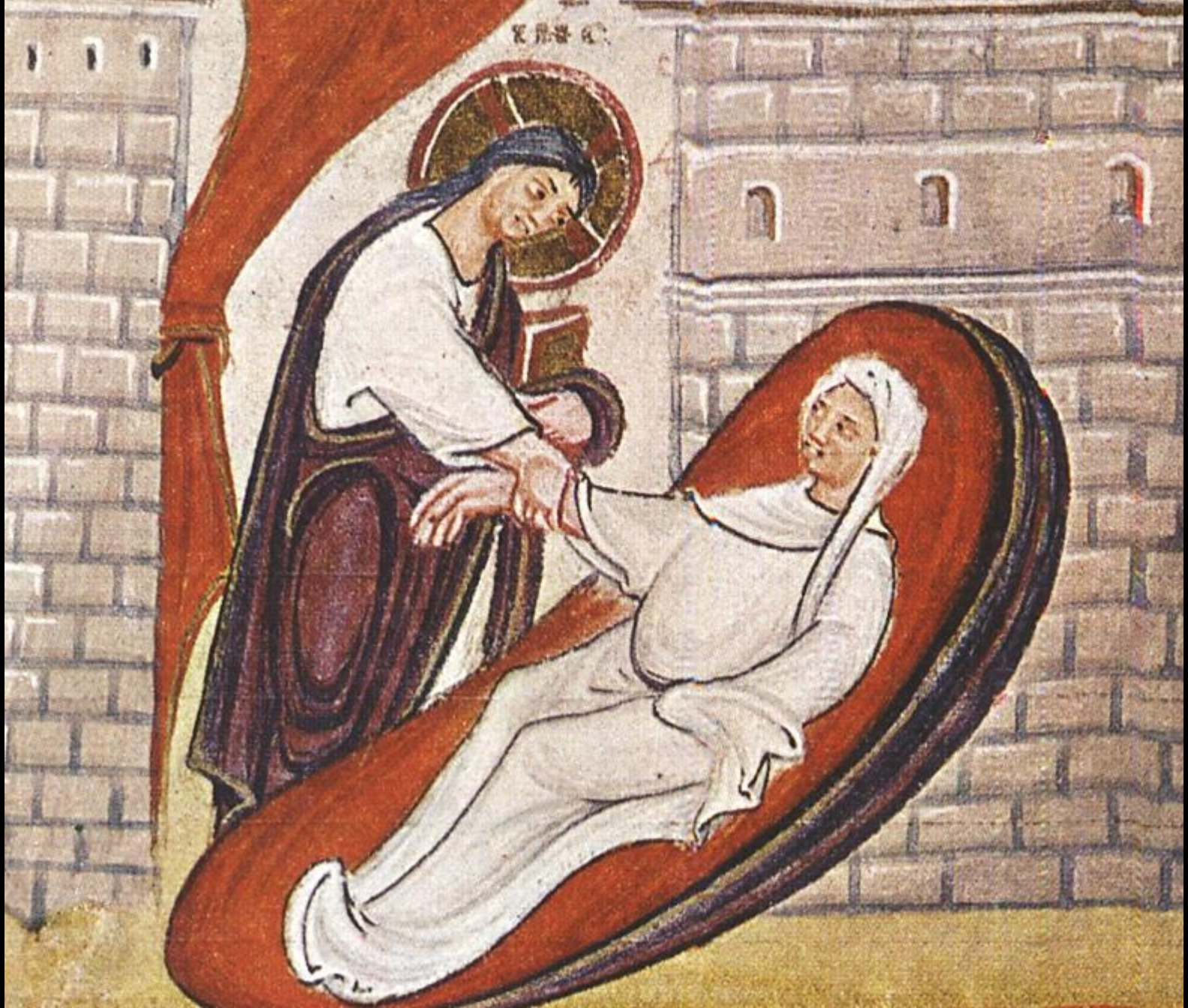
Christ Raising the Daughter of Jairus -- Codex Egberti, 10 th c., Stadtbibliothek, Trier, Germany