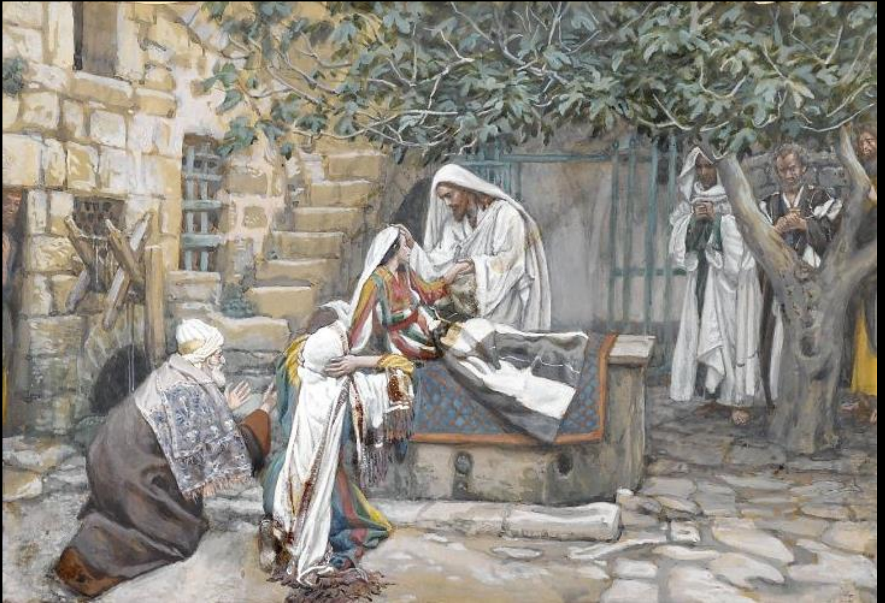
The Daughter of Jairus -- James Tissot, Brooklyn Museum, New York, NY