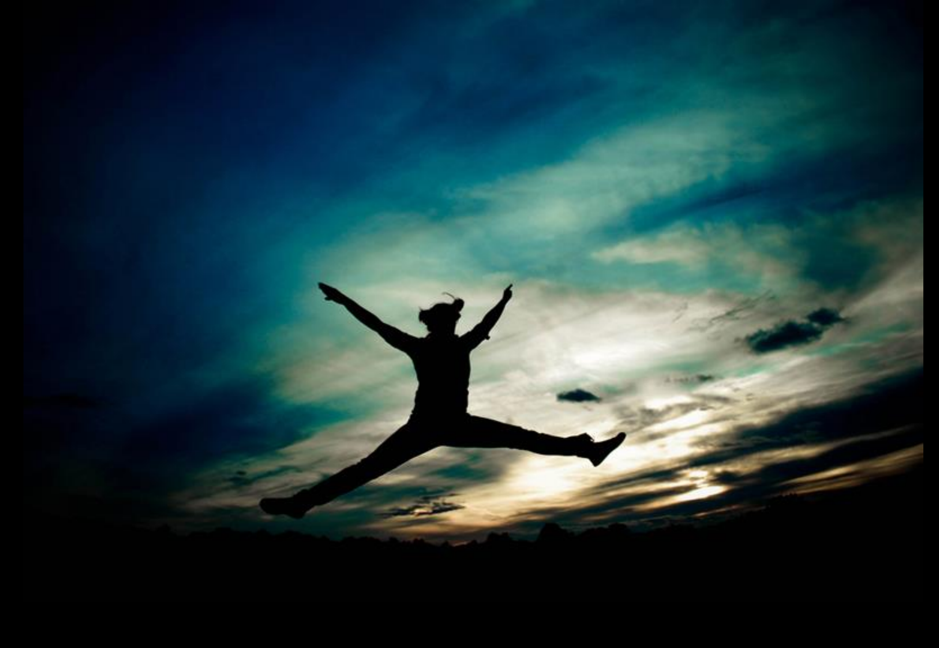
Power in the Skies -- Photograph, 2009