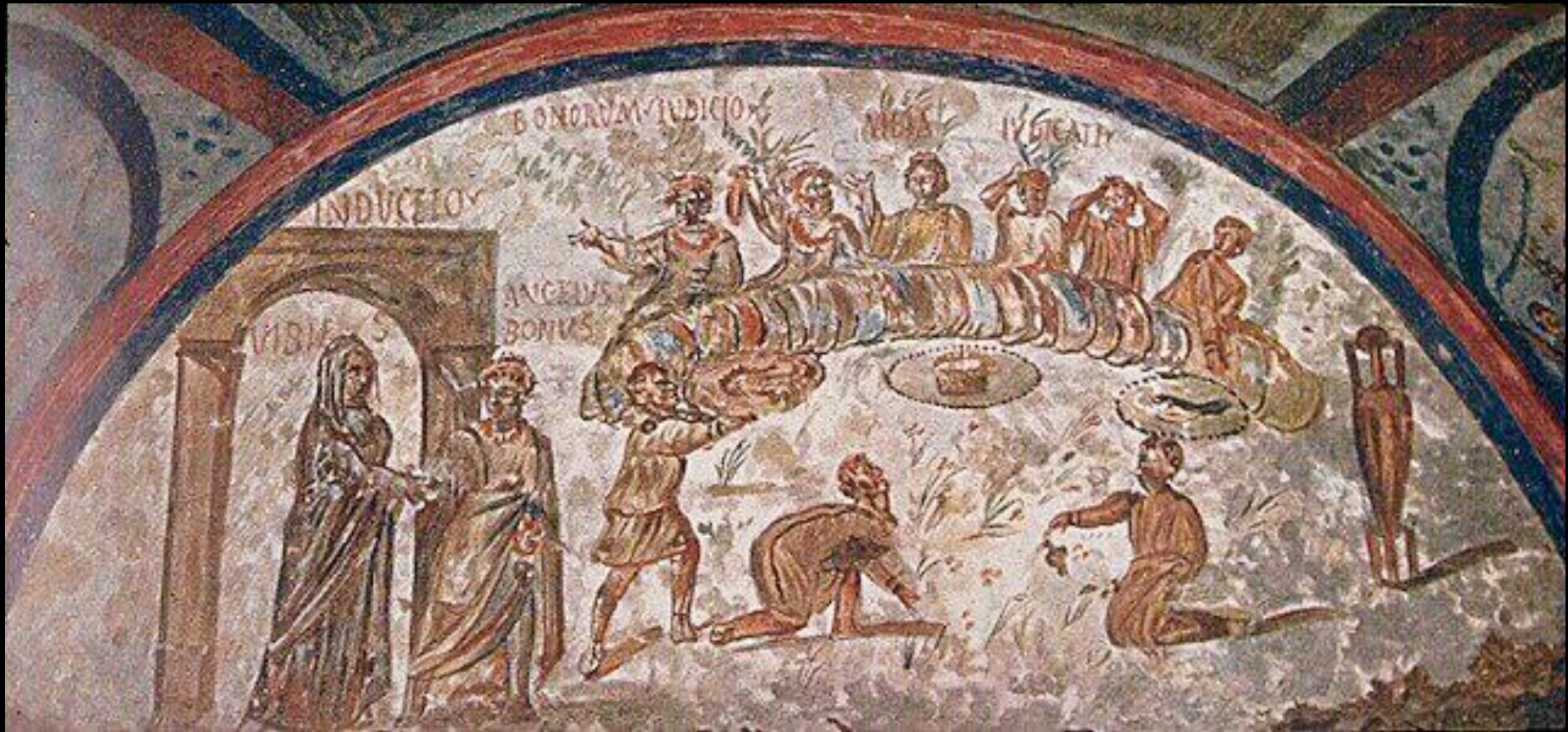
Agape Meal -- 3 rd century, Catacomb of Domitilla, Rome, Italy