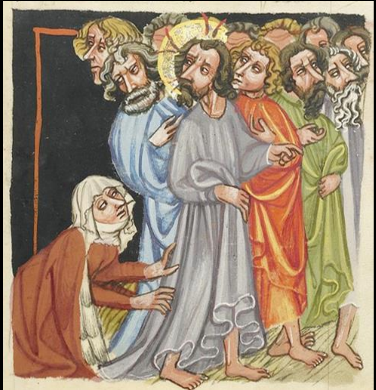
Healing of the Woman with an Issue of Blood

15 th c. manuscript