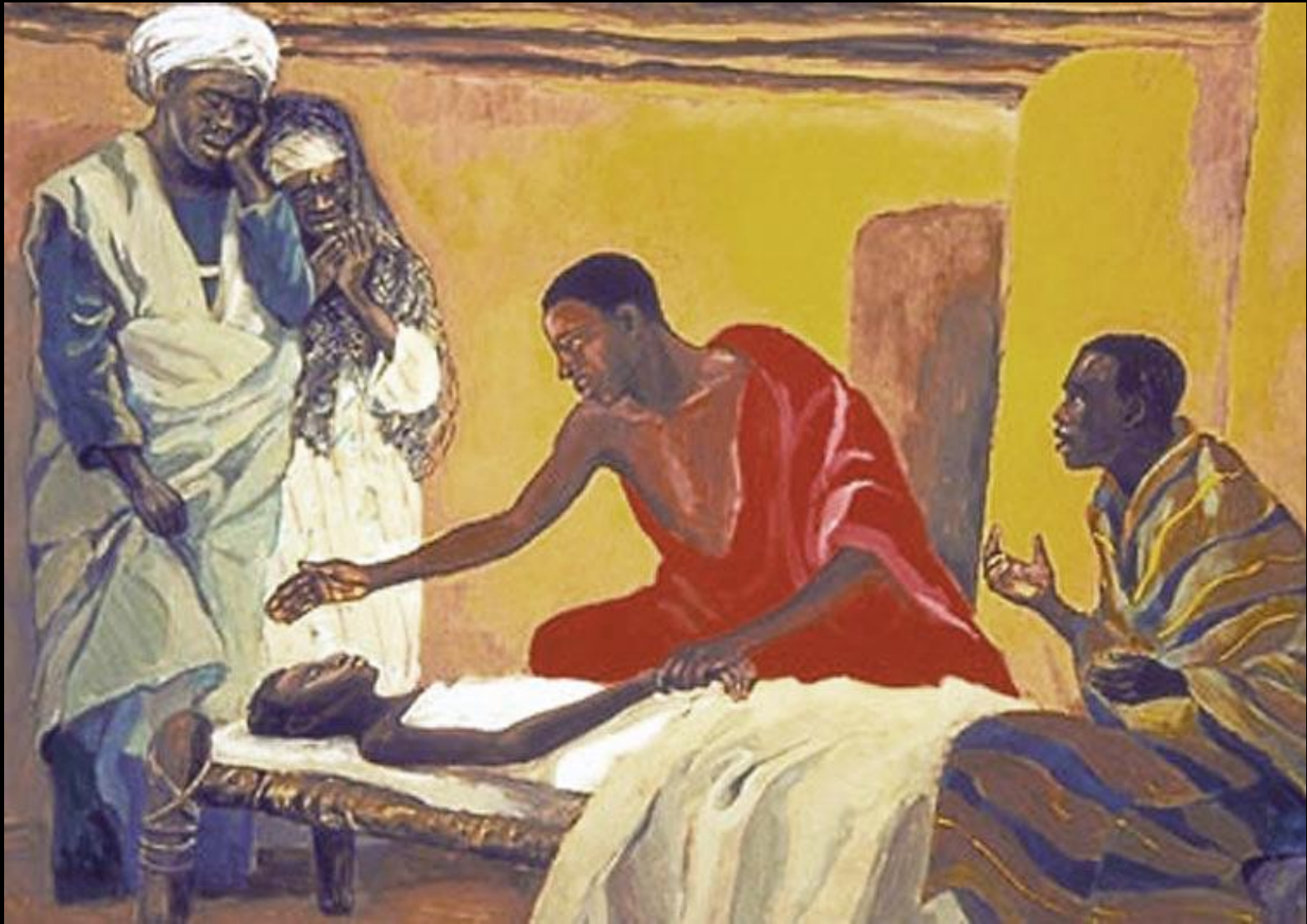
Healing of the Daughter of Jairus -- JESUS MAFA