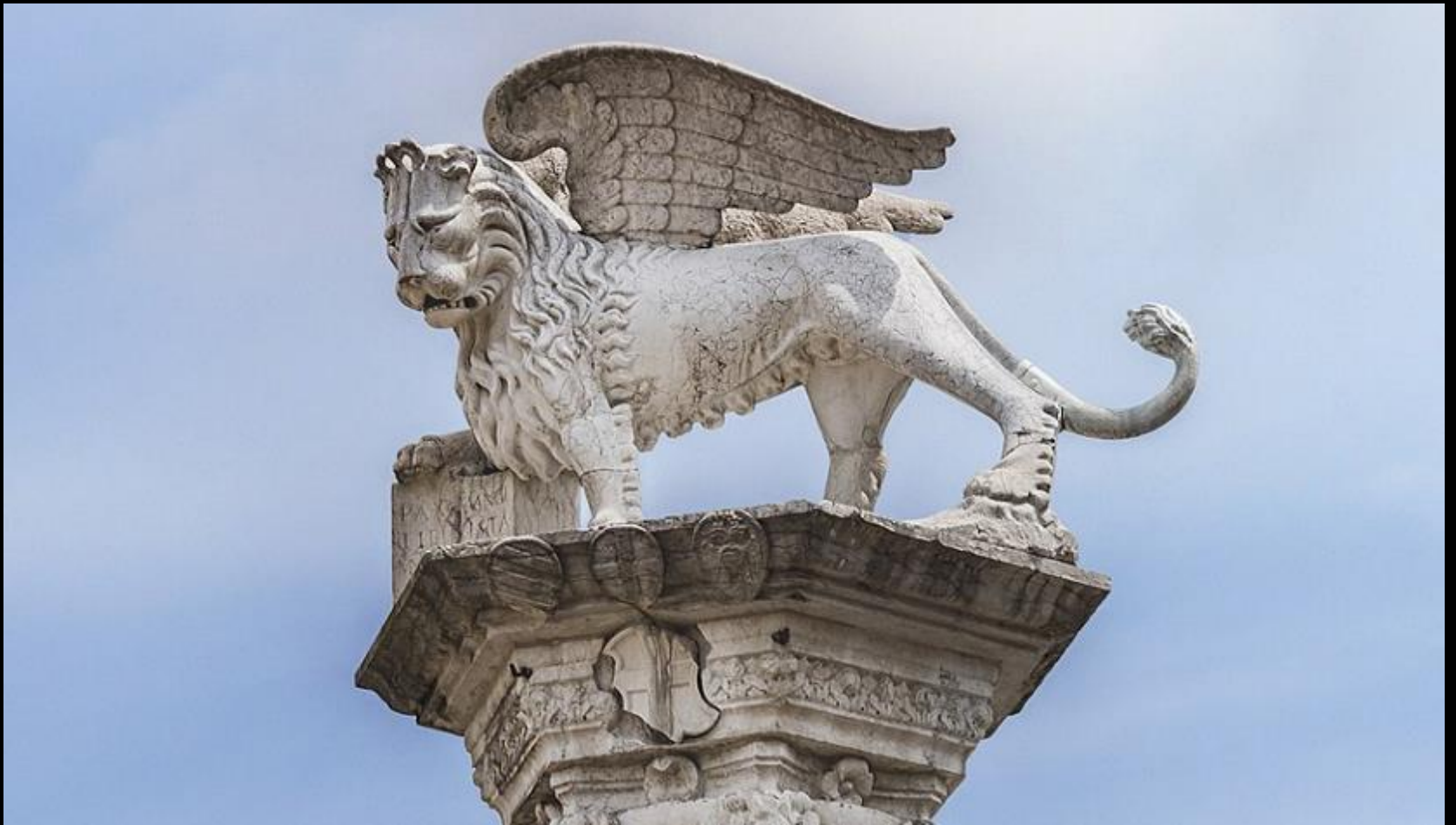
Lion, Symbol of St. Mark and of the Gospel of Mark -- Piazza dei Signori, Venice, Italy