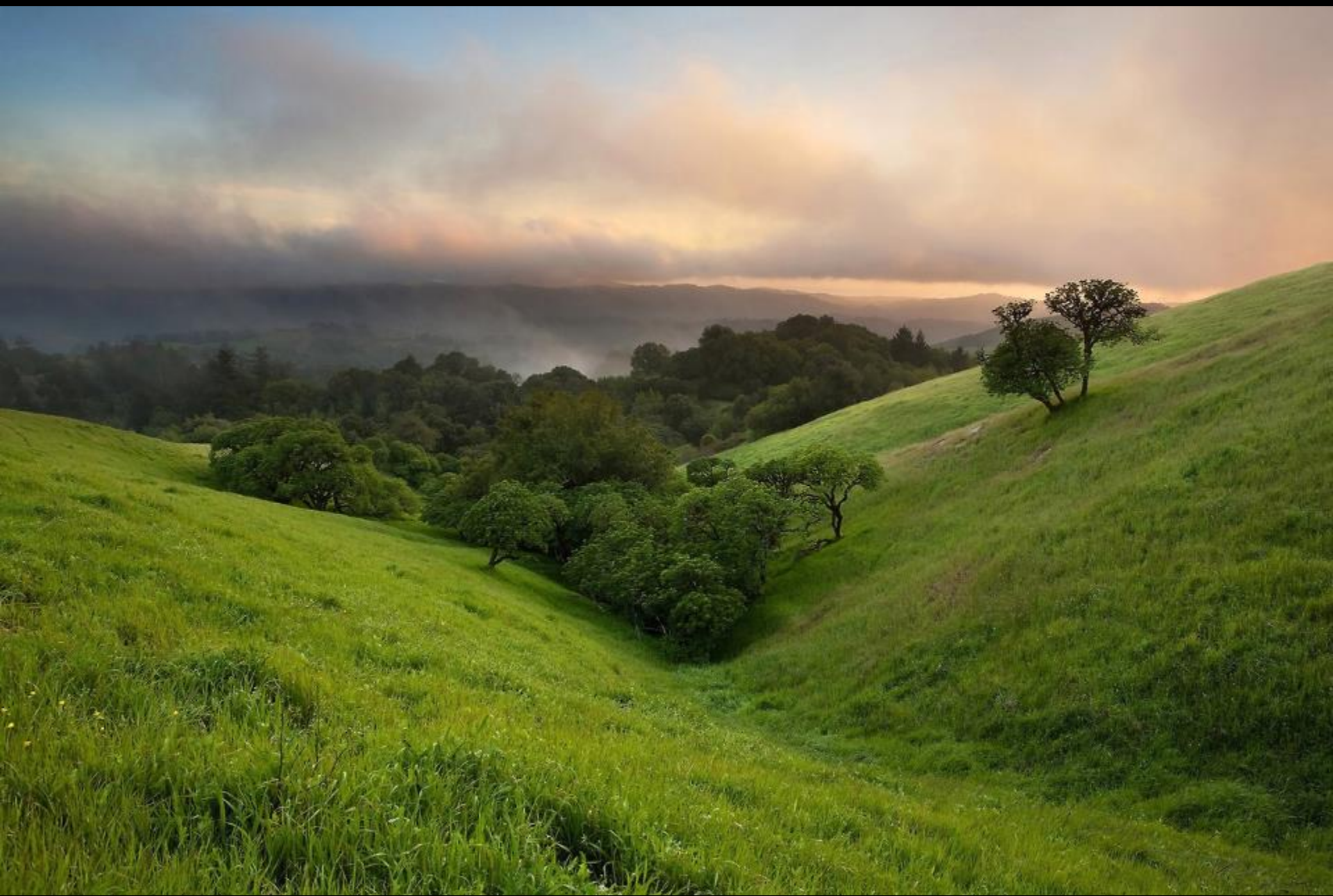
Earth's Beauty-- Russian Ridge Open Space, California