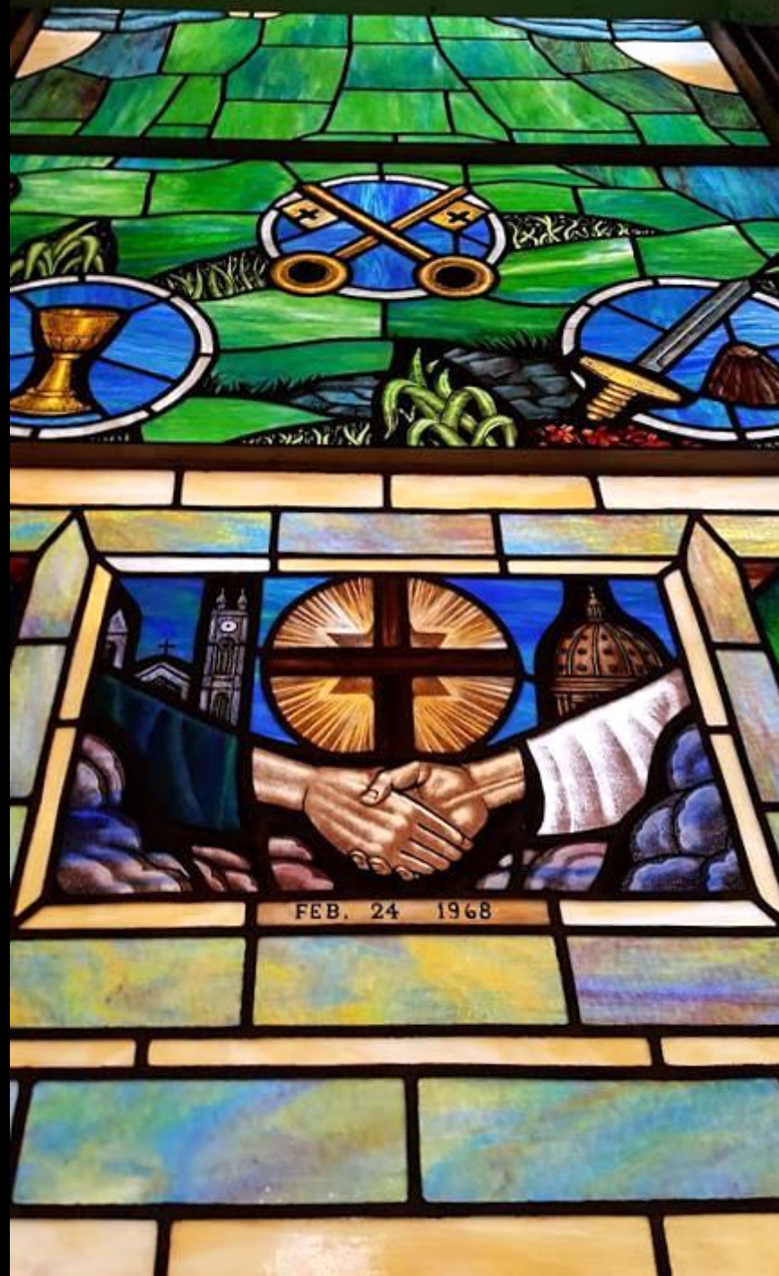
The Ecumenical Window