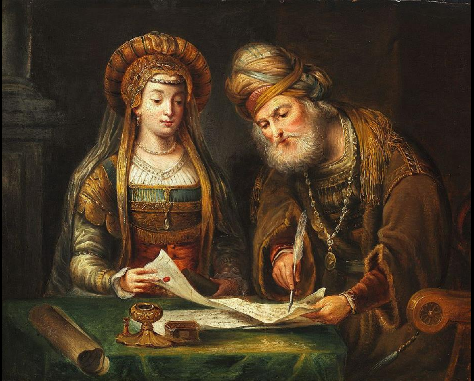
Esther and Mordecai -- Aert de Gelder, Brandeis University, Boston, MA