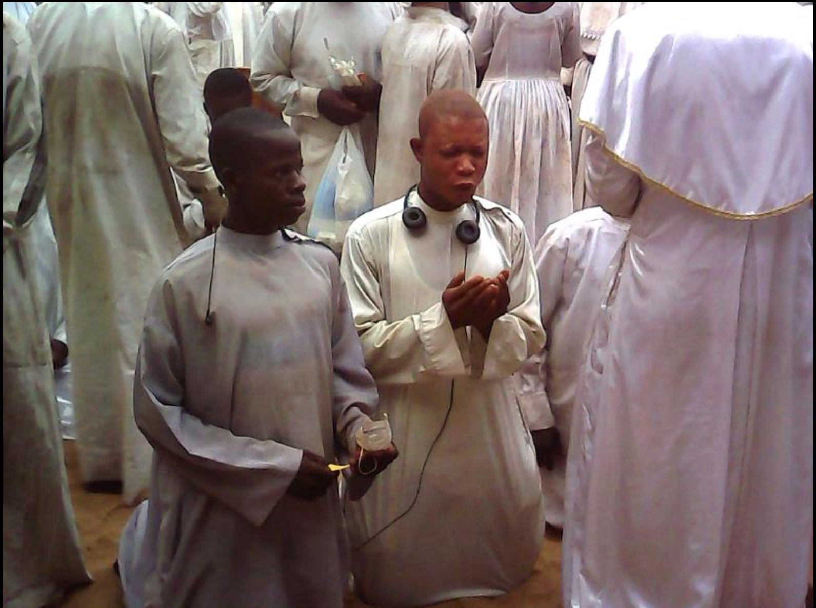
Pilgrimage Prayer -- Seme, Senegal