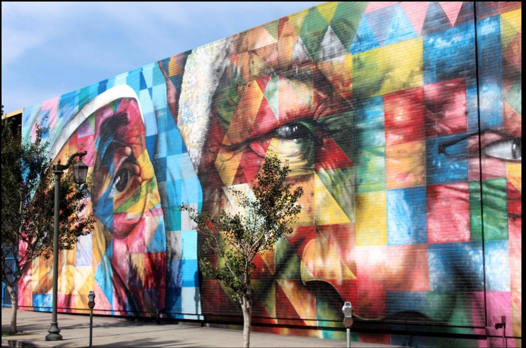
Looking for Peace (Mother Teresa, Nelson Mandela) -- Eduardo Kobra, Los Angeles, CA