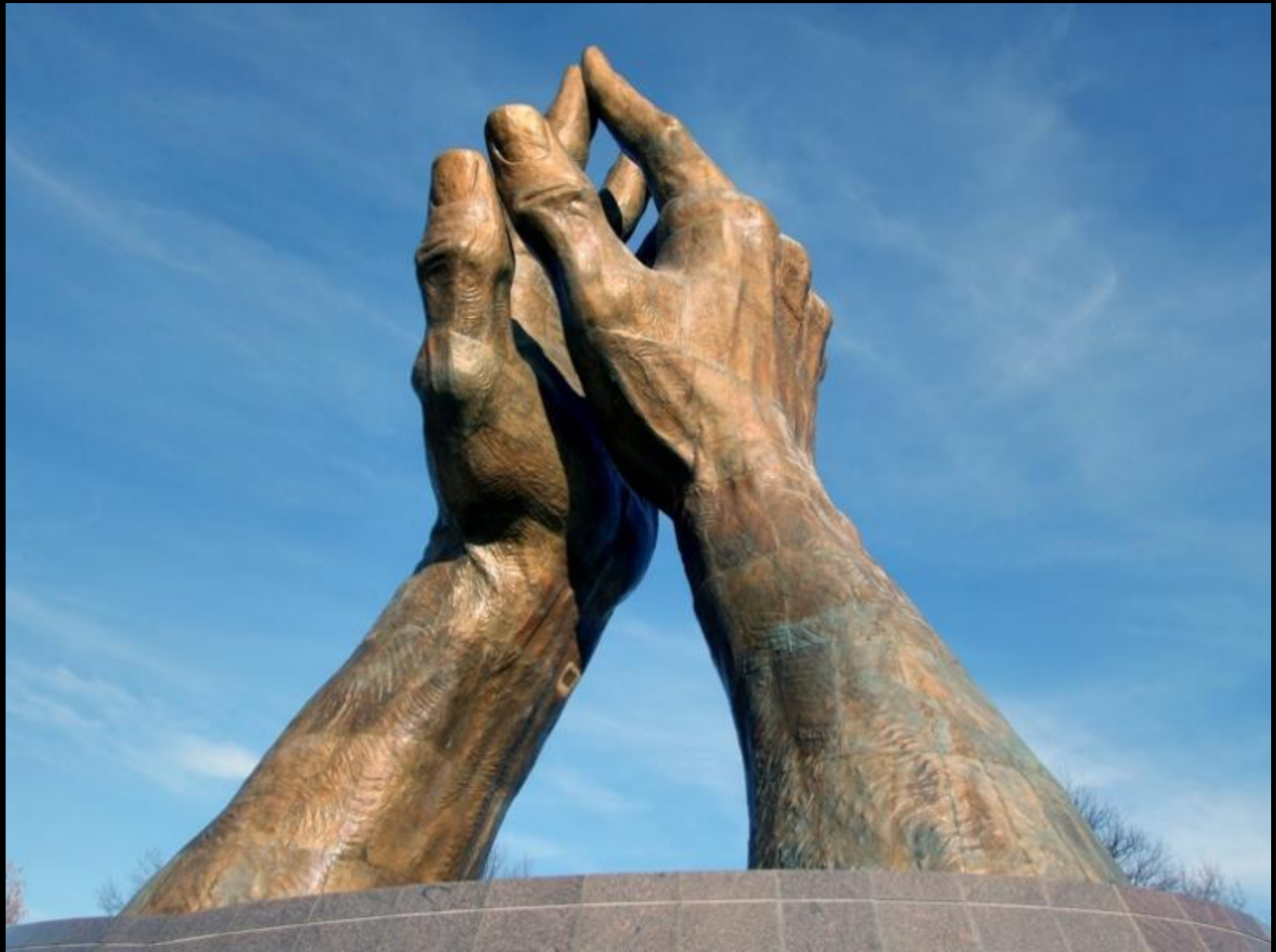
Healing Hands -- Oral Roberts University, Tulsa, Oklahoma