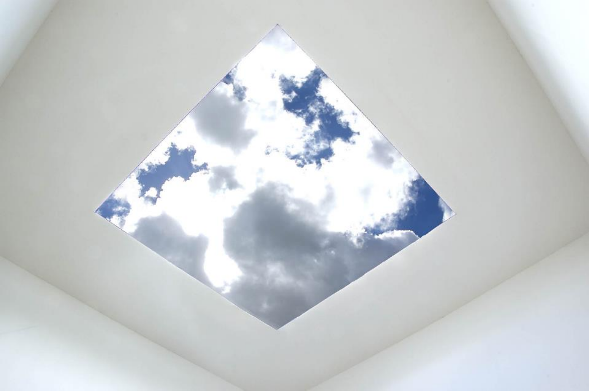
Skyspace -- James Turrell, Live Oak Meeting House, Houston, TX