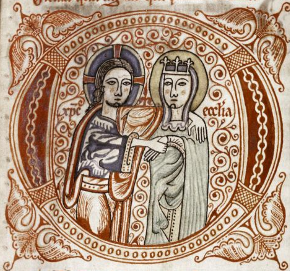
Christ and Ecclesia

Omnia precellit xpi dilectio pl Oscula qua signat que poscunt corda serena