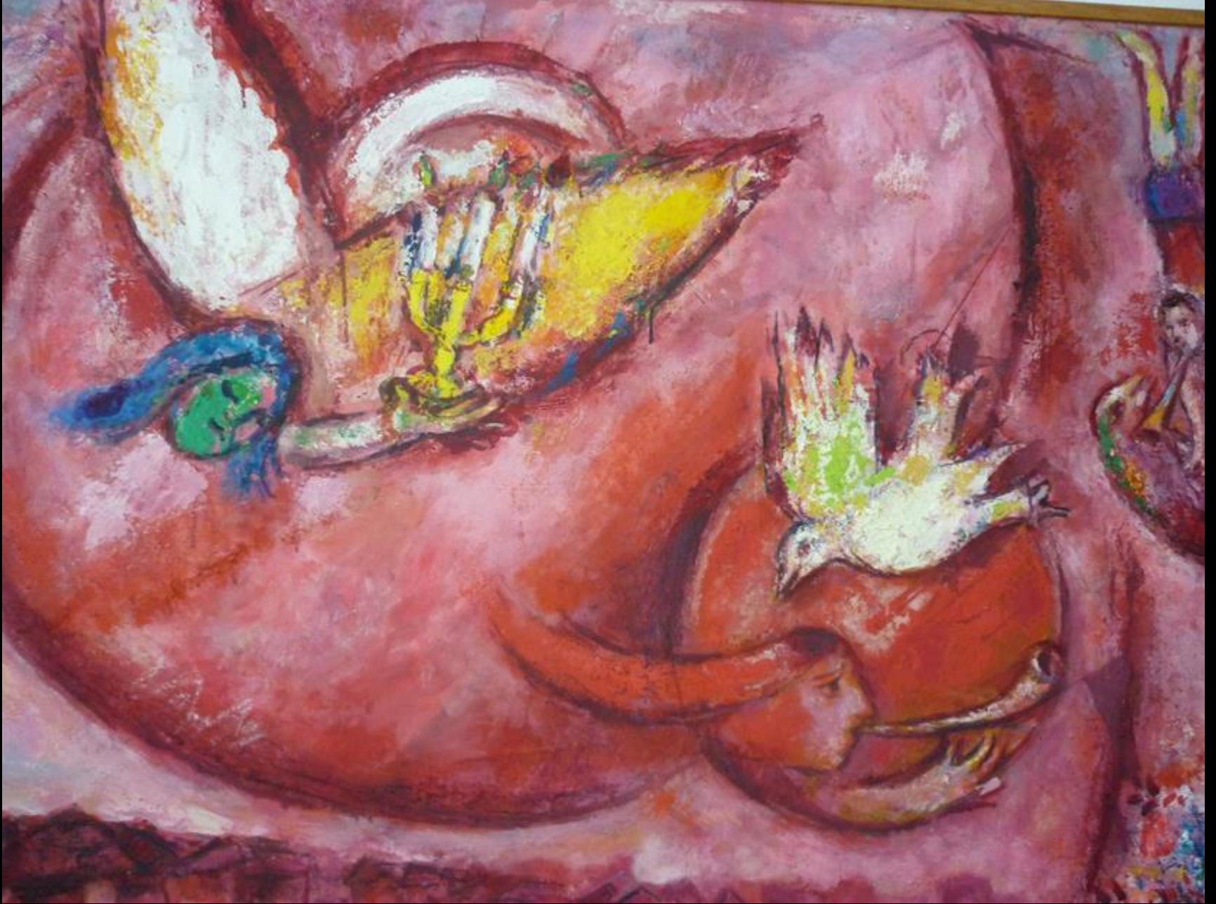
Song of Songs III -- Marc Chagall, Musée du Message Biblique Marc-Chagall, Nice, France