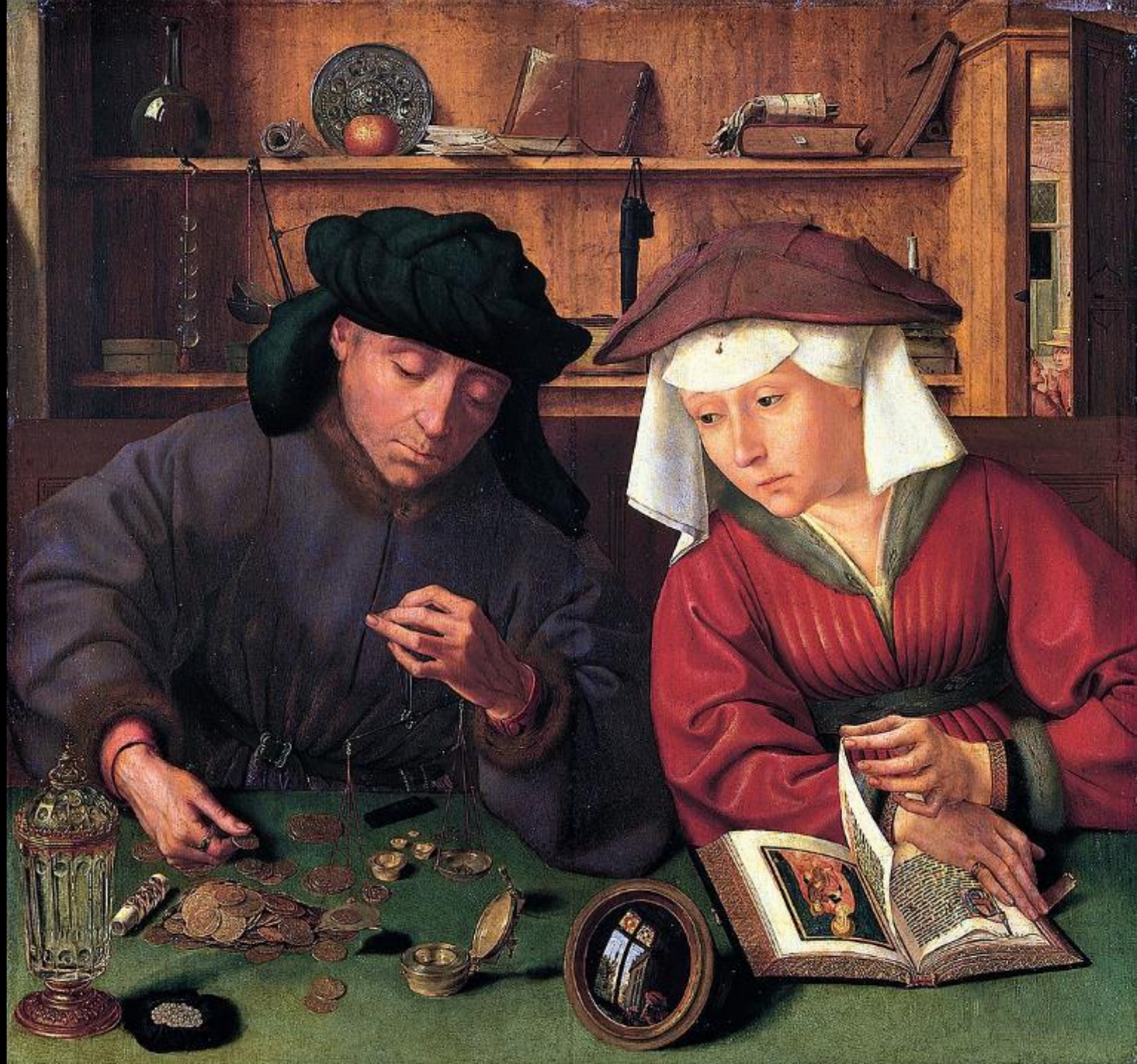
The Moneylender and his Wife

Quentin Matsys Louvre Museum Paris, France