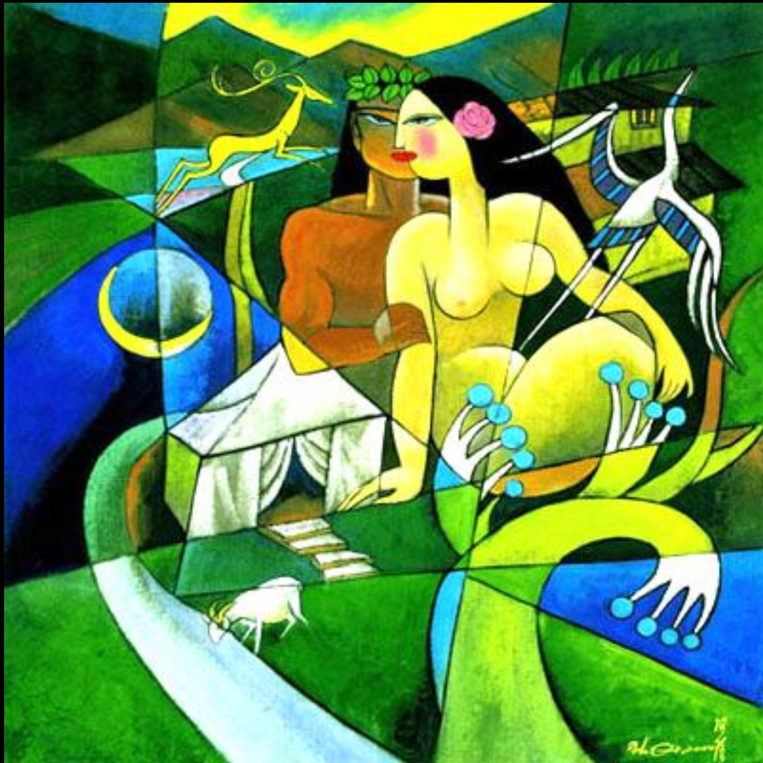
Song of Solomon -- He Qi, Nanjing, China