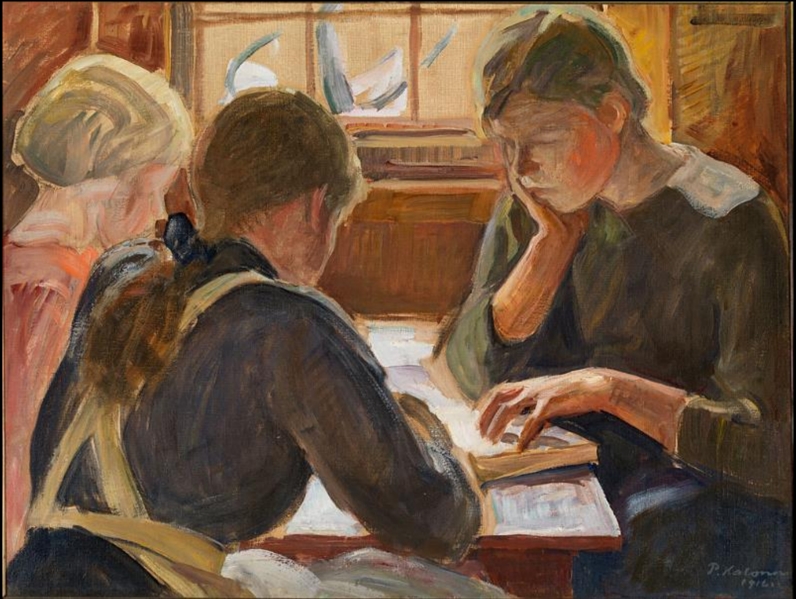
Children Reading -- Pekka Halonen, Espoo Museum of Art, Espoo, Finland