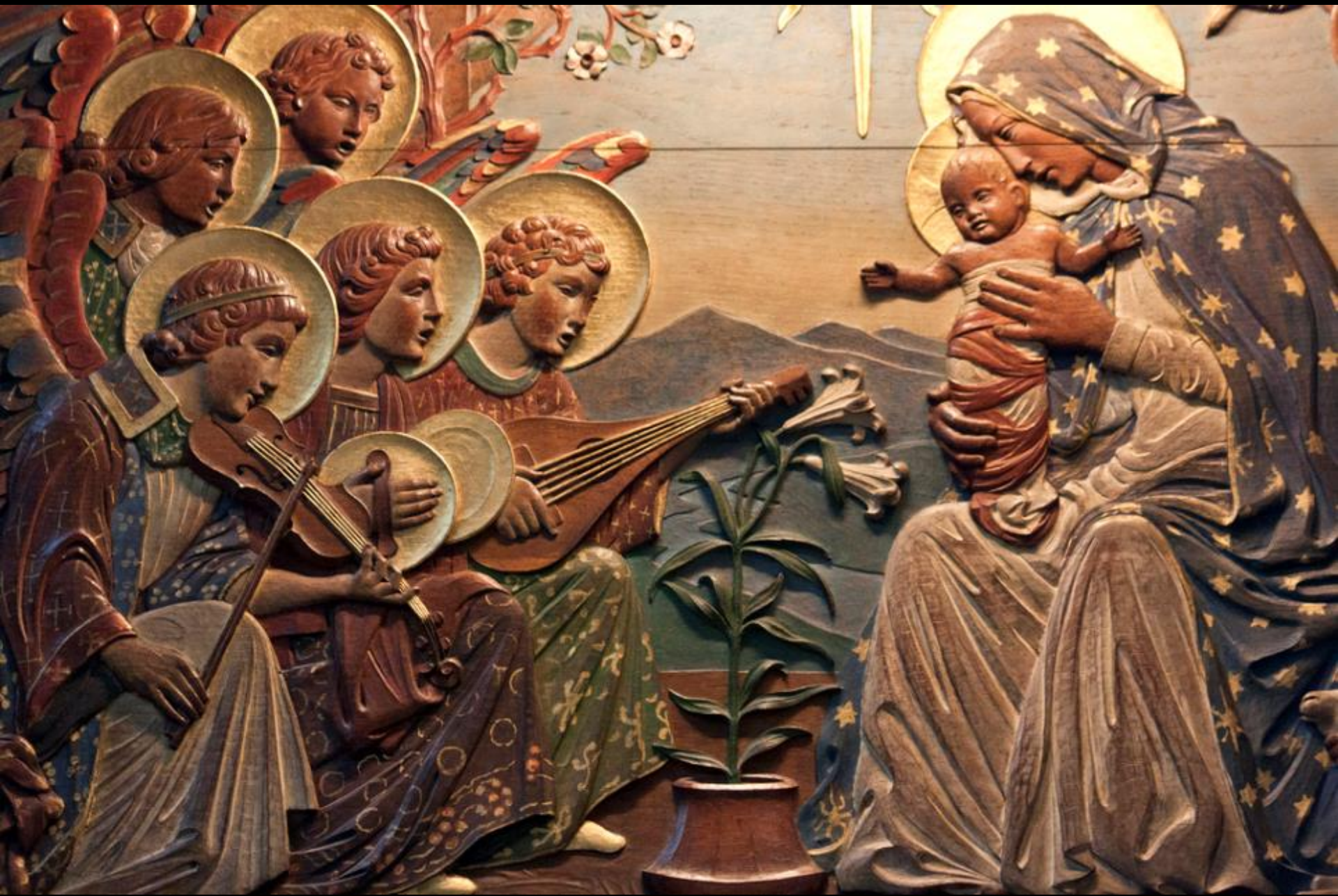
Angels Worship the Christ Child -- St. Giles Cathedral, Edinburgh, Scotland