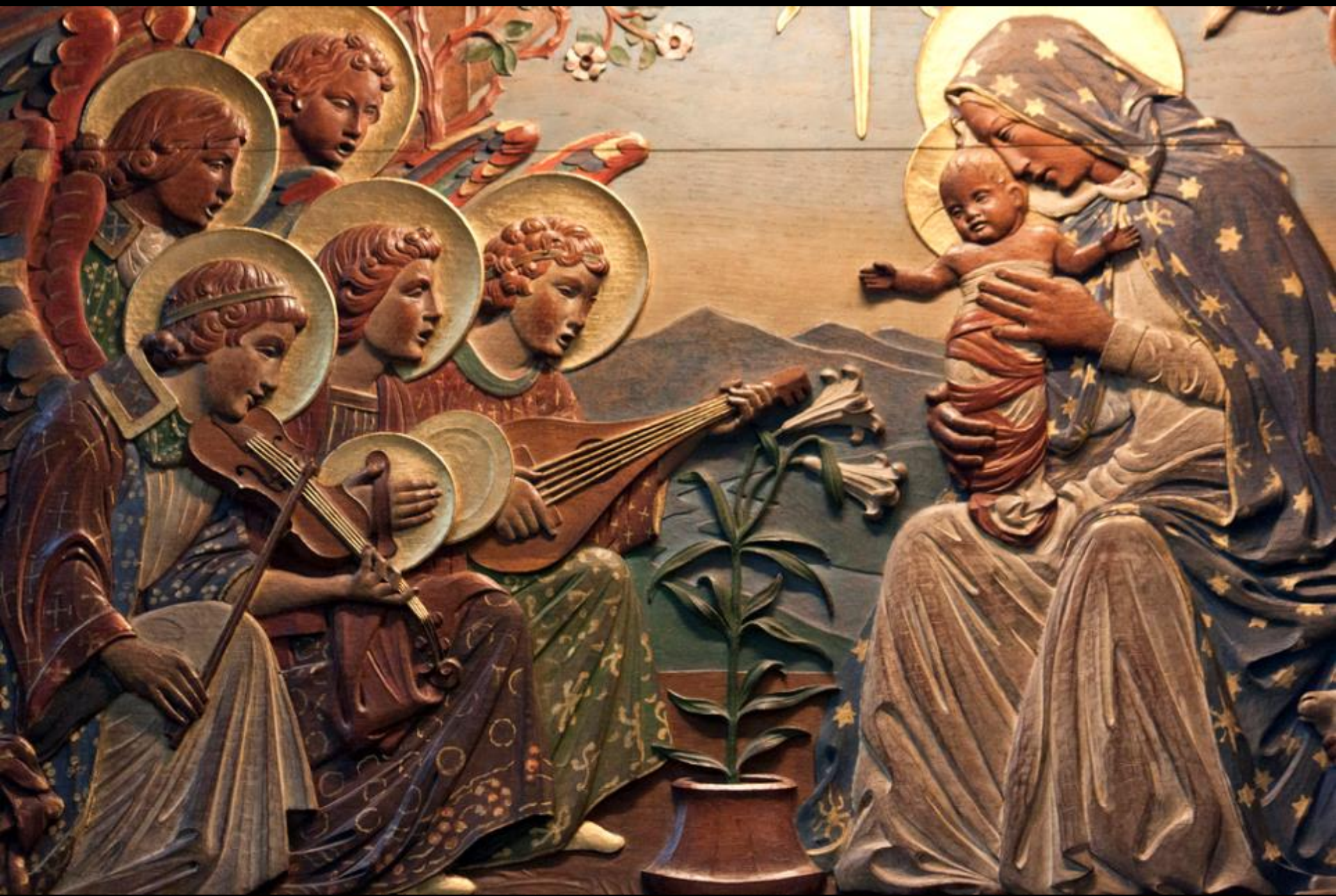
Angels Worship the Christ Child -- St. Giles Cathedral, Edinburgh, Scotland