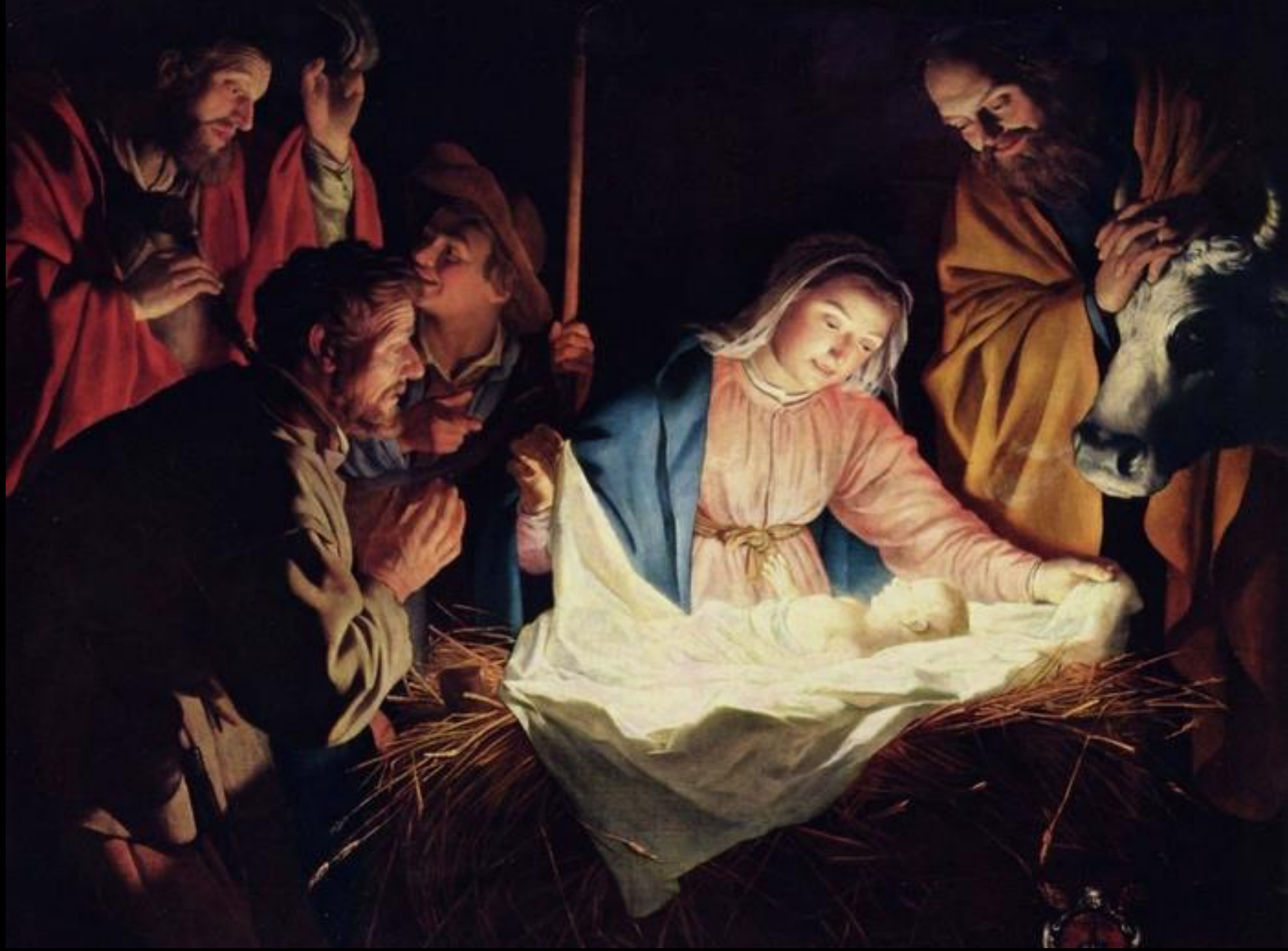
Adoration of the Shepherds -- Gerrit van Honthorst, Wallraf-Richartz Museum, Cologne, GDR