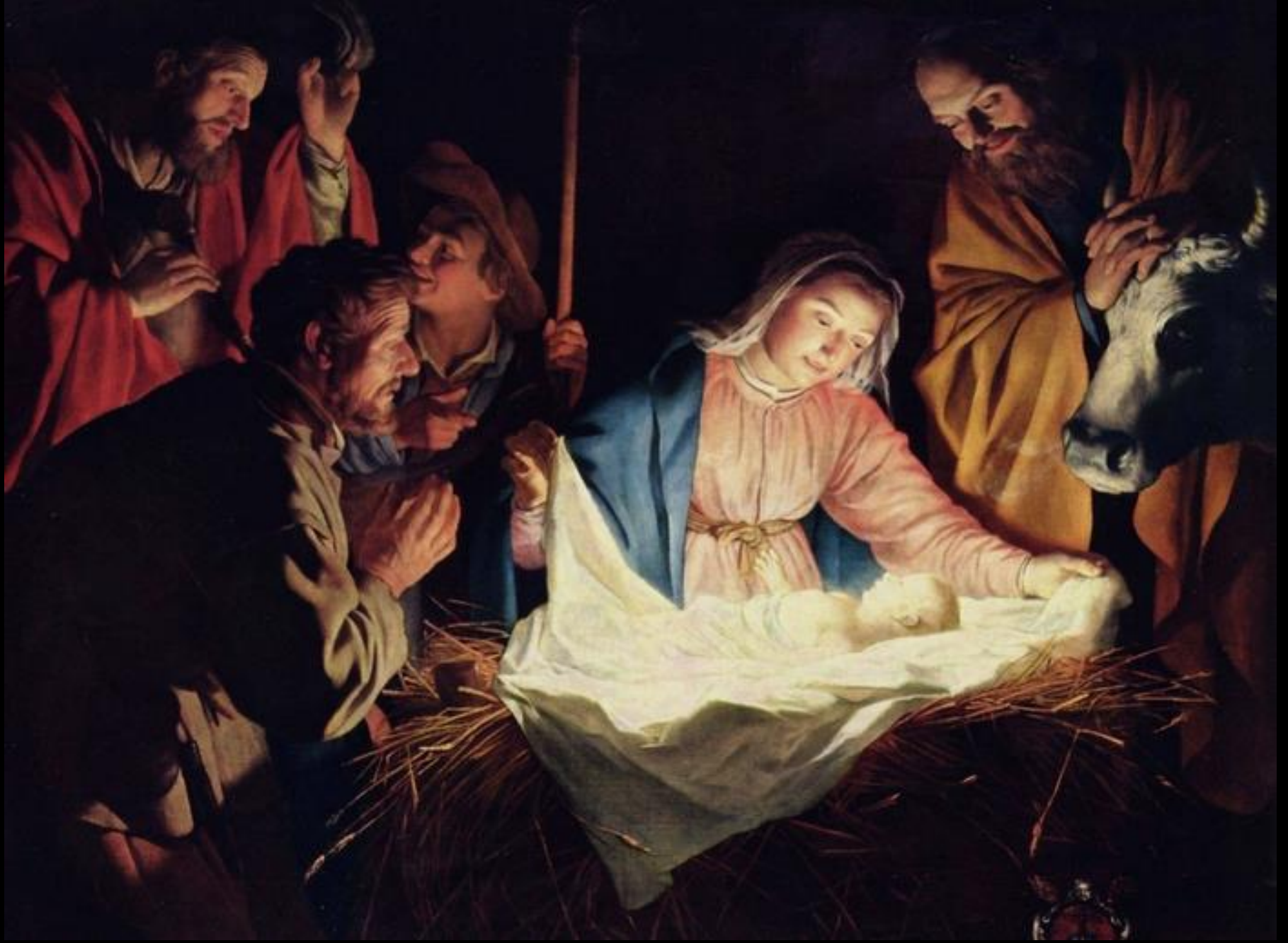
Adoration of the Shepherds -- Gerrit van Honthorst, Wallraf-Richartz Museum, Cologne, GDR