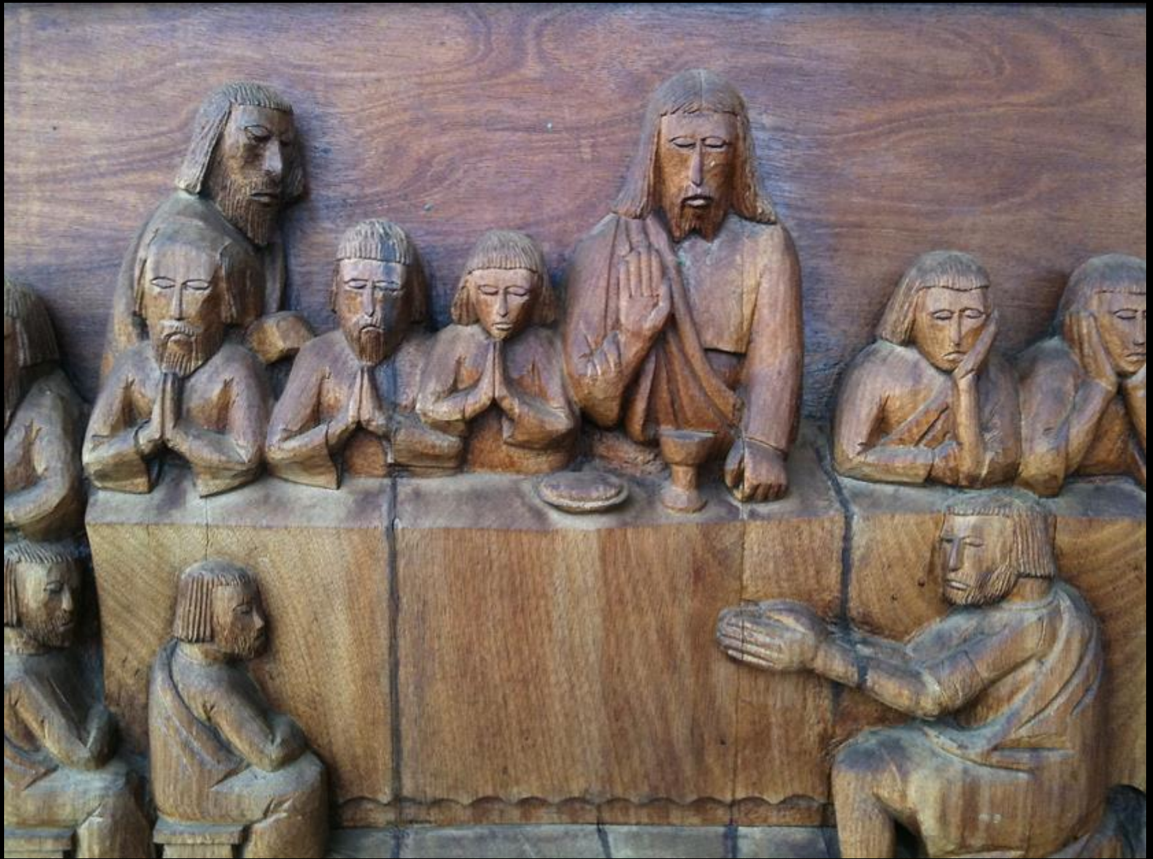
Last Supper -- Capetown, South Africa