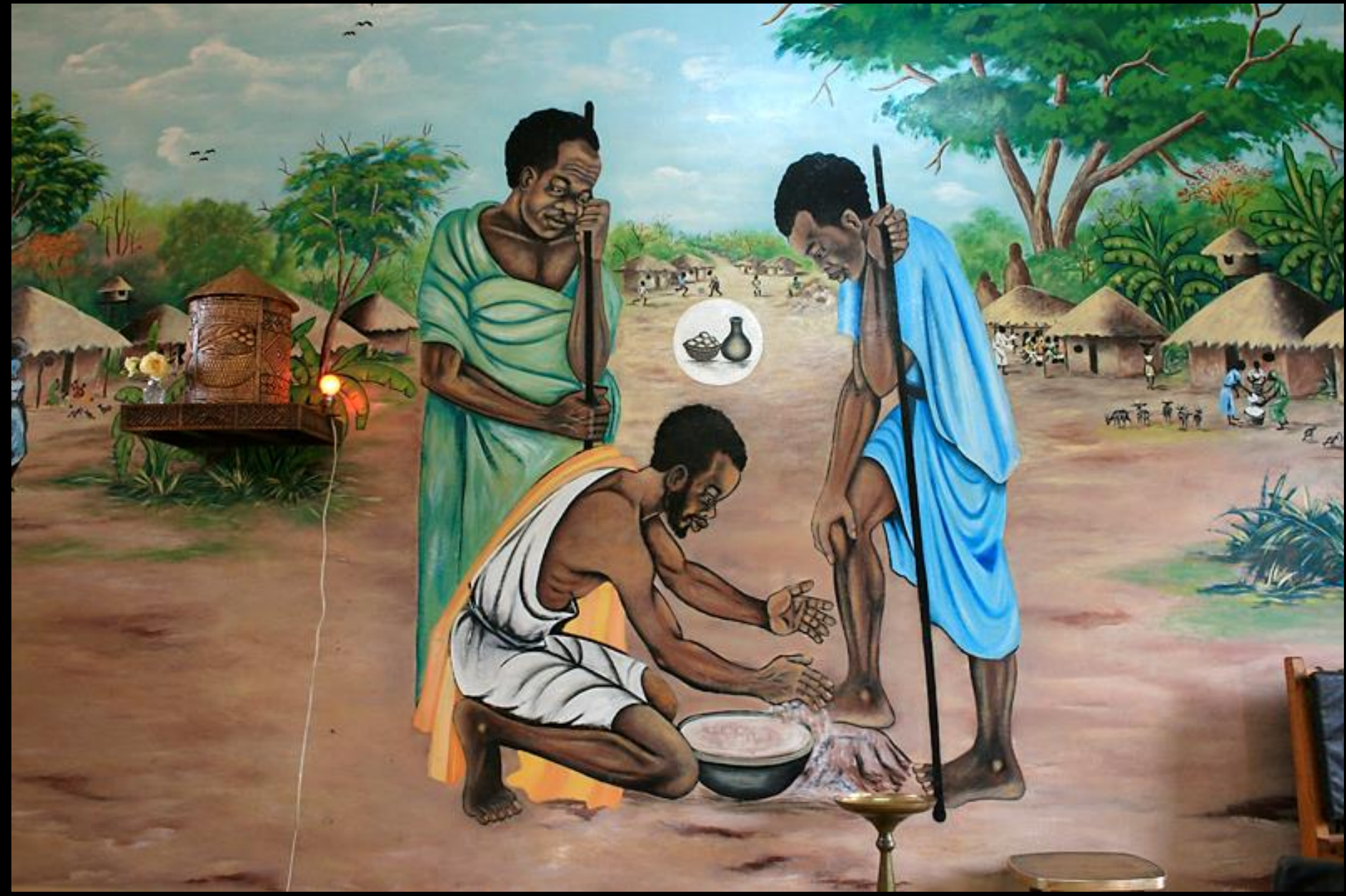
Jesus Washes His Disciples' Feet -- Victoria Falls, Zambia