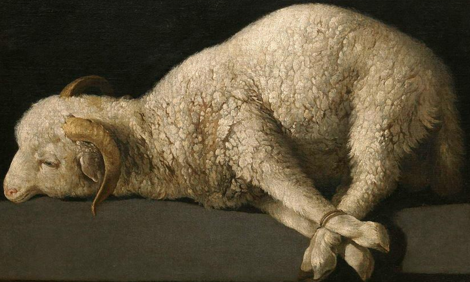
Lamb of God -- Francisco de Zurbarán, Prado, Madrid, Spain