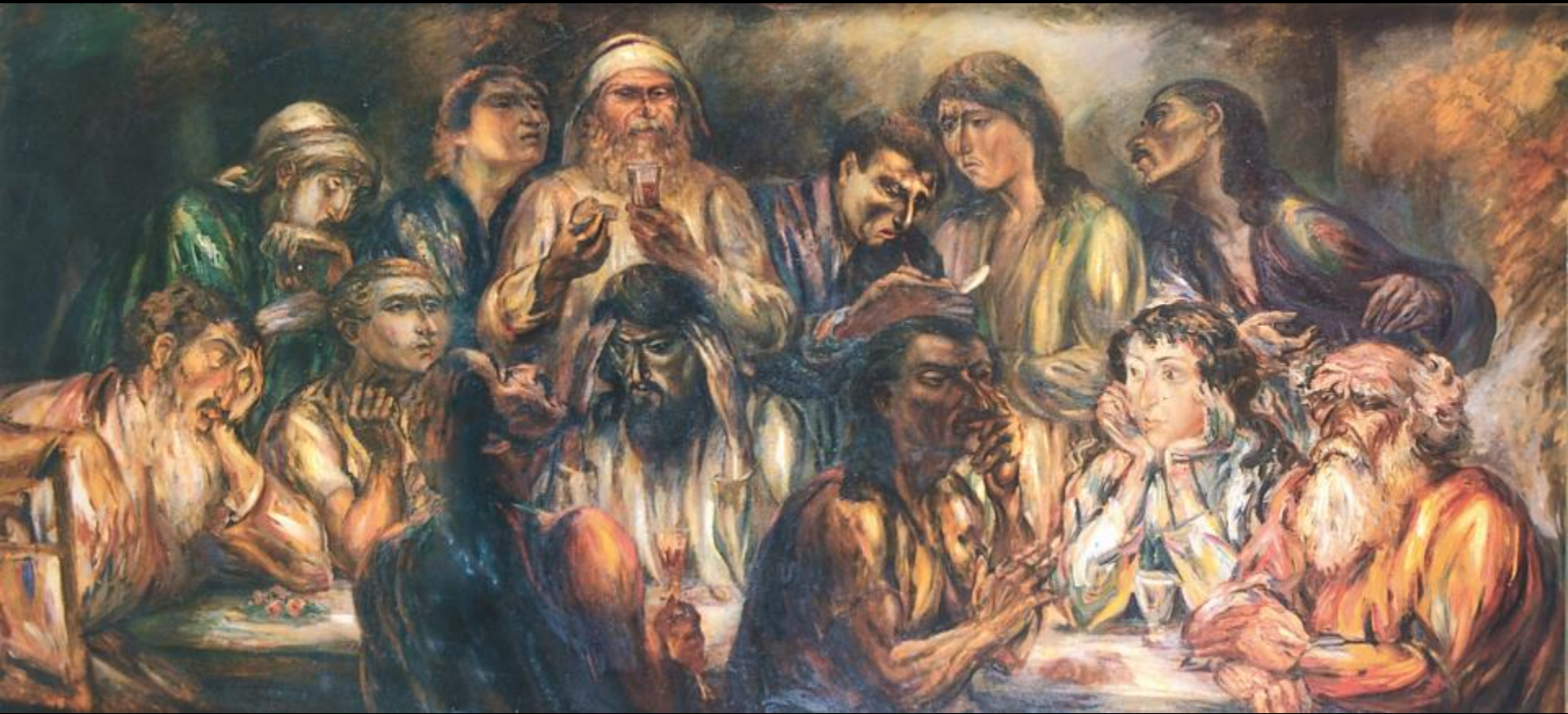
Last Supper -- Karoly Kernstok, Hungarian National Gallery, Budapest, Hungary