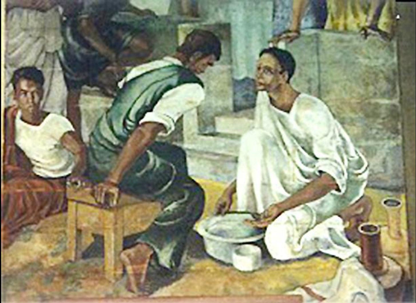
Christ Washes Peter's Feet -- David Paynter, Trinity College Chapel, Kandy, Sri Lanka