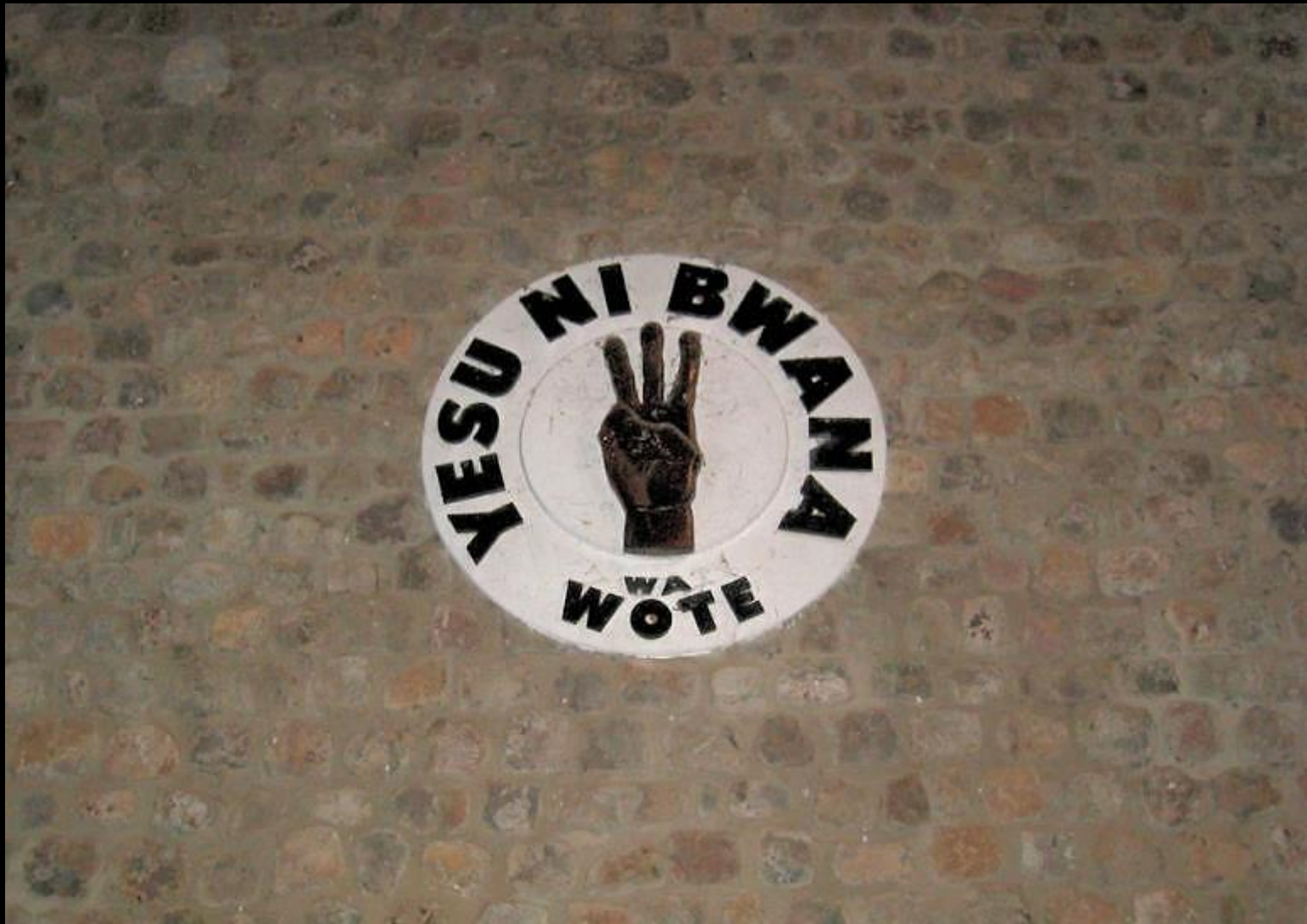
Jesus is Lord of All -- Panel in Chapel, Mulungwishi Mission, D. R. Congo