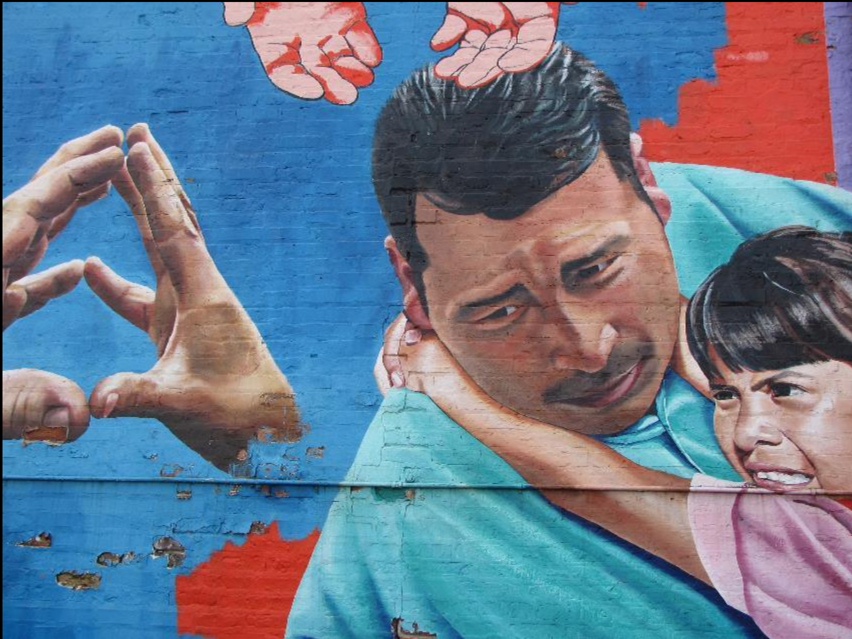
Father and Daughter -- Community Mural in Pilsen neighborhood, Chicago, IL