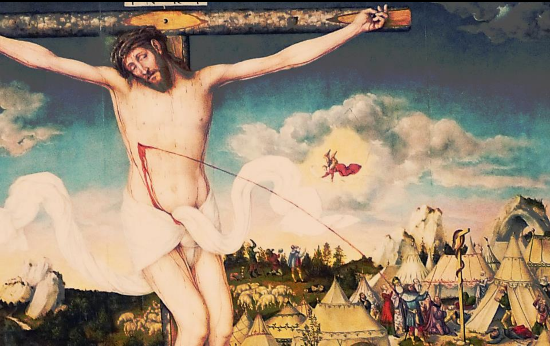
Lucas Cranach the Younger -- Crucifixion with Moses and Serpent detail, Herder Church, Weimar, GDR