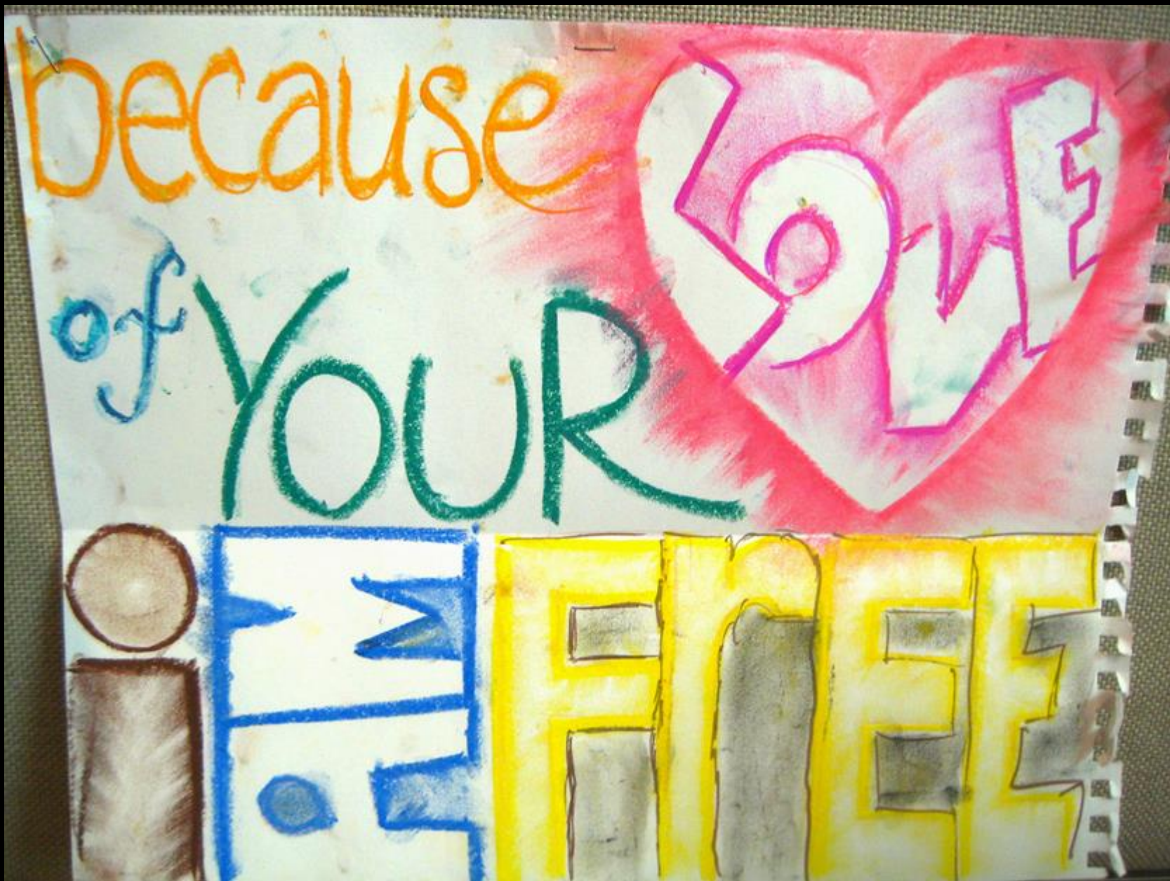
Drawing from a Christian fellowship meeting, Lingnan University, Hong Kong, China