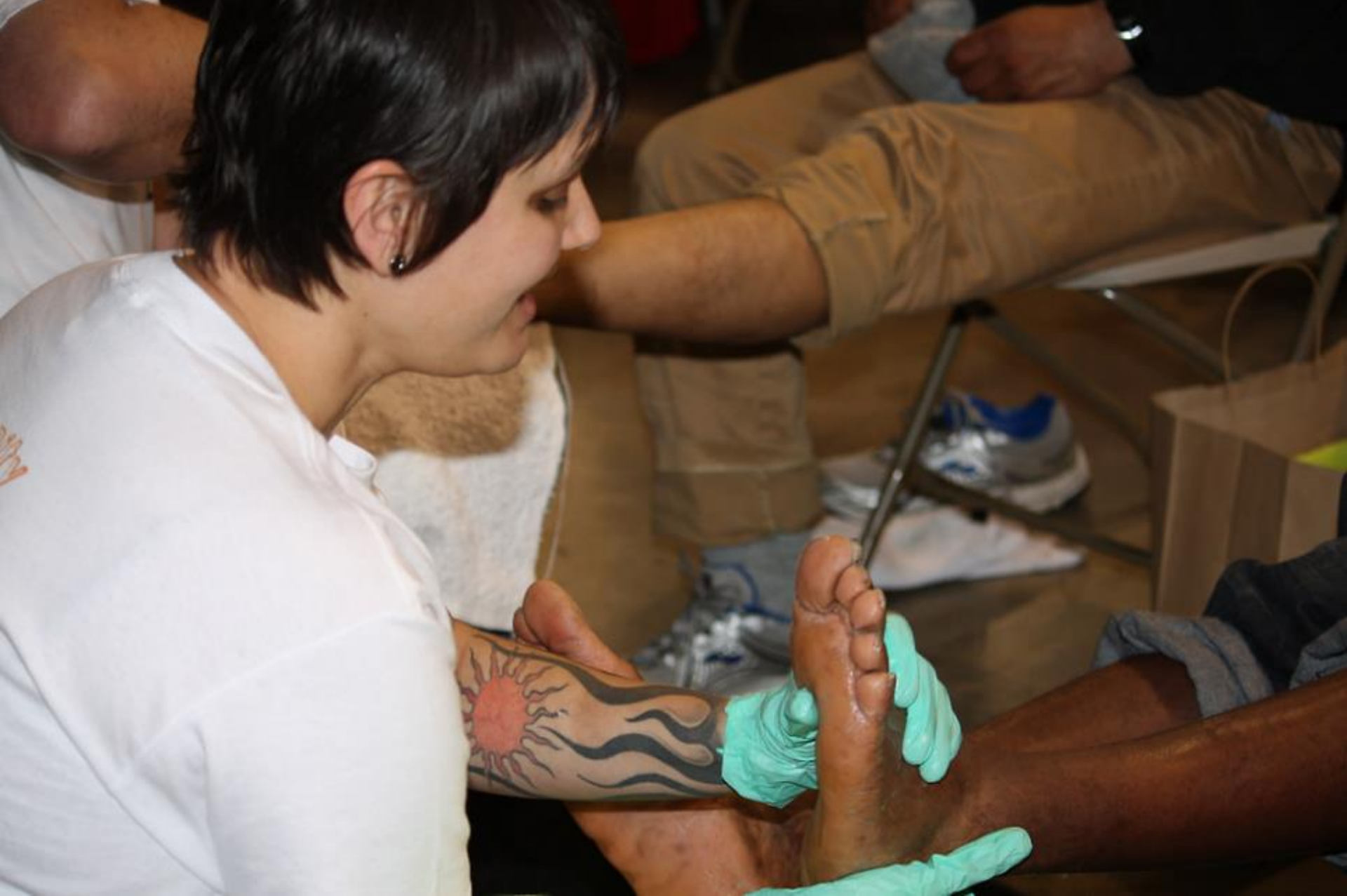
Footwashing -- Church of the Redeemer, United Way Resource Exchange, Seattle, WA