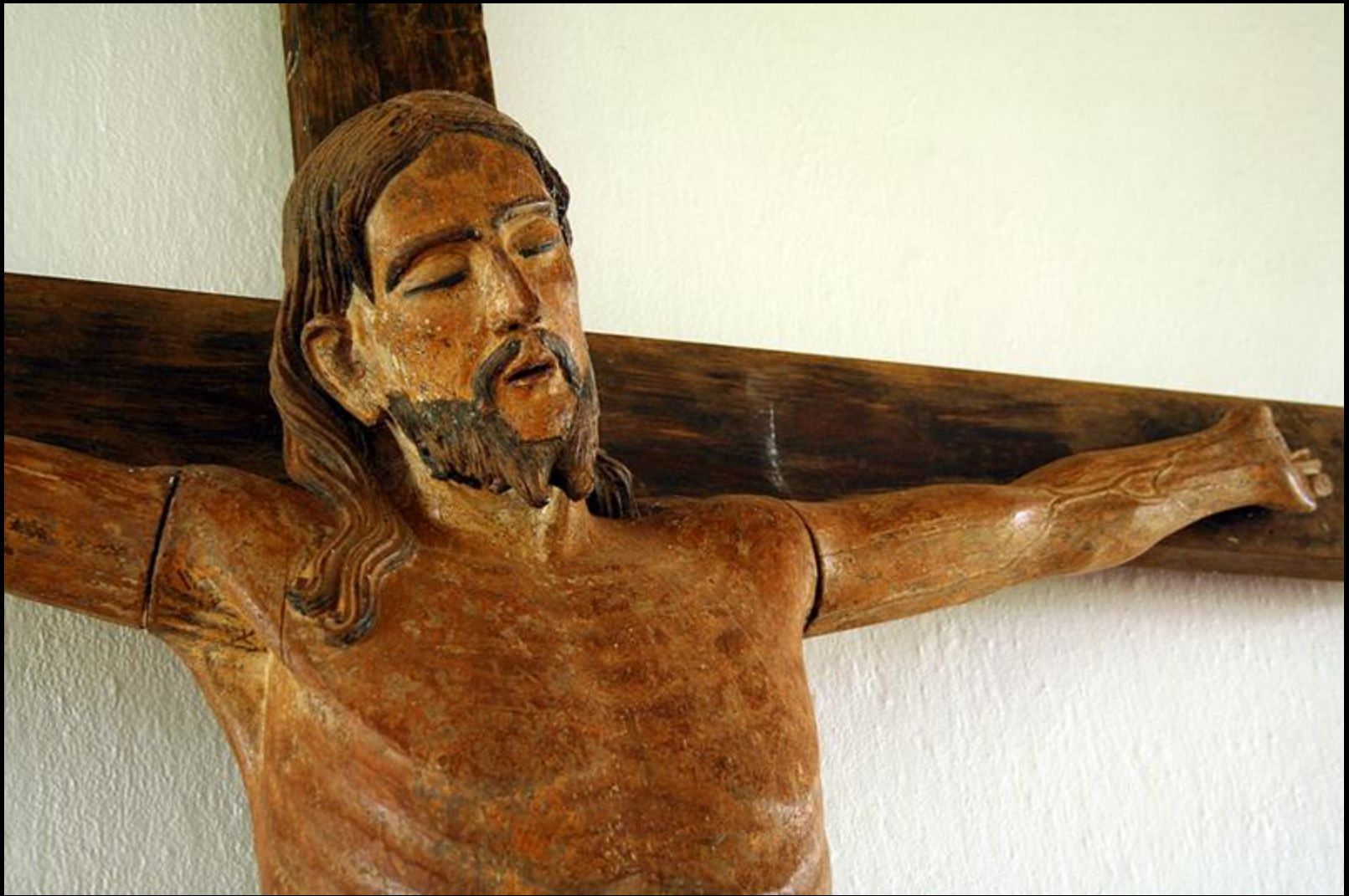
Christ on the Cross -- St. Miguel Arcanjo Church, St. Miguel, Brazil