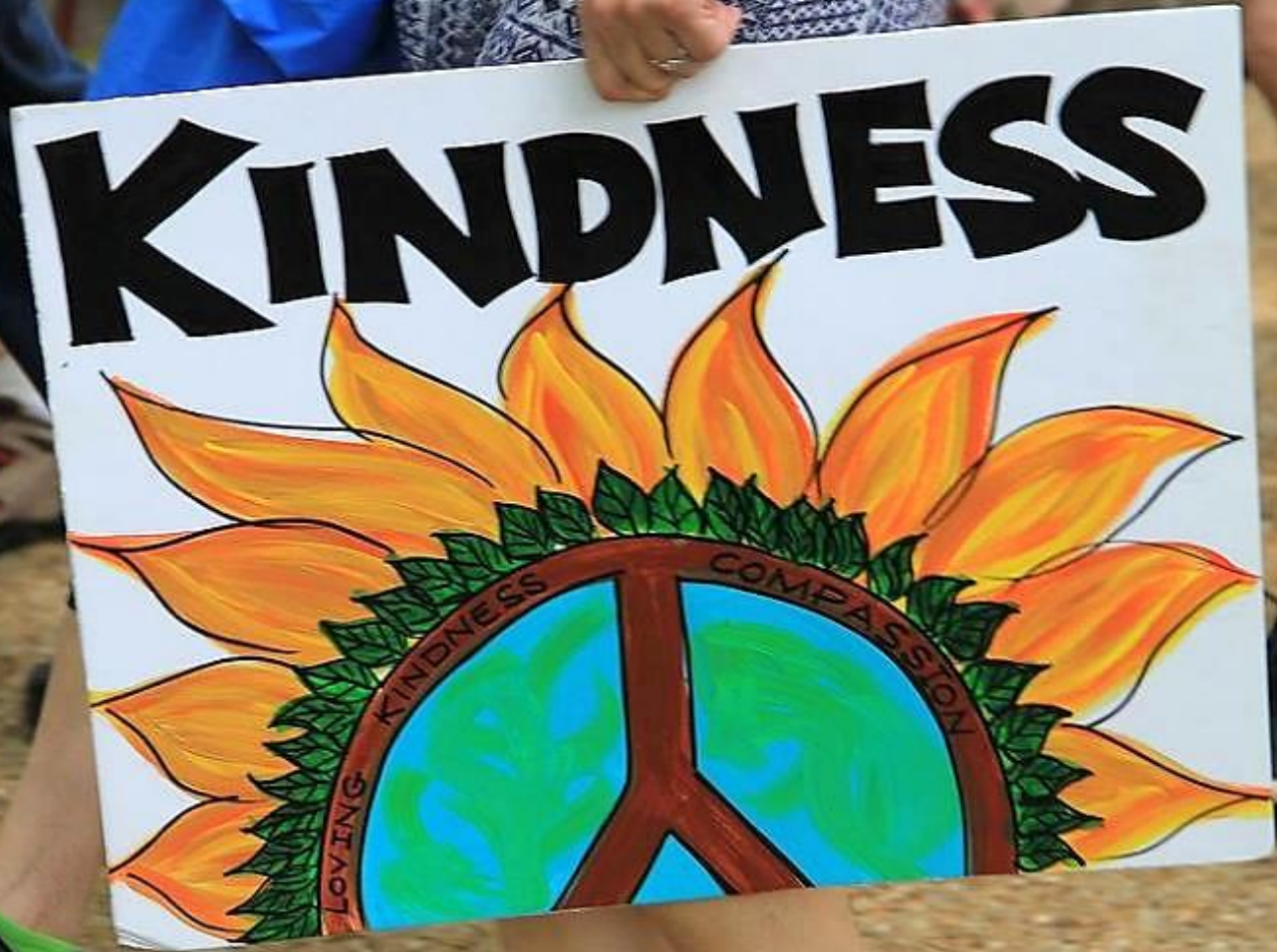
Kindness, Compassion, Peace -- People's Climate March, 2017