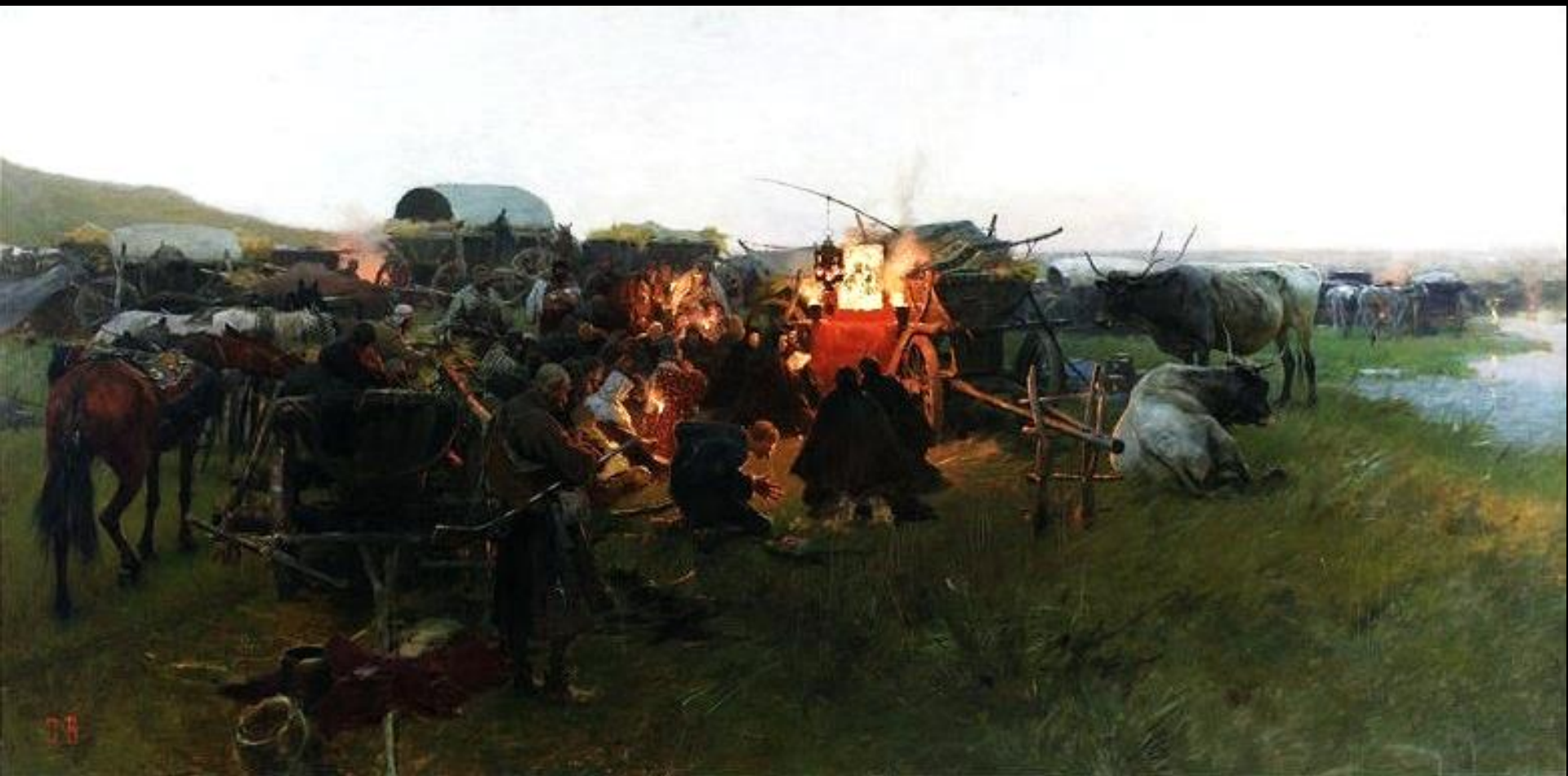
Prayer in the Steppe -- Jozef Brandt, National Museum, Warsaw, Poland