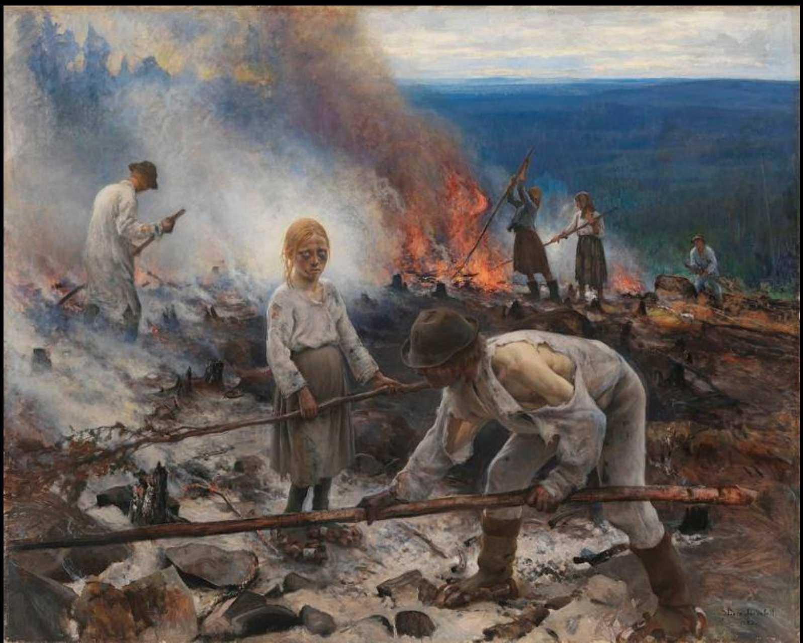
Under the Yoke -- Eero Järnefelt, Finnish National Gallery, Helsinki, Finland