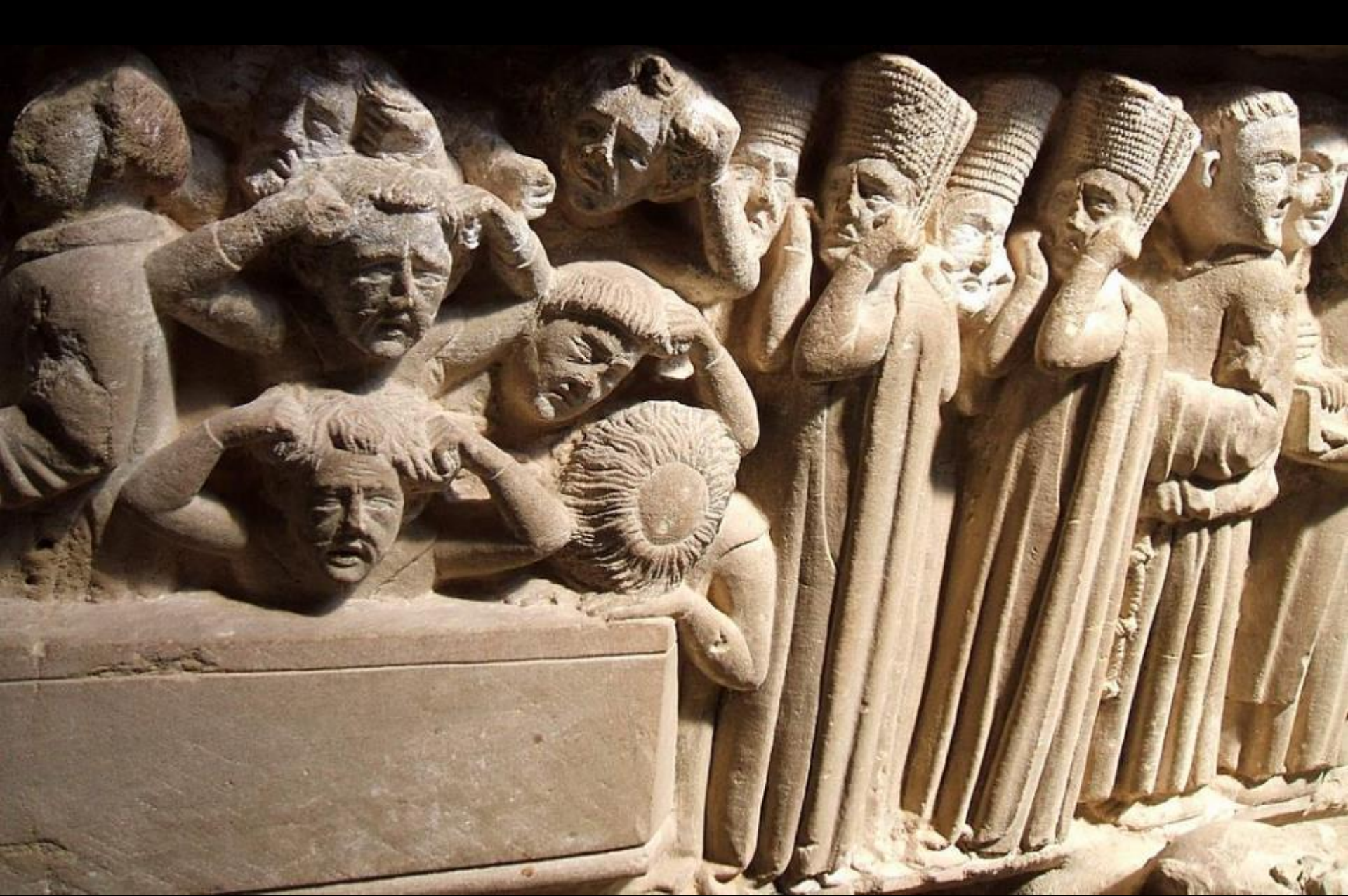
Sepulcher in Cistercian monastery -- Santa María del Salvador, Cañas, Spain