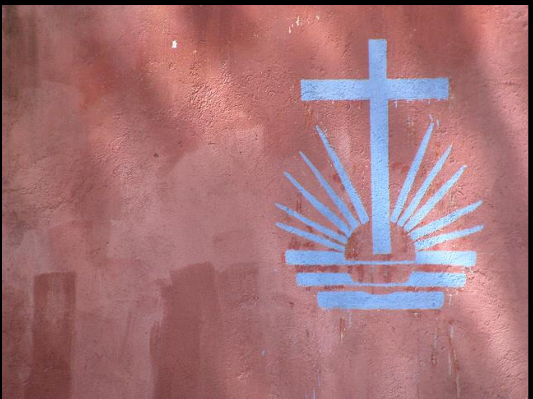
Church Mural, Manchewe, Malawi