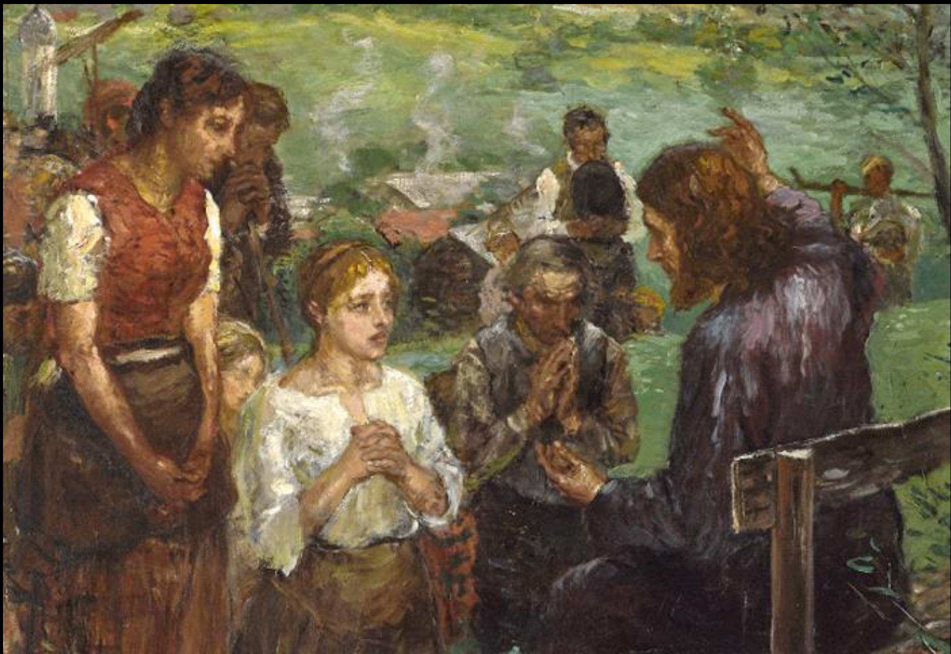
Christ Teaching -- Fritz von Uhde, Museum of Fine Arts, Budapest, Hungary