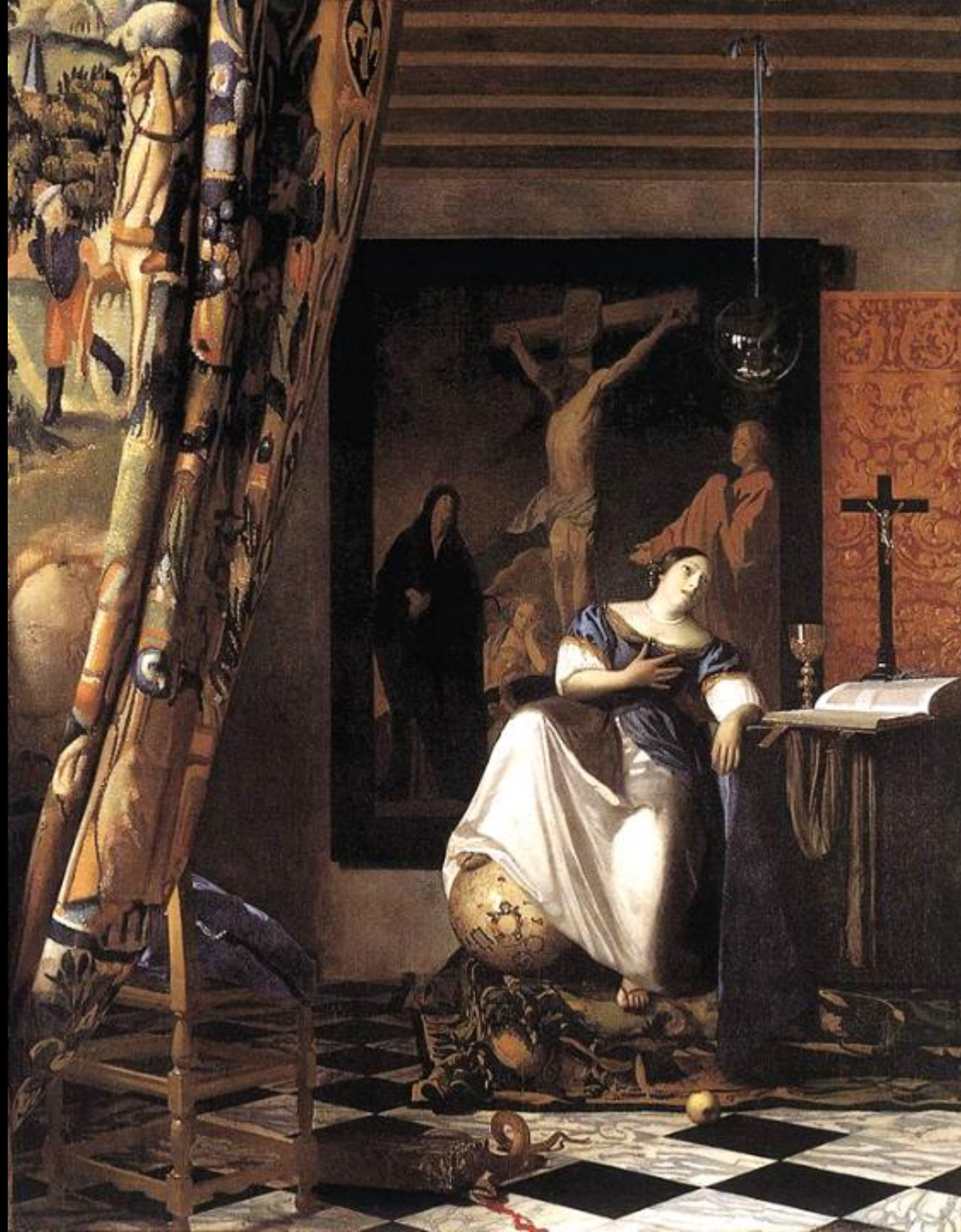
Allegory of Faith

Johannes Vermeer Metropolitan Museum of Art New York City