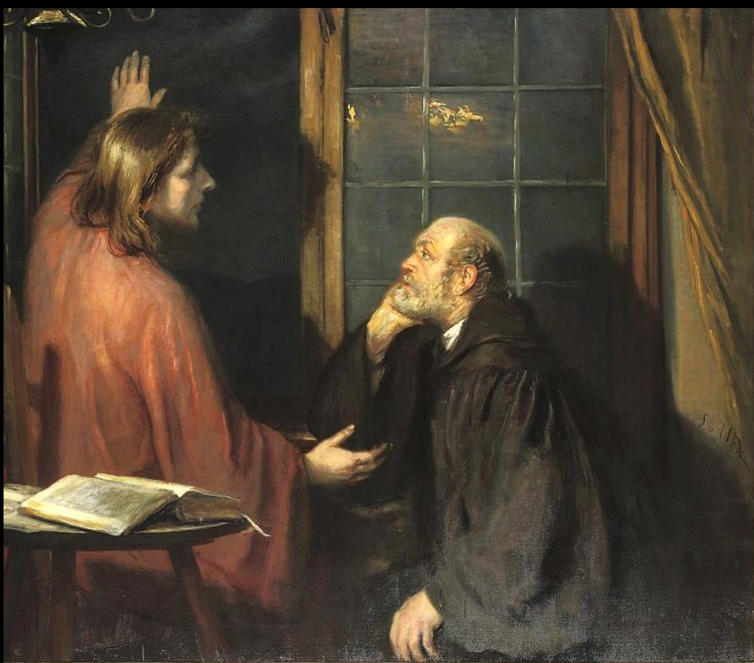
Nicodemus and Christ -- Fritz von Uhde