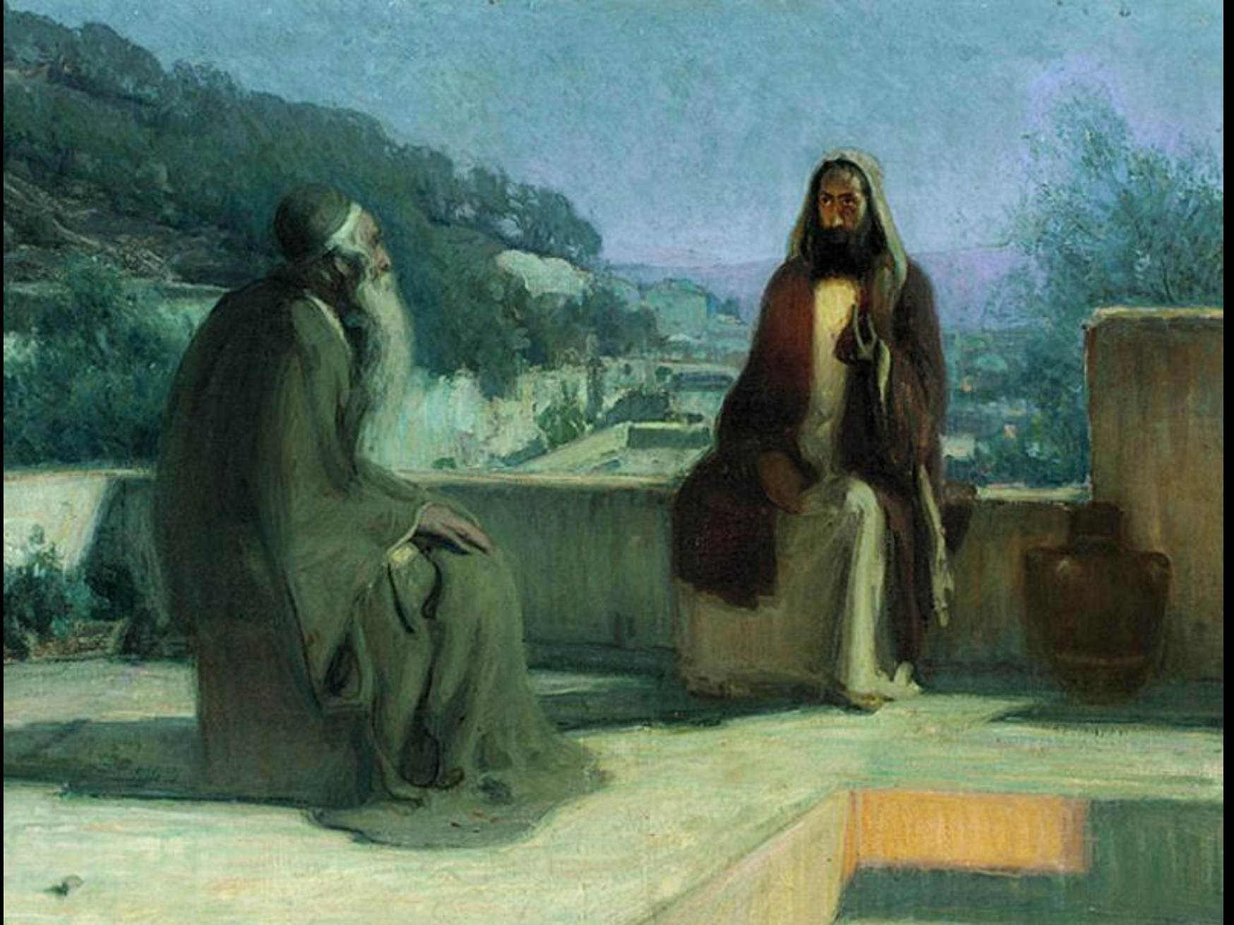
Nicodemus and Jesus on a Rooftop -- Henry Ossawa Tanner, Philadelphia Museum of Art