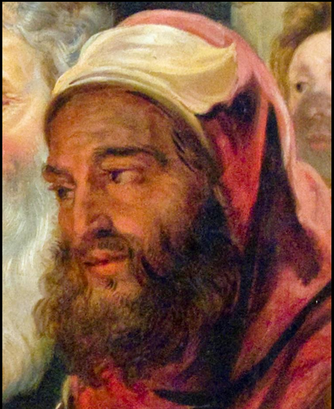
Christ Instructing Nicodemus (detail) Jacob Jordaens Royal Museum Brussels, Belgium