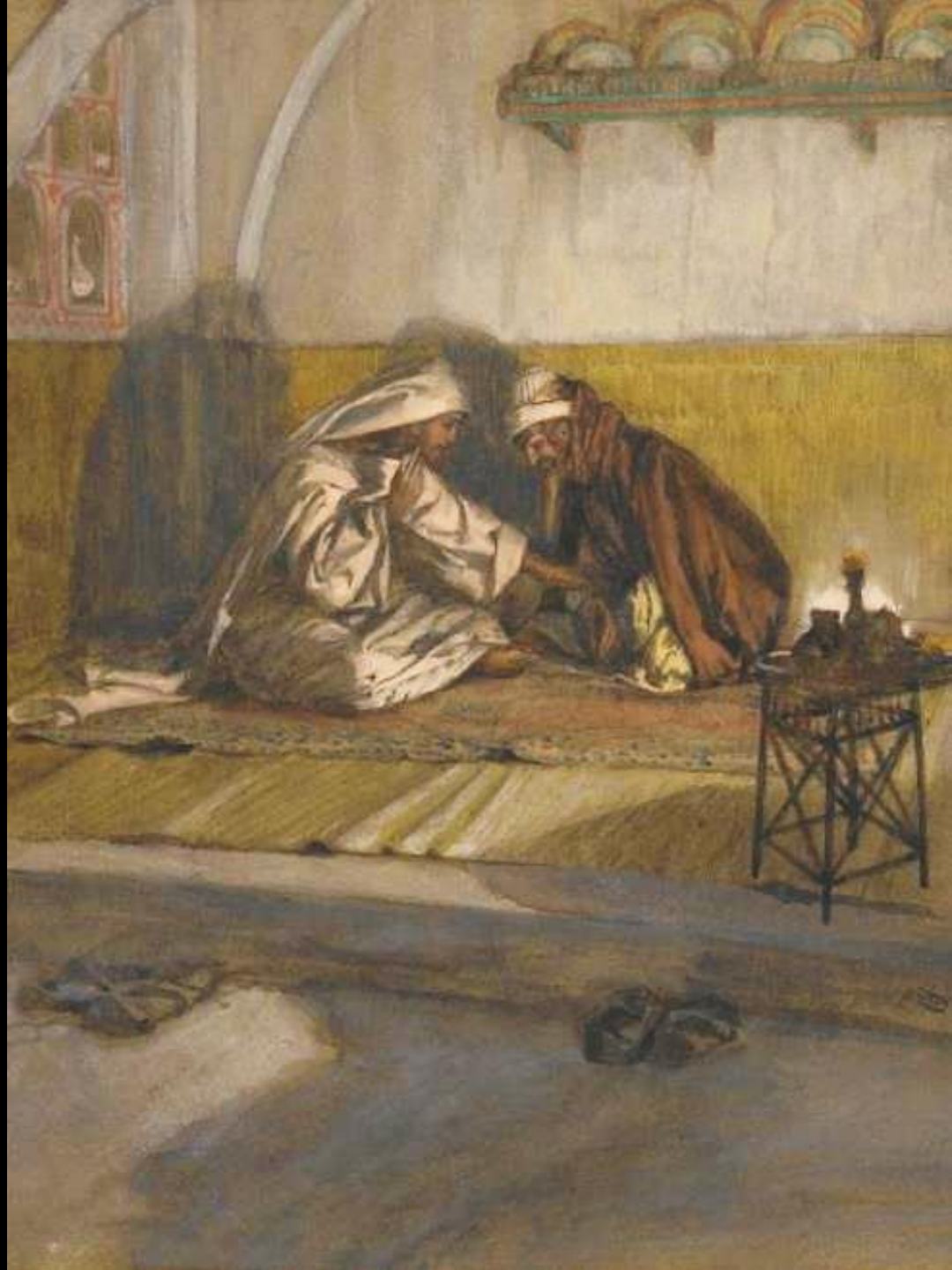
Christ and Nicodemus

James Tissot Brooklyn Museum New York, NY