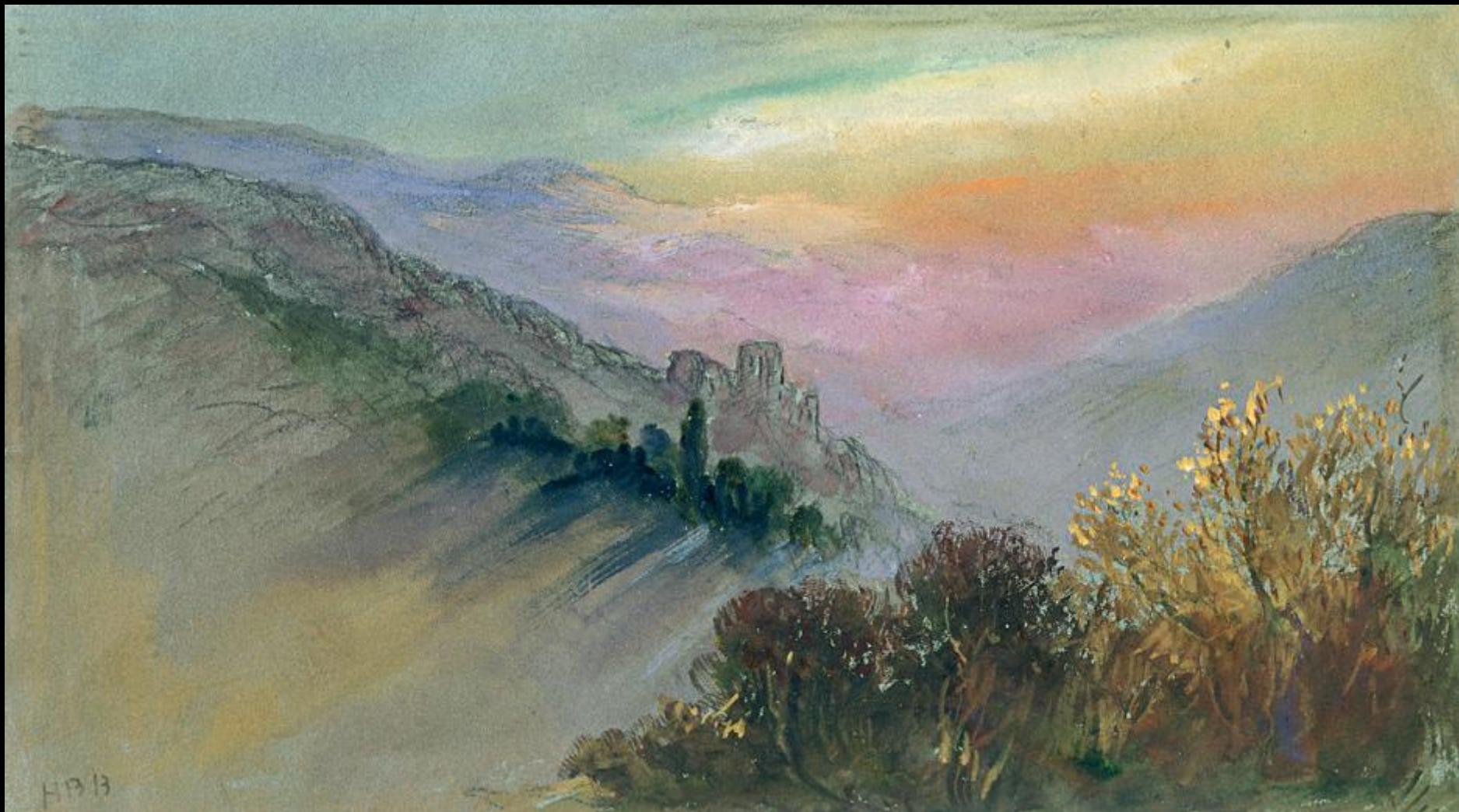
Mountain Landscape -- Hercules Brabazon, Phillips Collection, Washington, DC