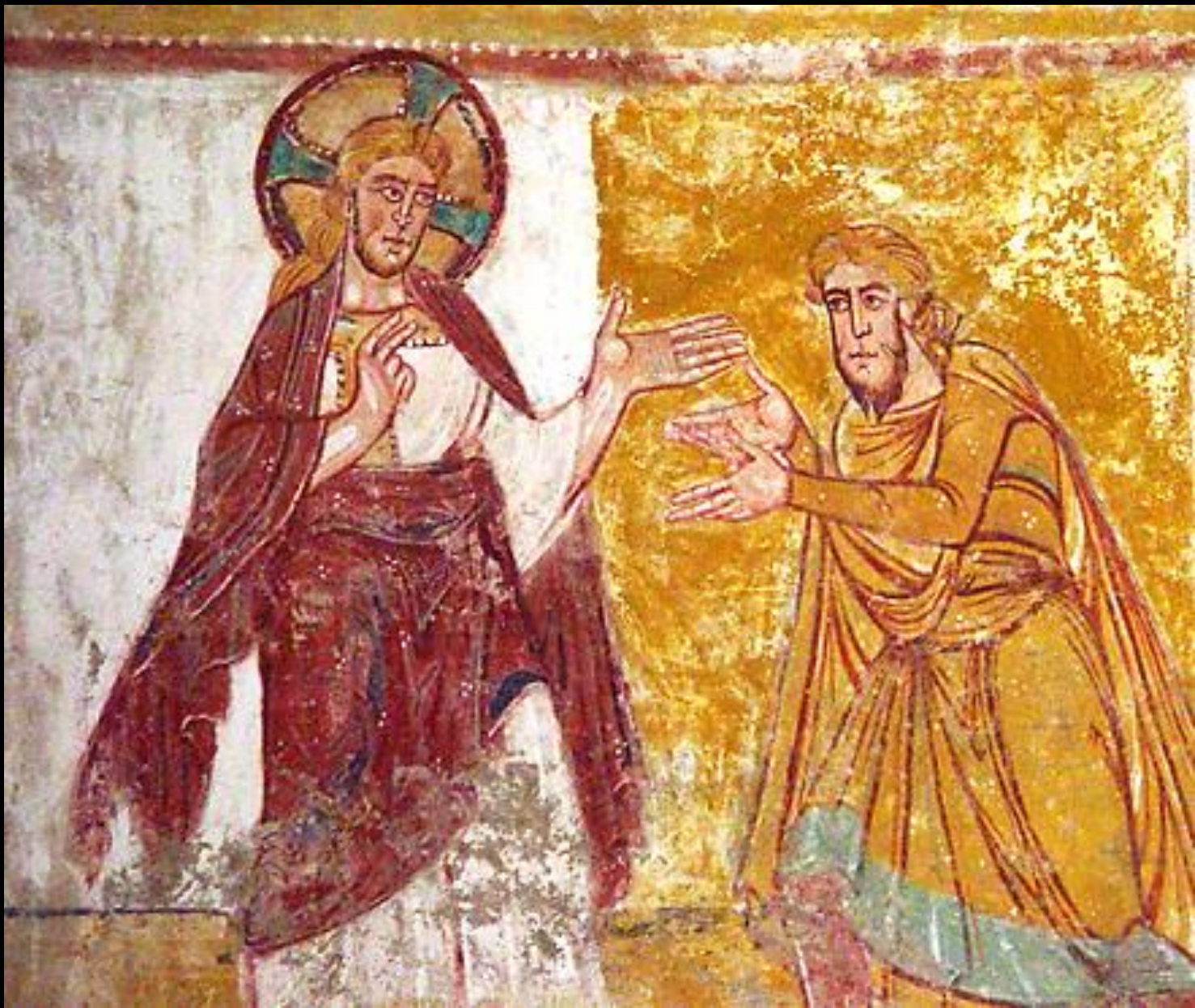
The Calling of Abraham -- Abbey of Saint-Savin, Vienne, France