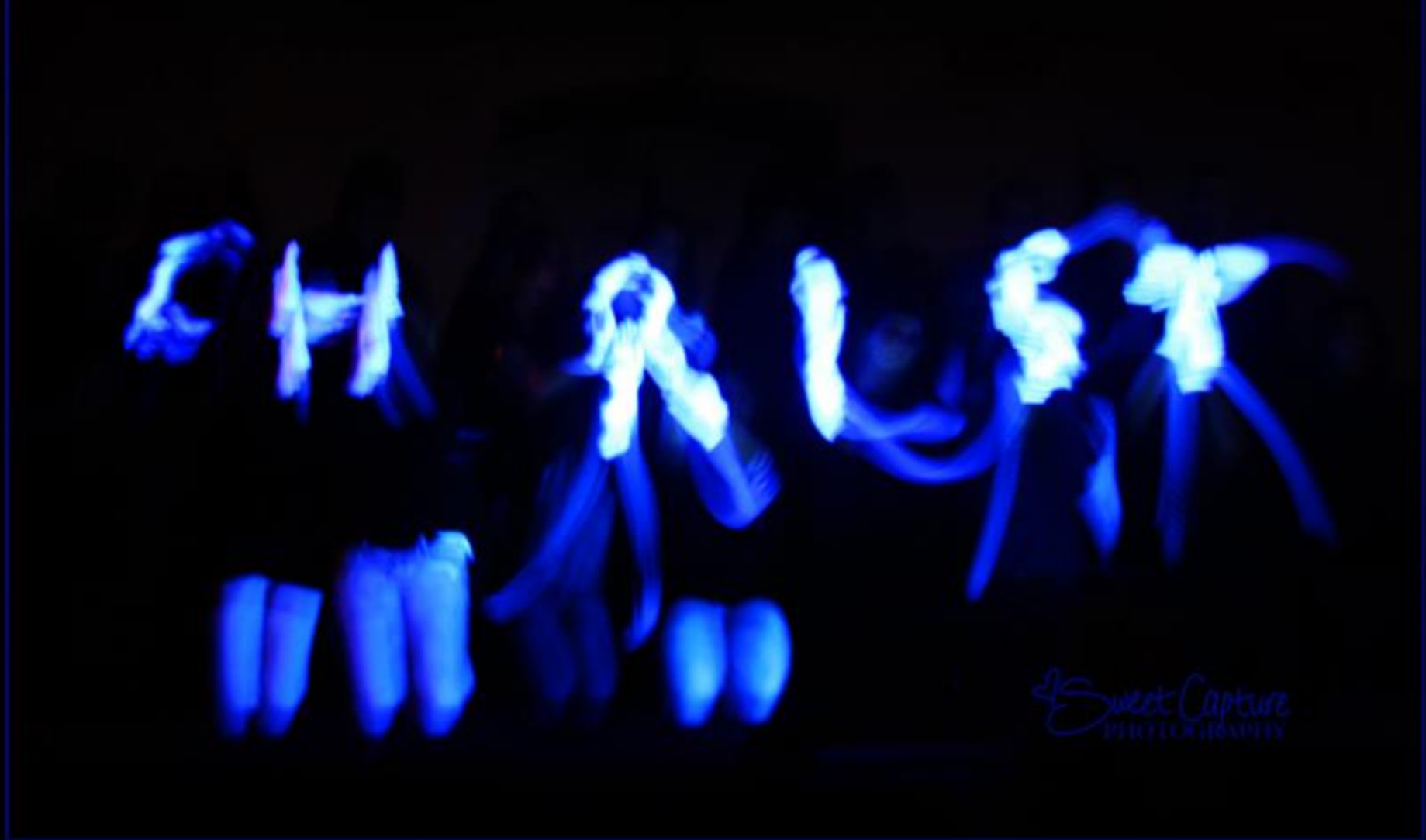
Light of the World -- Presentation by youth with gloves in dark space