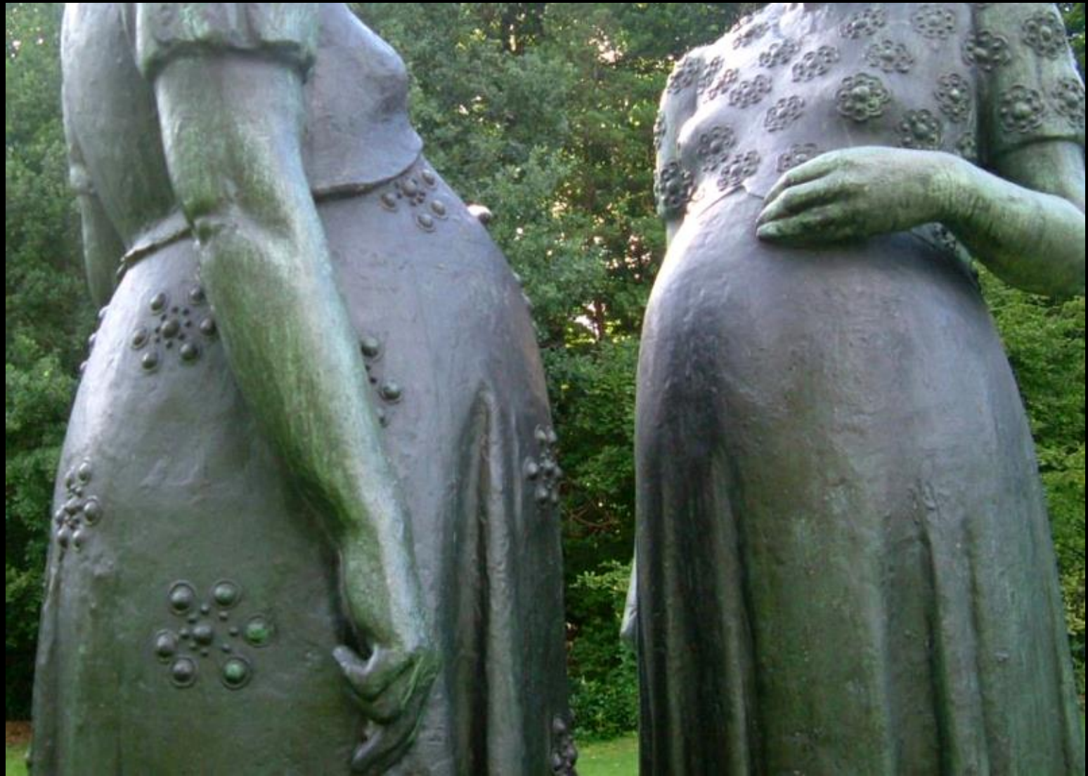
Two Women -- Charles LePlae, Openluchtmuseum , Antwerp, Belgium