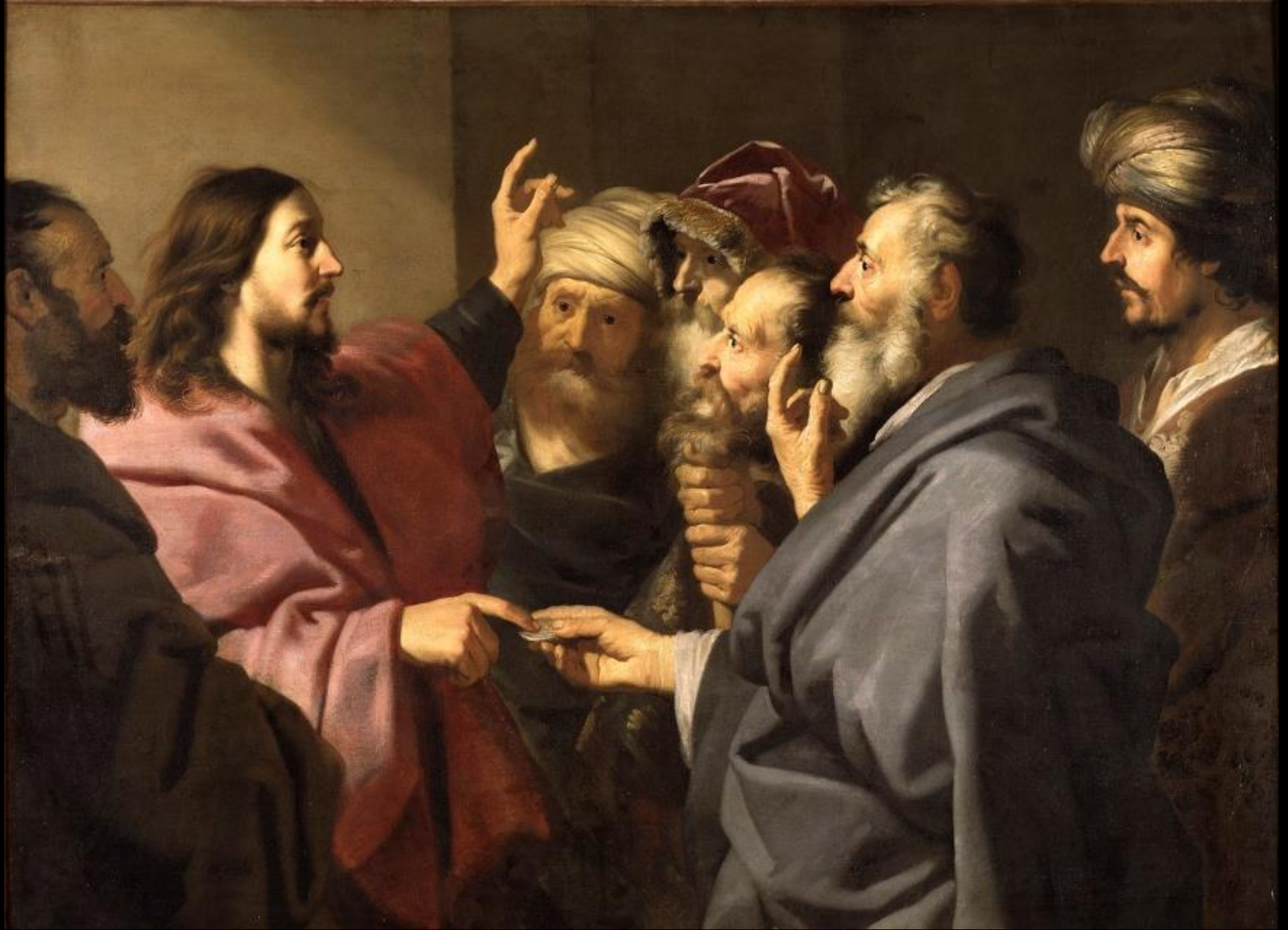
The Tribute Money -- Jacob Backer, National Museum, Stockholm, Sweden