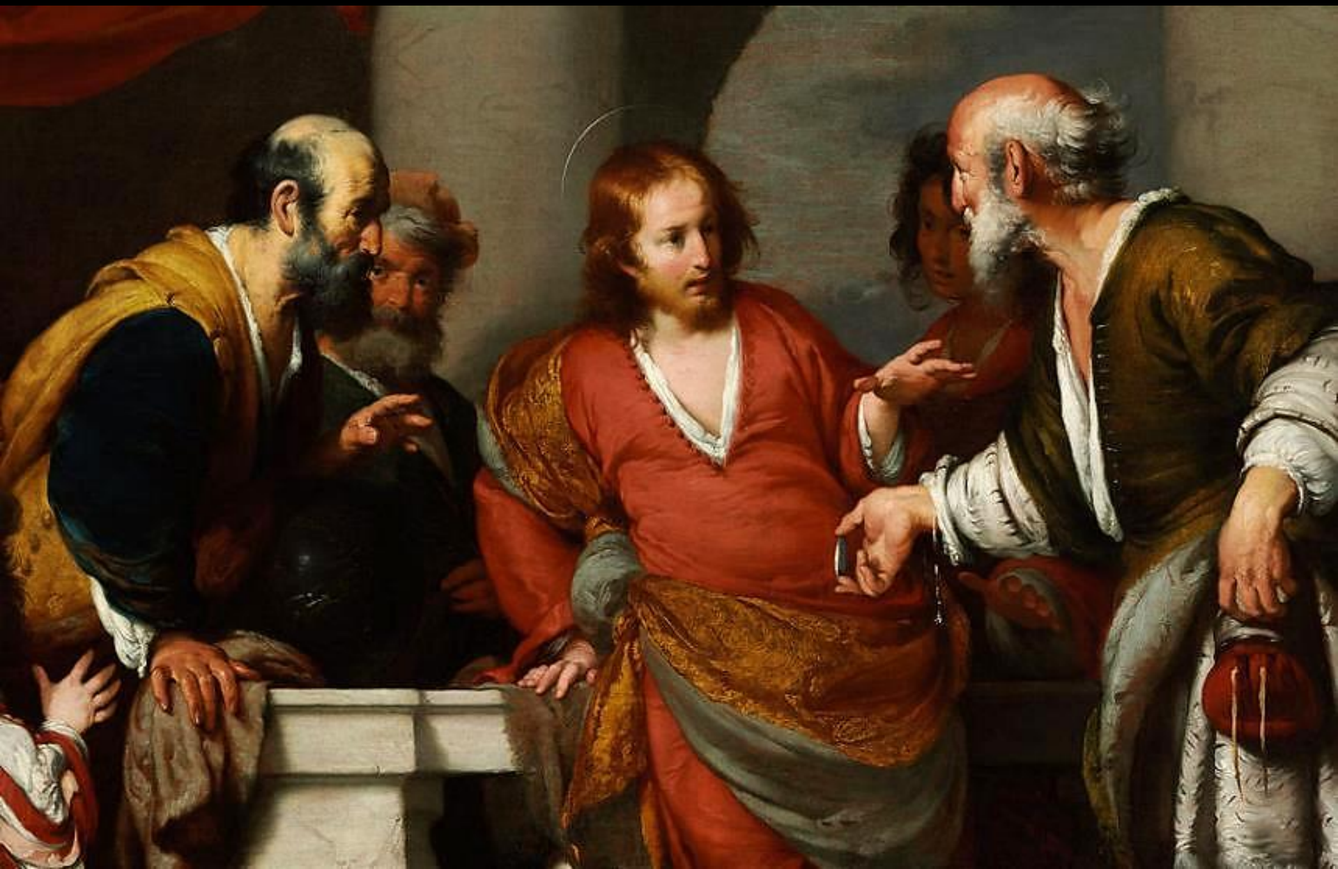
The Tribute Money -- Bernardo Strozzi, Museum of Fine Arts, Budapest, Hungary