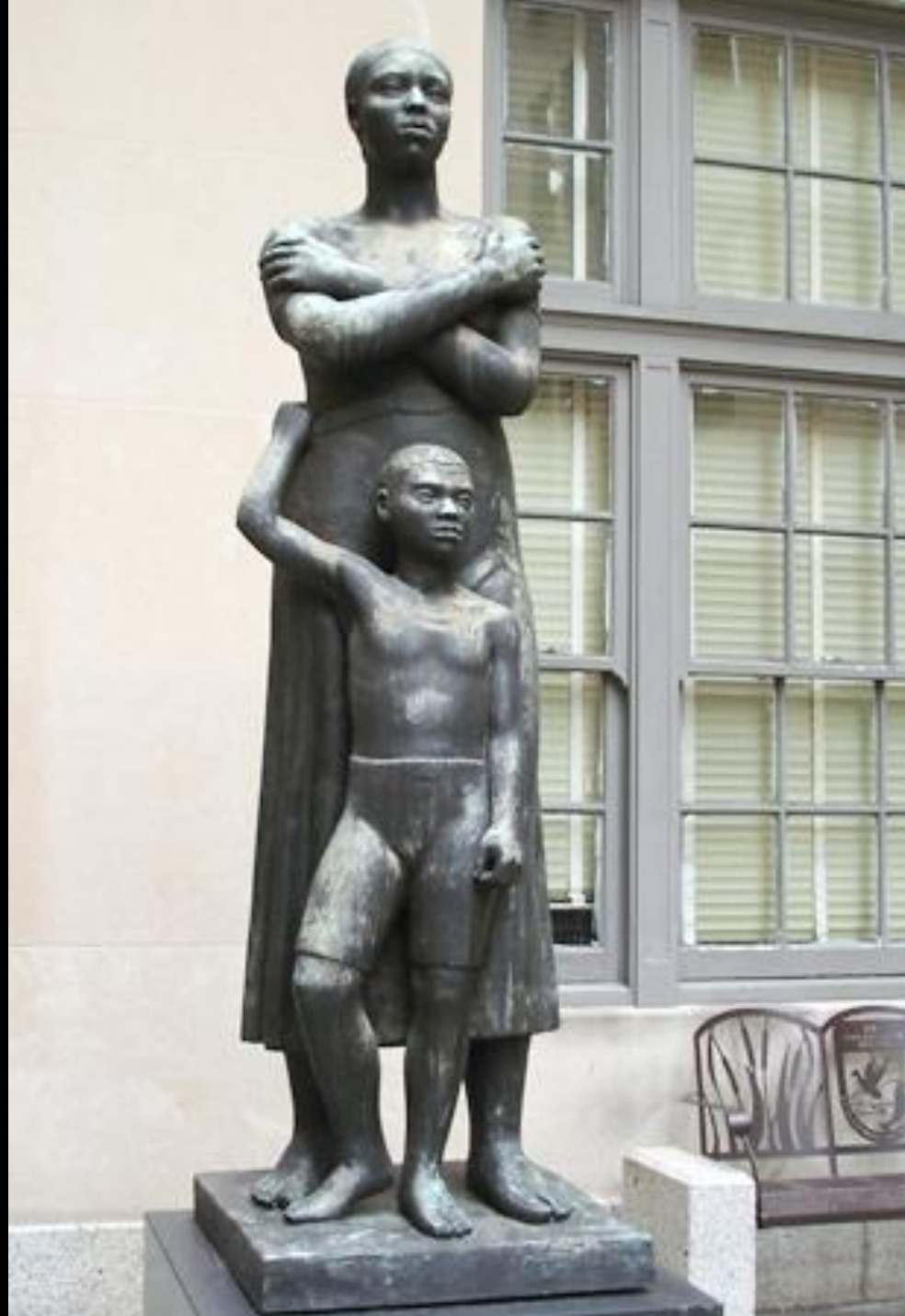
Mother and Child

U.S. Department of the Interior Washington, DC