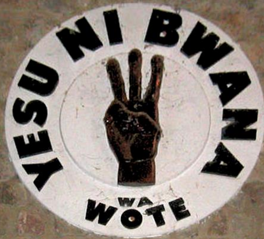
JESUS IS LORD! -- From a United Methodist Church in Congo (DRC)