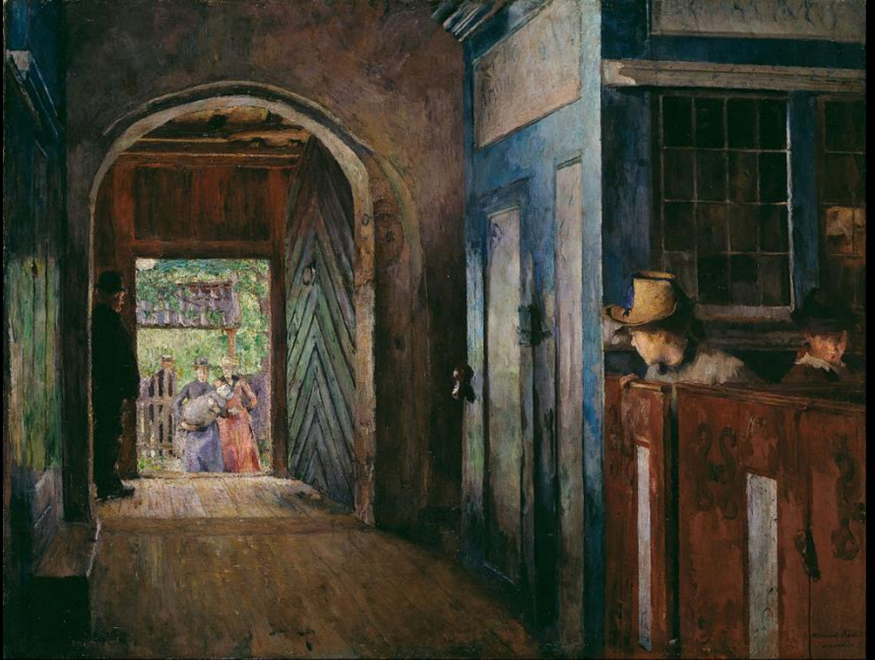
Christening in Tanum Church -- Harriet Backer, National Gallery of Norway, Oslo