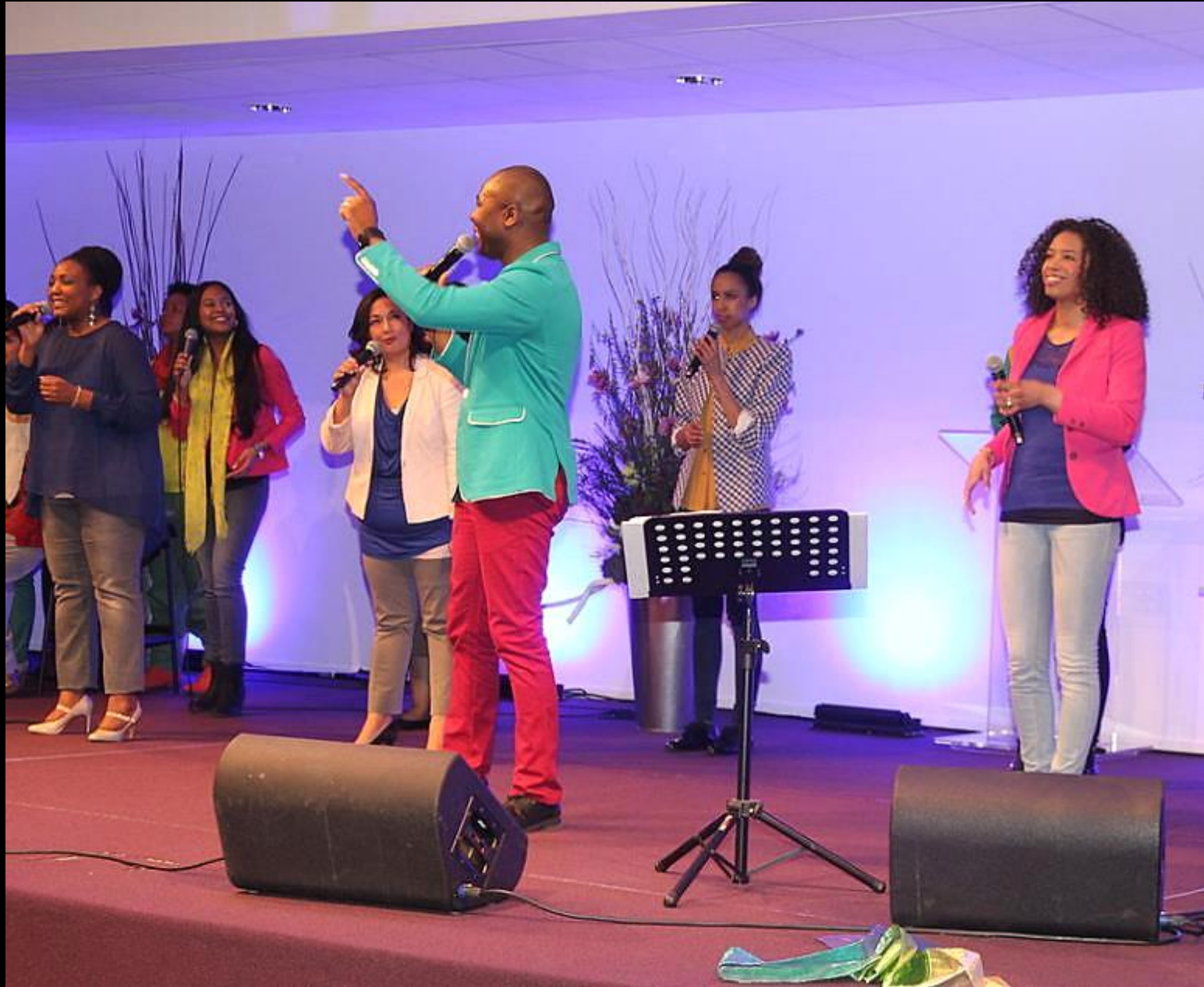
Singers and Choir -- Pentecostal Church of the Living Stone, Spijkenisse, Netherlands