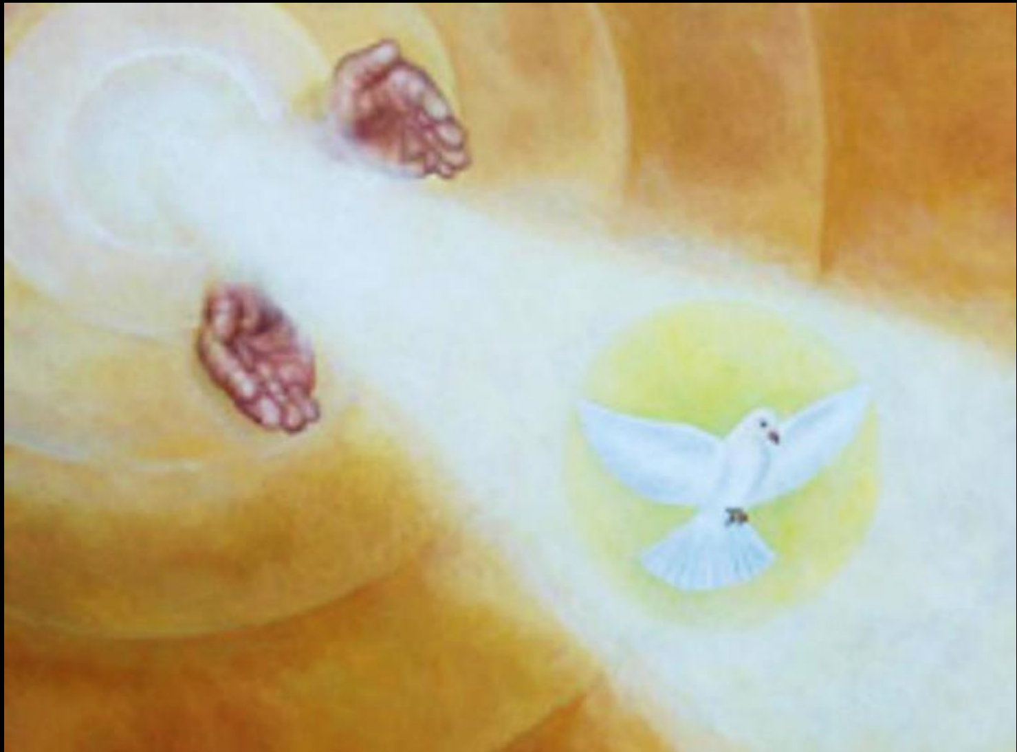
Church of the Holy Trinity, Caacupe, Paraguay