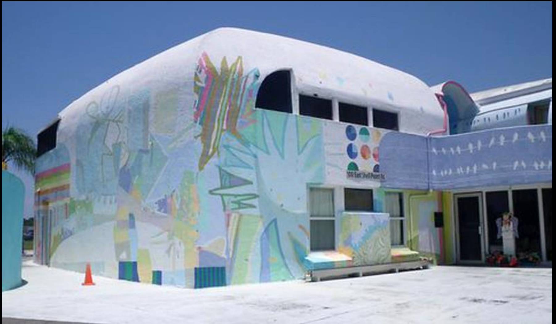
Mary and Martha House for Sheltering Abused and Homeless -- Ruskin, FL