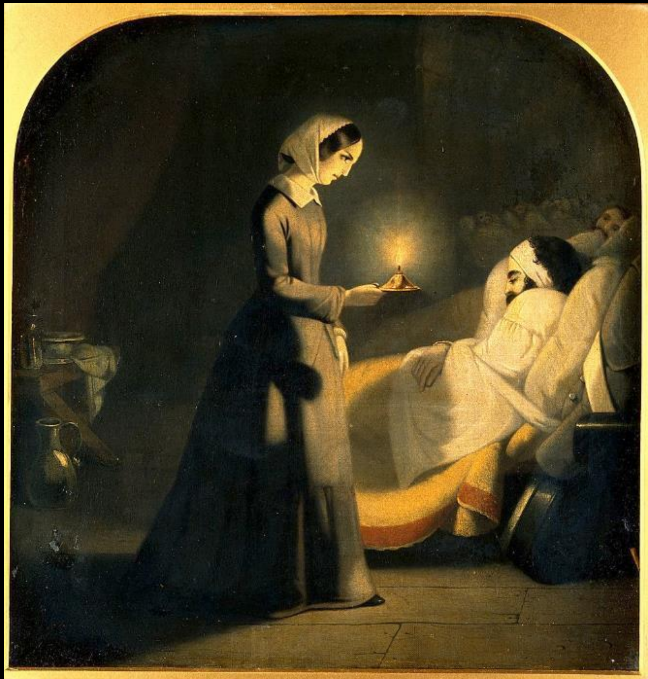
Angel of Mercy (Florence Nightingale)