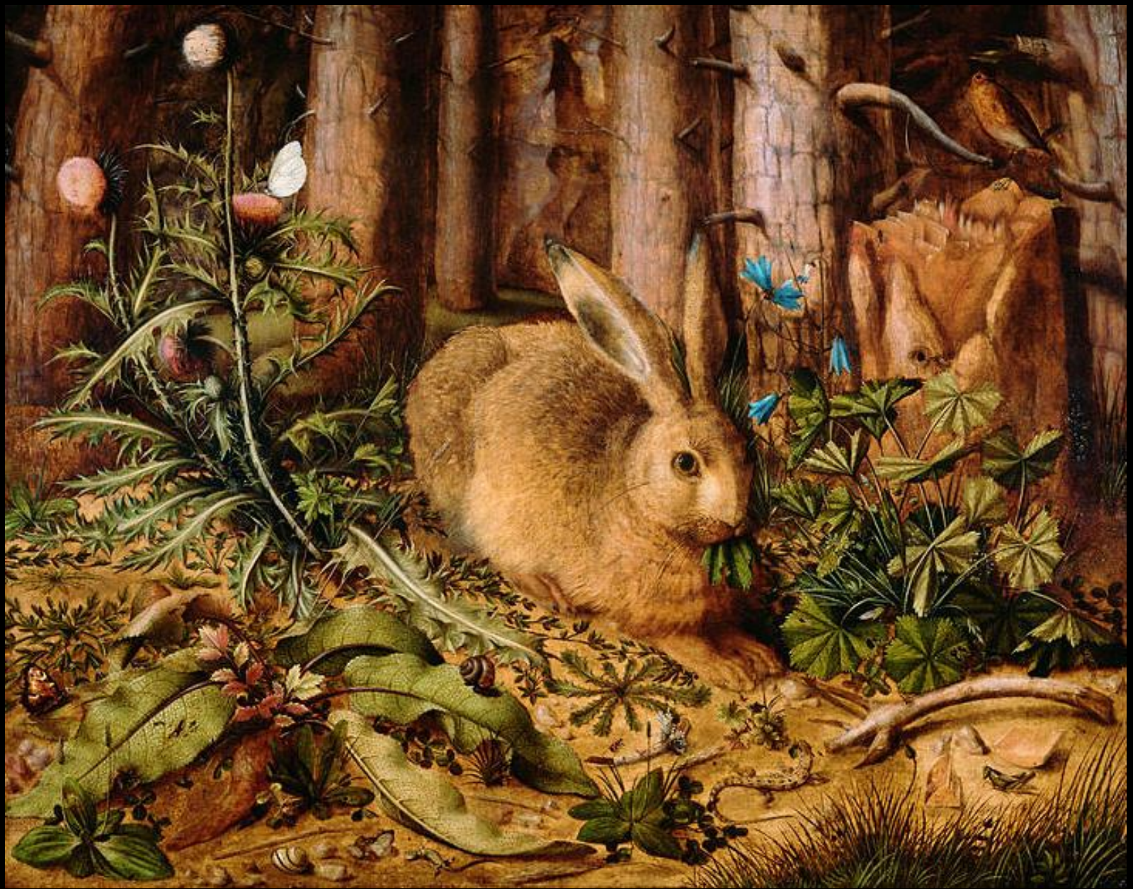
A Hare in the Forest -- Hans Hoffman, 1885, Getty Center, Los Angeles, CA