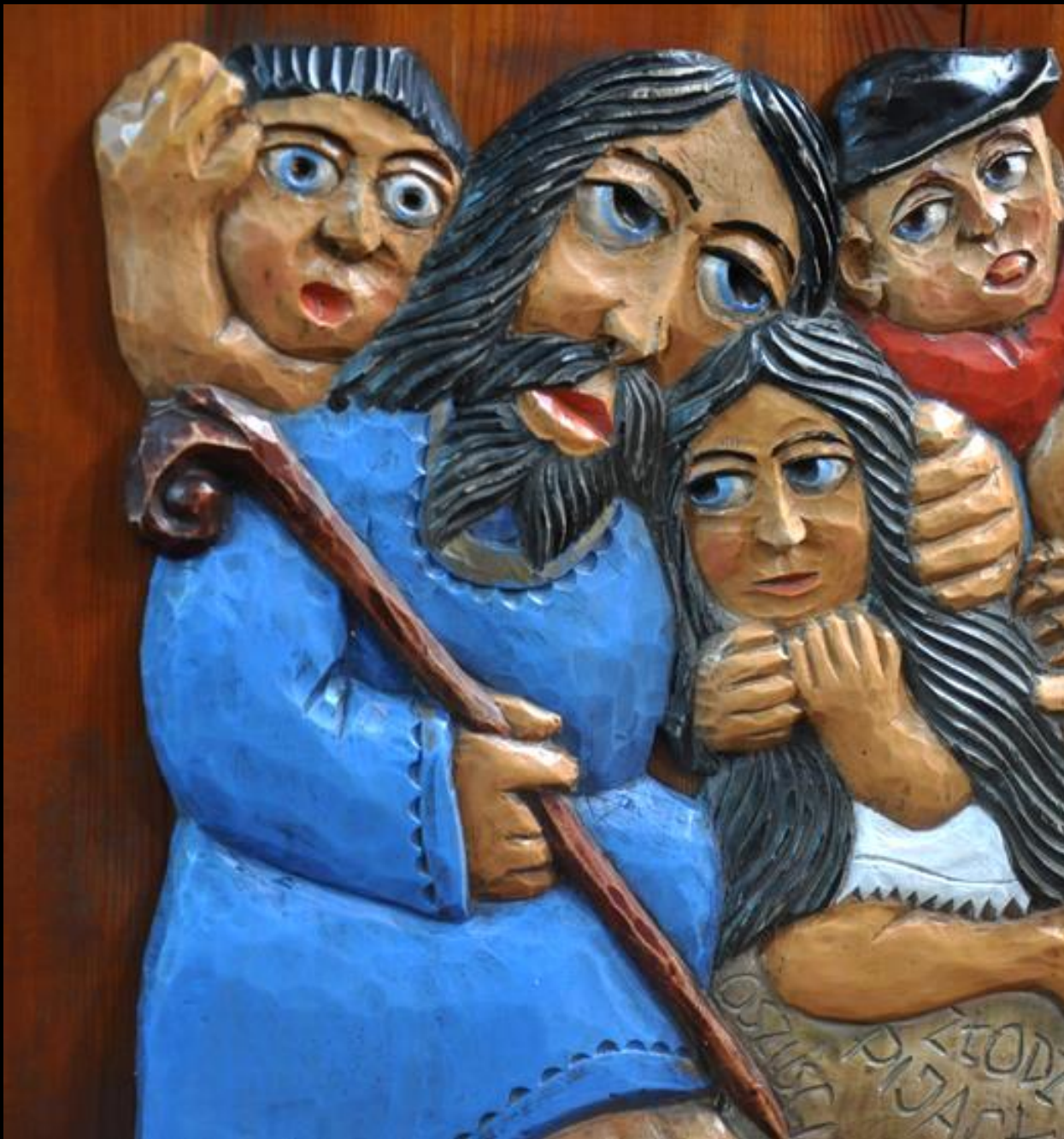
Mary of Bethany and Jesus