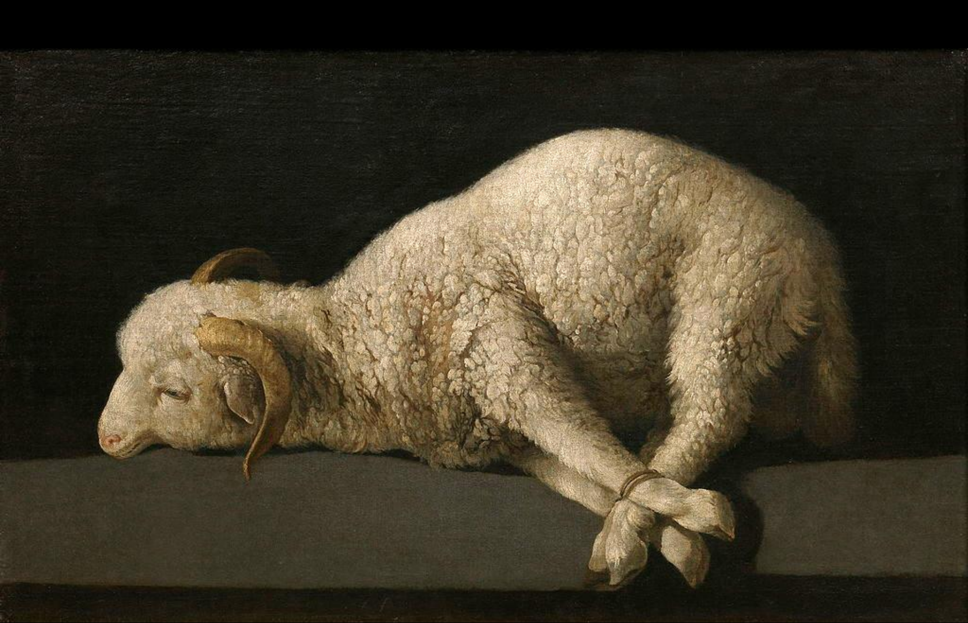
Lamb of God -- Francisco de Zurbaran, Prado, Madrid, Spain