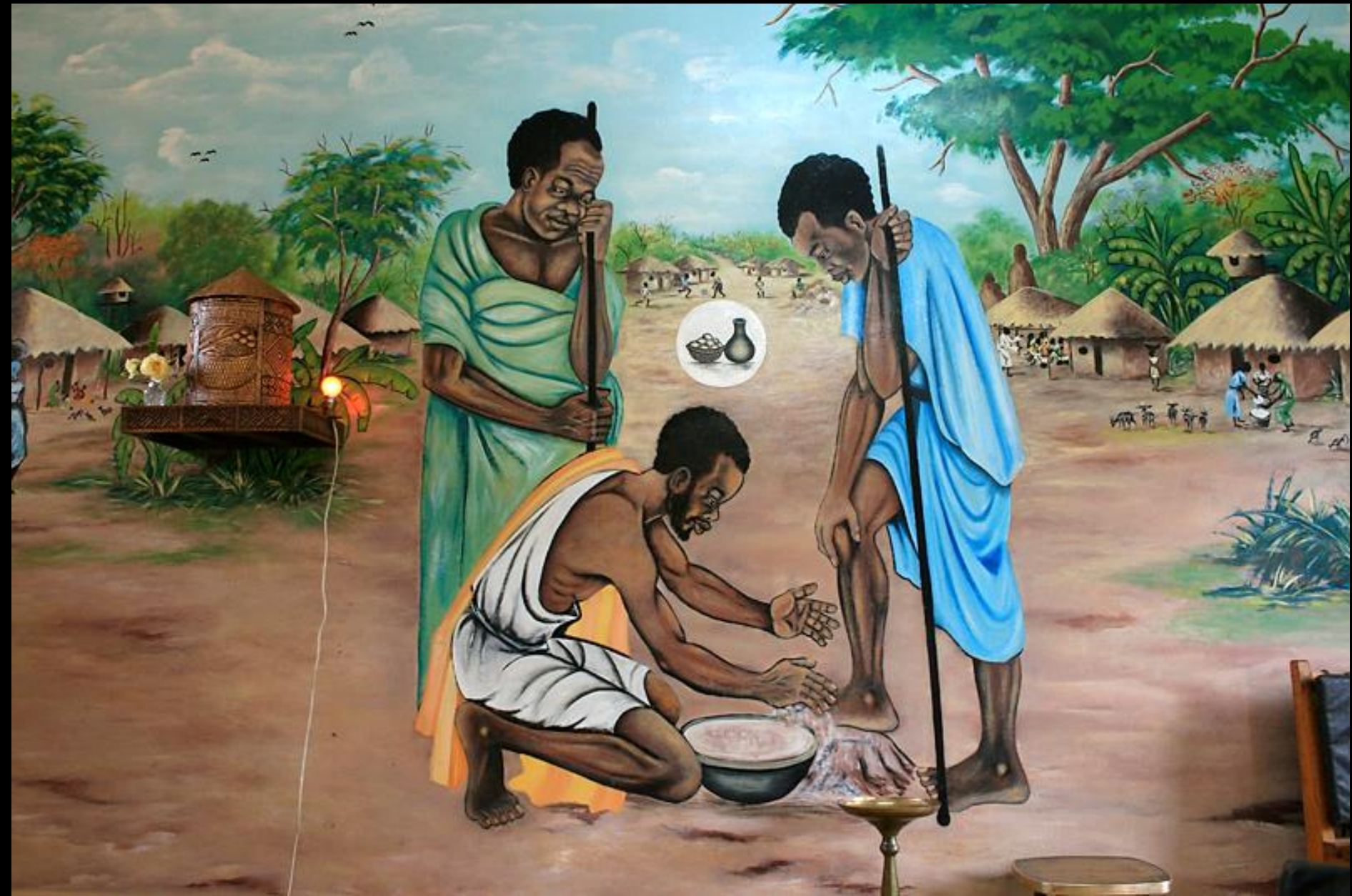
Jesus Washes His Disciples' Feet -- Victoria Falls, Zambia