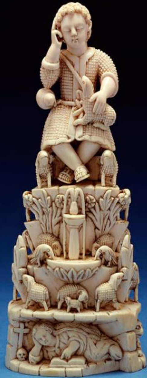
The Christ Child as Good Shepherd Goa, India