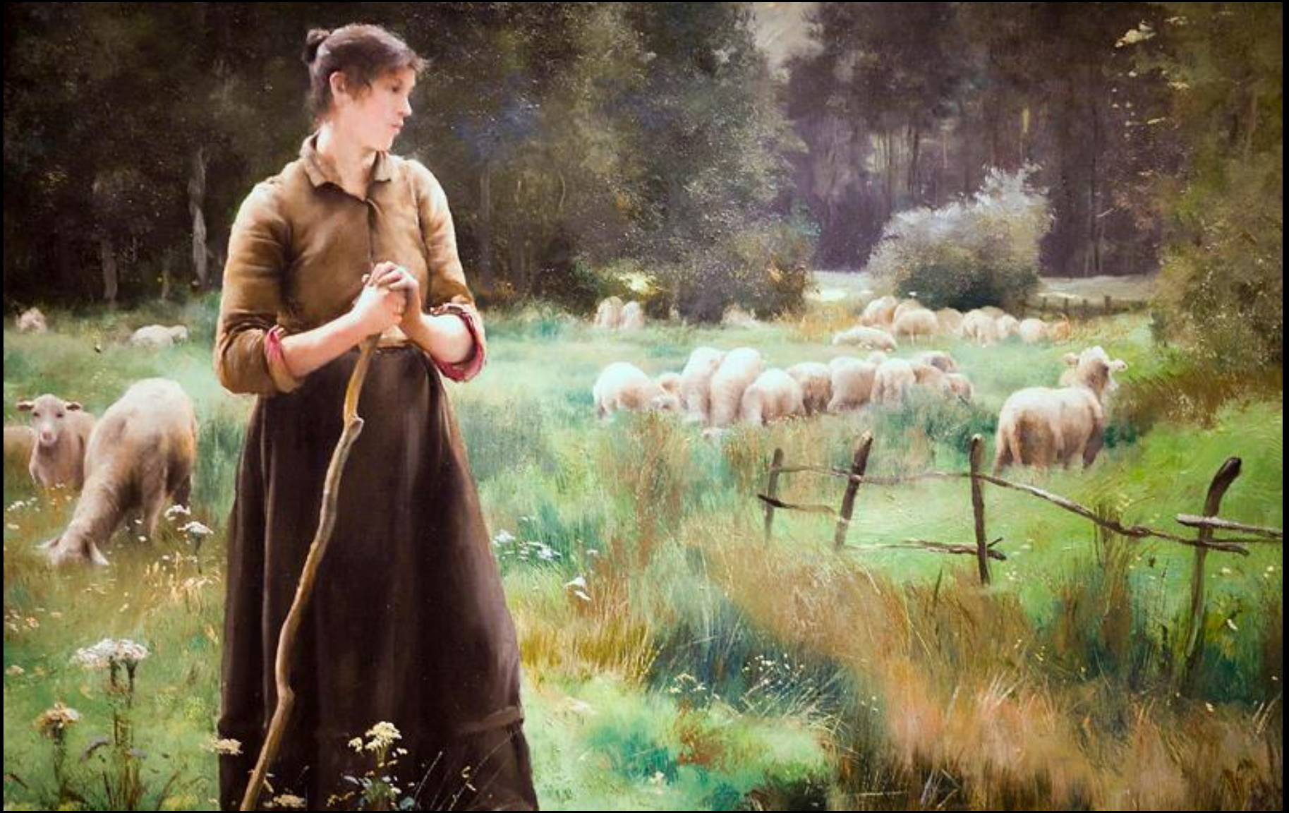
The Good Shepherd -- Julien Dupre, Legion of Honor Museum, San Francisco, CA