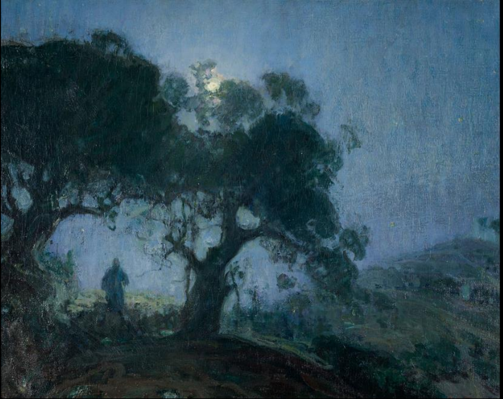
The Good Shepherd -- Henry Ossawa Tanner, Zimmerli Museum, Rutgers, NJ