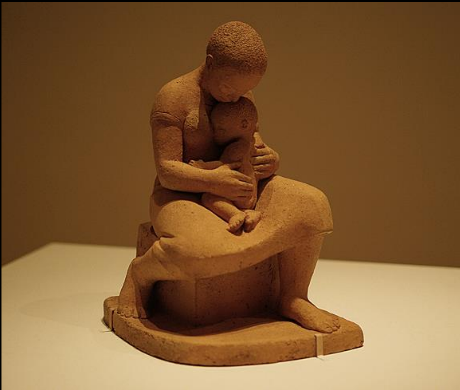
Mother and Child -- Elizabeth Catlett, Museum of Modern Art, New York