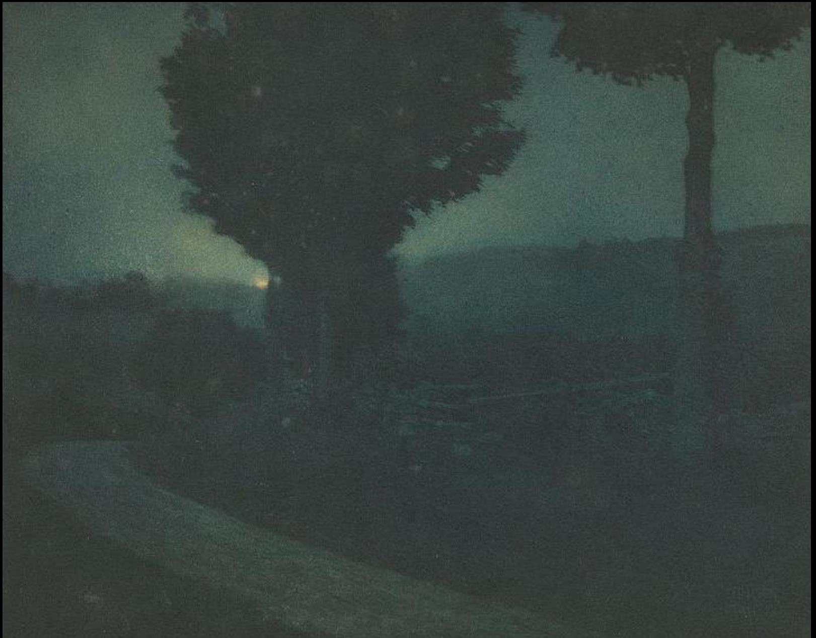
Road Into the Valley – Moonrise -- Edward Steichen, photo gravure