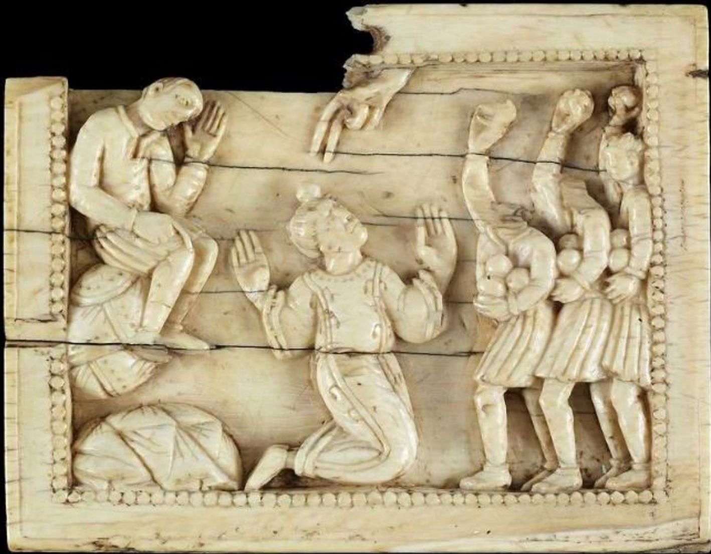
The Stoning of Stephen -- Mosan Workshop, Walters Art Museum, Baltimore, MD