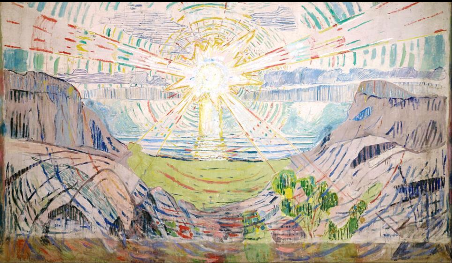
The Sun -- Edvard Munch, Munch Museum, Oslo, Norway