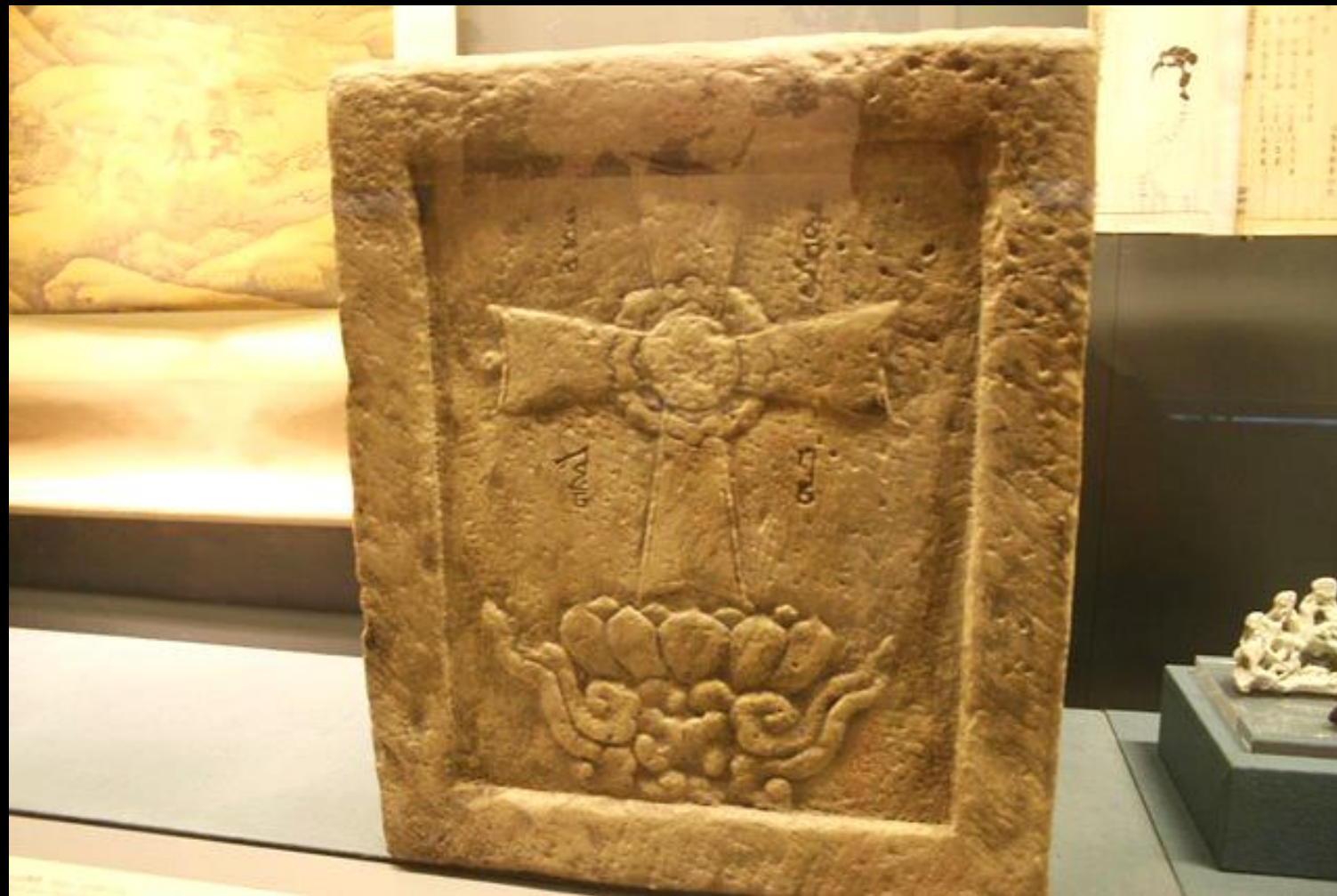
Nestorian Stone Cross from location of ancient monastery, Beijing, China, 1271-1368