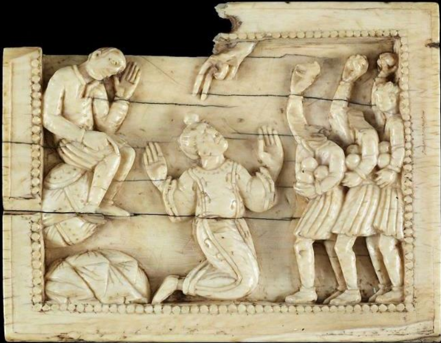
The Stoning of Stephen -- Mosan Workshop, Walters Art Museum, Baltimore, MD