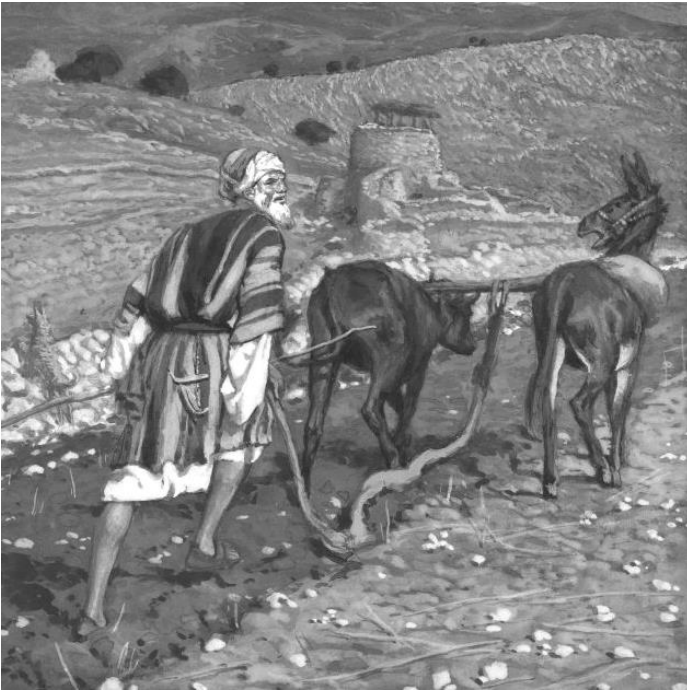
THE MAN AT THE PLOUGH, James Tissot, Brooklyn Museum, between 1886 and 1894

http://commons.wikimedia.org/wiki/File:Brooklyn_Museum_-_The_Man_at_the_Plough_(L%27homme_%C3%A0_la_charrue)_-_James_Tissot_-_overall.jpg