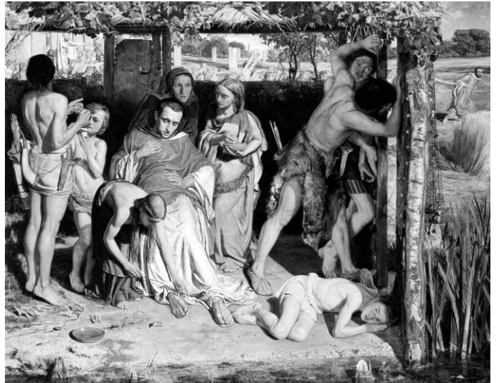
A CONVERTED BRITISH FAMILY SHELTERING A CHRISTIAN MISSIONARY FROM THE PERSECUTION OF THE DRUIDS, William Holman Hunt, Ashmolean Museum, Oxford, UK, 1850

2 Thessalonians 3:6-13 Now we command you, beloved, in the name of our Lord Jesus Christ, to keep away from believers who are living in idleness and not according to the tradition that they received from us. For you yourselves know how you ought to imitate us; we were not idle when we were with you, and we did not eat anyone's bread without paying for it; but with toil and labor we worked night and day, so that we might not burden any of you. This was not because we do not have that right, but in order to give you an example to imitate. For even when we were with you, we gave you this command: Anyone unwilling to work should not eat. For we hear that some of you are living in idleness, mere busybodies, not doing any work. Now such persons we command and exhort in the Lord Jesus Christ to do their work quietly and to earn their own living. Brothers and sisters, do not be weary in doing what is right.