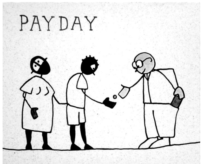
THE BIG DIVIDE, Eden Project, Kernow, Cornwall, UK, ca. 2010

Hebrews 13:1-8, 15-16 Let mutual love continue. Do not neglect to show hospitality to strangers, for by doing that some have entertained angels without knowing it. Remember those who are in prison, as though you were in prison with them; those who are being tortured, as though you yourselves were being tortured. Let marriage be held in honor by all, and let the marriage bed be kept undefiled; for God will judge fornicators and adulterers. Keep your lives free from the love of money, and be content with what you have; for he has said, "I will never leave you or forsake you." So we can say with confidence, "The Lord is my helper; I will not be afraid. What can anyone do to me?" Remember your leaders, those who spoke the word of God to you; consider the outcome of their way of life, and imitate their faith. Jesus Christ is the same yesterday and today and forever. Through him, then, let us continually offer a sacrifice of praise to God, that is, the fruit of lips that confess his name. Do not neglect to do good and to share what you have, for such sacrifices are pleasing to God.