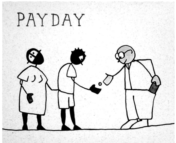
THE BIG DIVIDE, Eden Project, Kernow, Cornwall, UK, ca. 2010

Hebrews 13:1-8, 15-16 Let mutual love continue. Do not neglect to show hospitality to strangers, for by doing that some have entertained angels without knowing it. Remember those who are in prison, as though you were in prison with them; those who are being tortured, as though you yourselves were being tortured. Let marriage be held in honor by all, and let the marriage bed be kept undefiled; for God will judge fornicators and adulterers. Keep your lives free from the love of money, and be content with what you have; for he has said, "I will never leave you or forsake you." So we can say with confidence, "The Lord is my helper; I will not be afraid. What can anyone do to me?" Remember your leaders, those who spoke the word of God to you; consider the outcome of their way of life, and imitate their faith. Jesus Christ is the same yesterday and today and forever. Through him, then, let us continually offer a sacrifice of praise to God, that is, the fruit of lips that confess his name. Do not neglect to do good and to share what you have, for such sacrifices are pleasing to God.