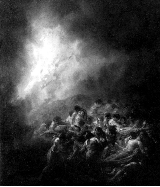
FIRE BY NIGHT, Francisco de Goya, Collection Varez Jose, San Sebastian, Spain, 1793

http://commons.wikimedia.org/wiki/File:Un_incendio_(Goya).jpg