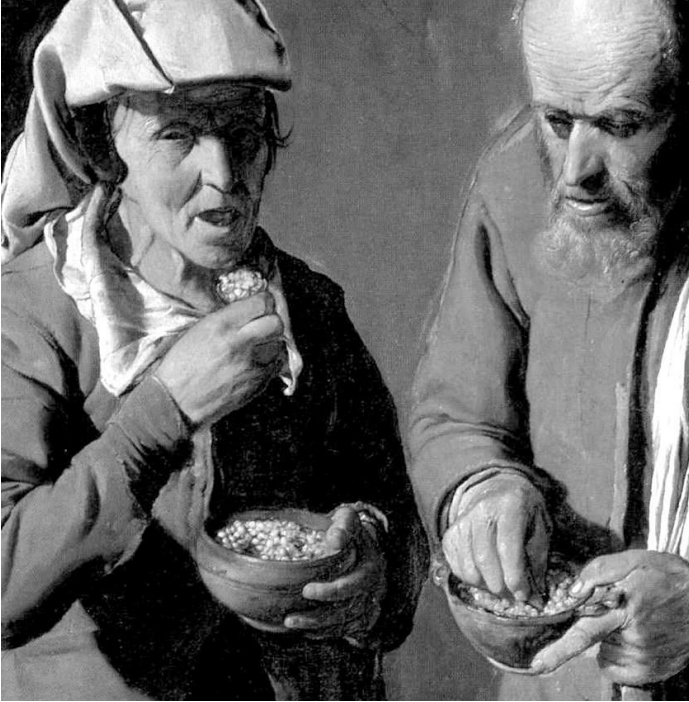
Peasant Couple Eating , detail, George de la Tour, Gemaldegalerie, Berlin, Germany, ca. 1620.

Deuteronomy 4:1-2, 6-9 So now, Israel, give heed to the statutes and ordinances that I am teaching you to observe, so that you may live to enter and occupy the land that the LORD, the God of your ancestors, is giving you. You must neither add anything to what I command you nor take away anything from it, but keep the commandments of the LORD your God with which I am charging you. You must observe them diligently, for this will show your wisdom and discernment to the peoples, who, when they hear all these statutes, will say, "Surely this great nation is a wise and discerning people!" For what other great nation has a god so near to it as the LORD our God is whenever we call to him? And what other great nation has statutes and ordinances as just as this entire law that I am setting before you today? But take care and watch yourselves closely, so as neither to forget the things that your eyes have seen nor to let them slip from your mind all the days of your life; make them known to your children and your children's children--