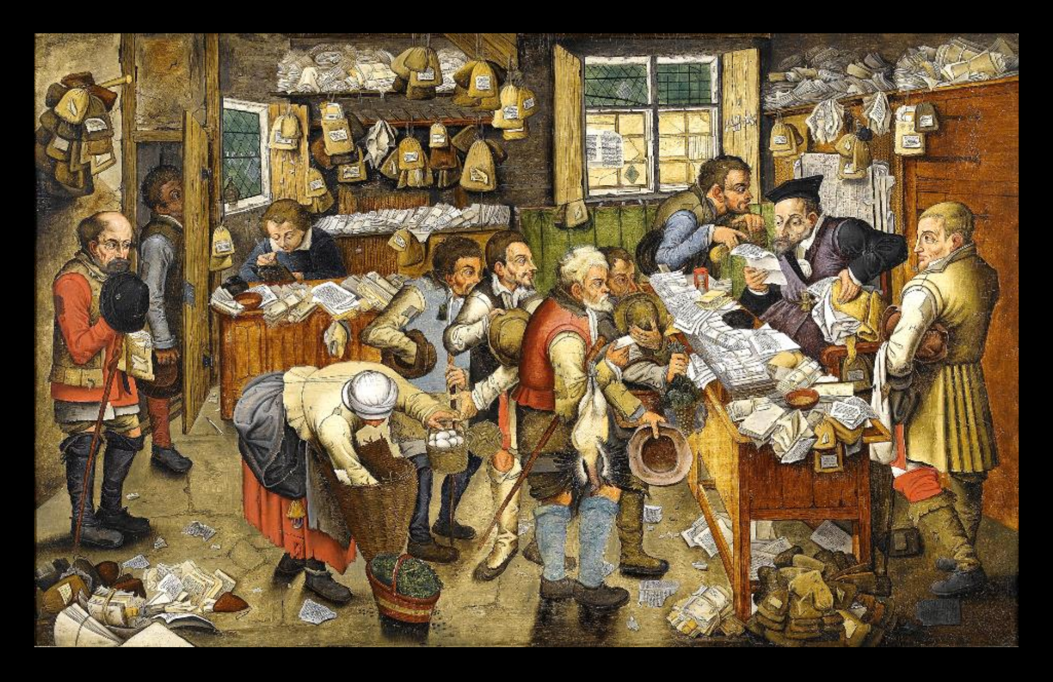
Payment of the Tithe, or, the Tax Collector -- Workshop of Pieter Brueghel the Younger