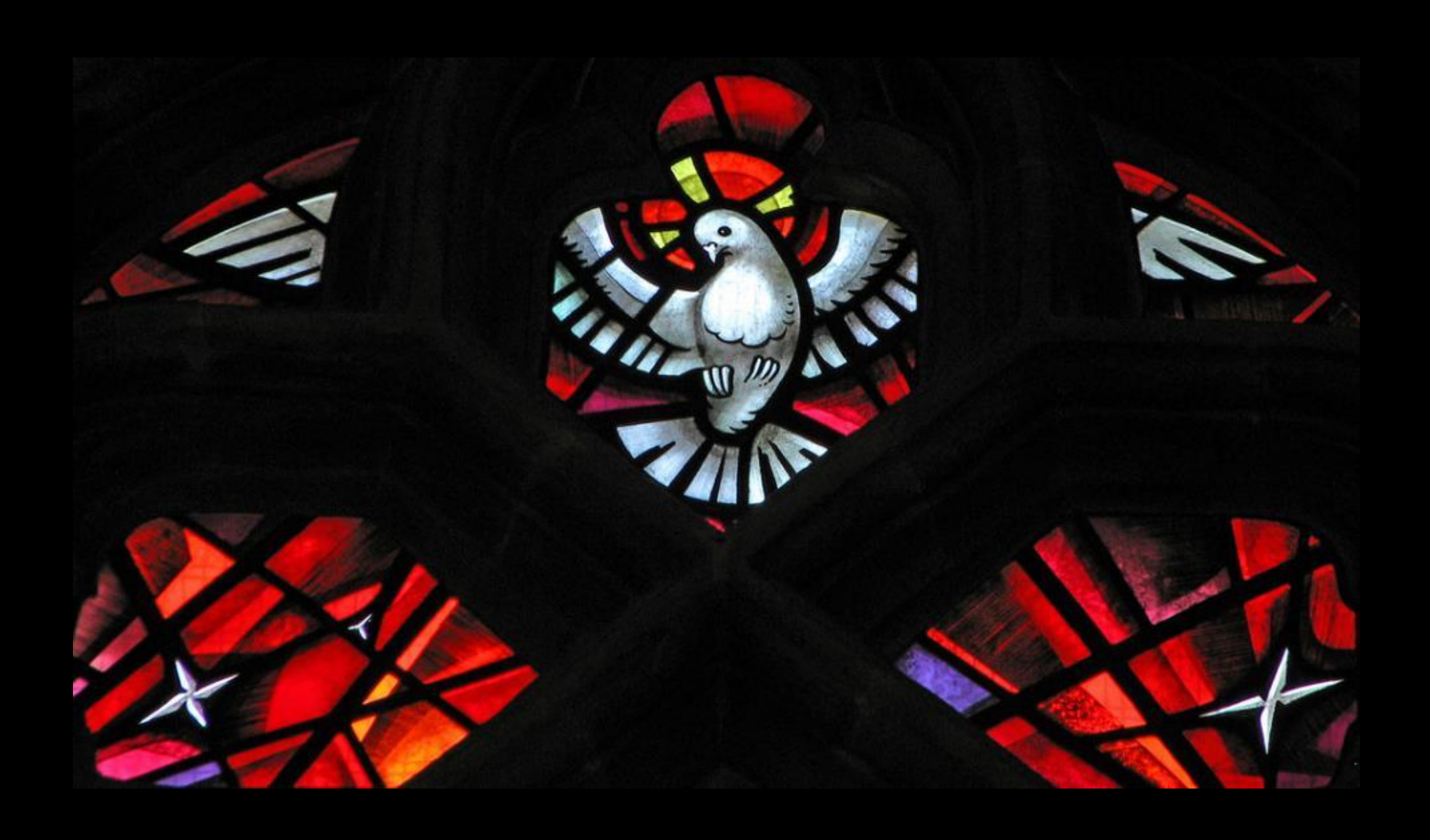
Holy Spirit -- St. George's Cathedral, Southwark, England