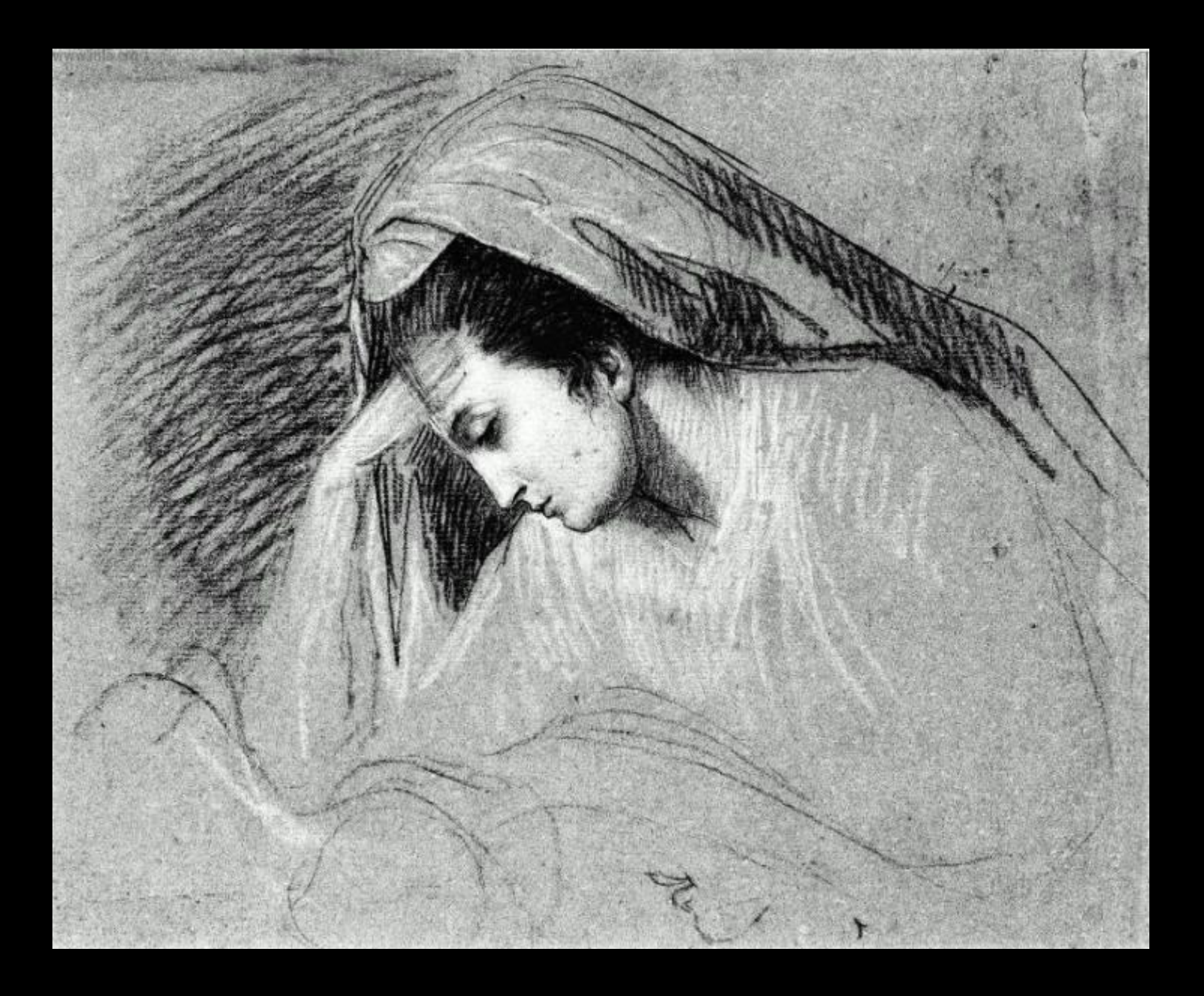
Study for the Head of the Virgin -- John Singleton Copley, Museum of Fine Arts, Boston, MA