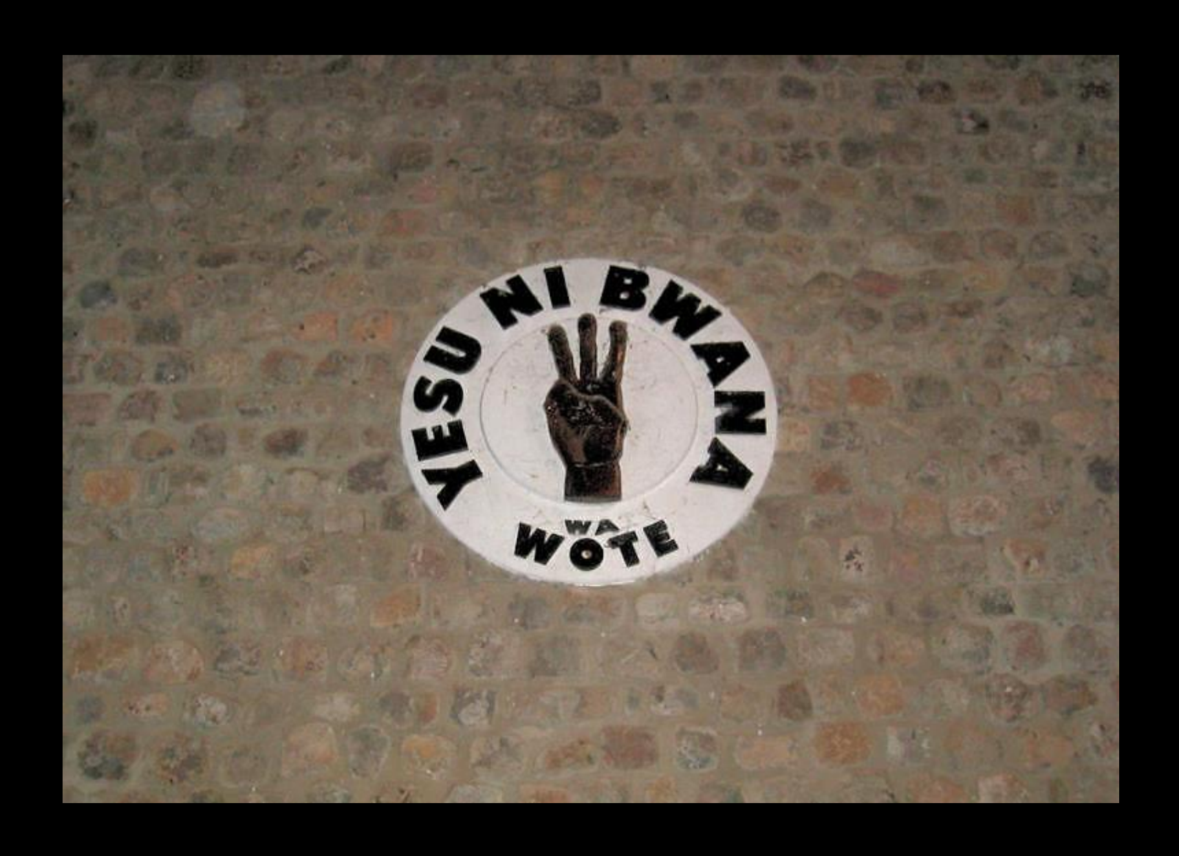
Jesus is Lord of All -- Panel in Chapel, Mulungwishi Mission, D. R. Congo