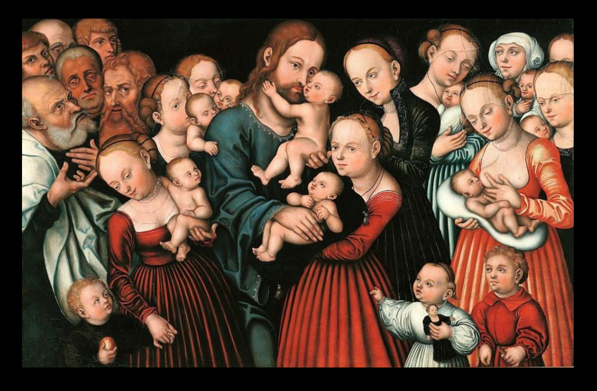
Christ Blessing the Children -- Lucas Cranach, Wawel Castle, Krakow, Poland