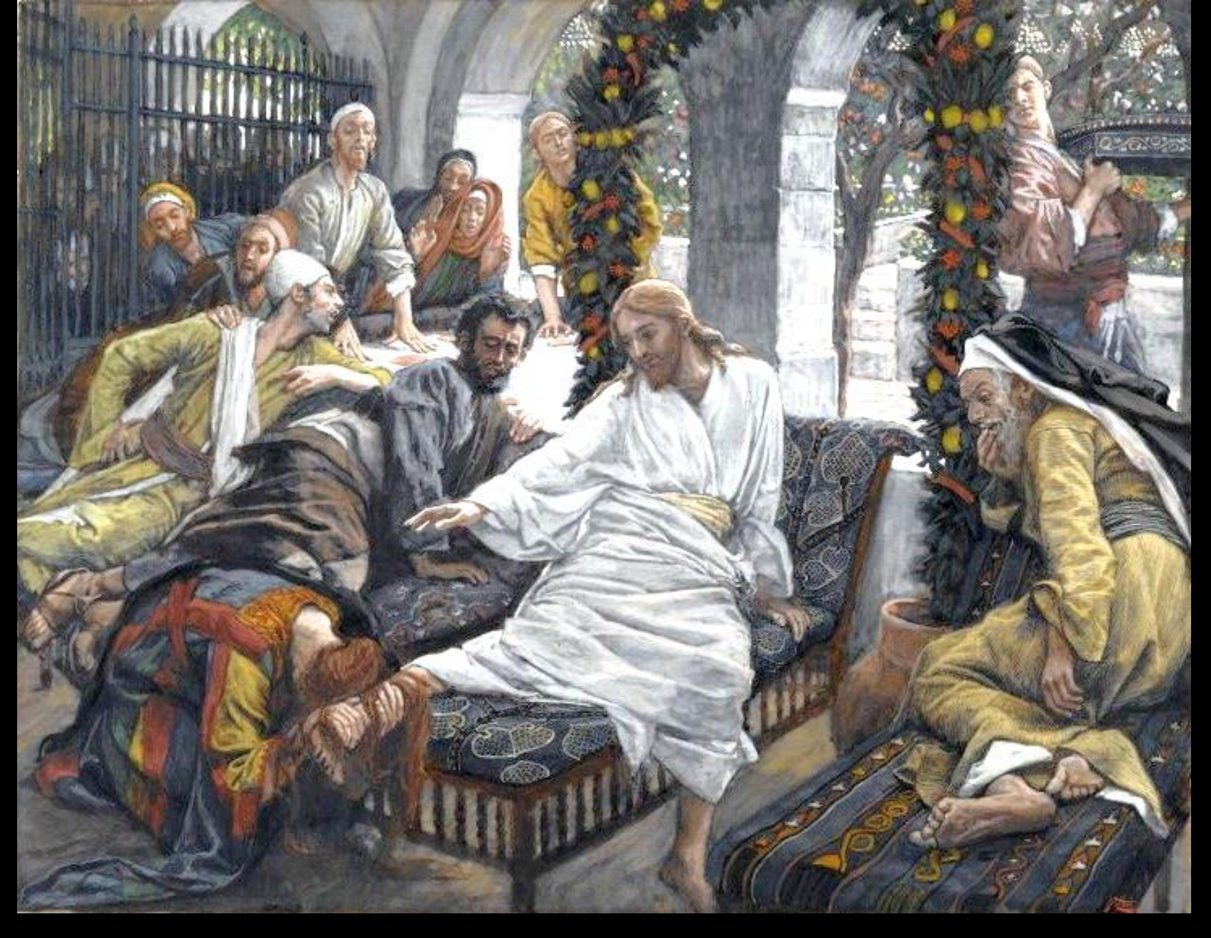
The Perfume of the Magdalene -- James Tissot, Brooklyn Museum, New York, NY