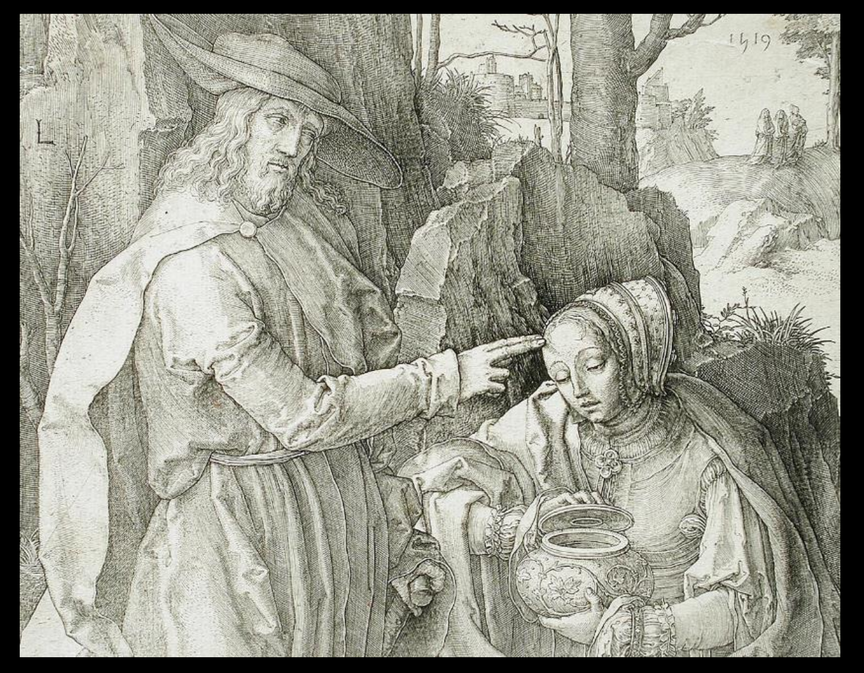
Christ Appears to Mary in the Garden -- Lucas van Leyden, Los Angeles County Museum of Art, CA