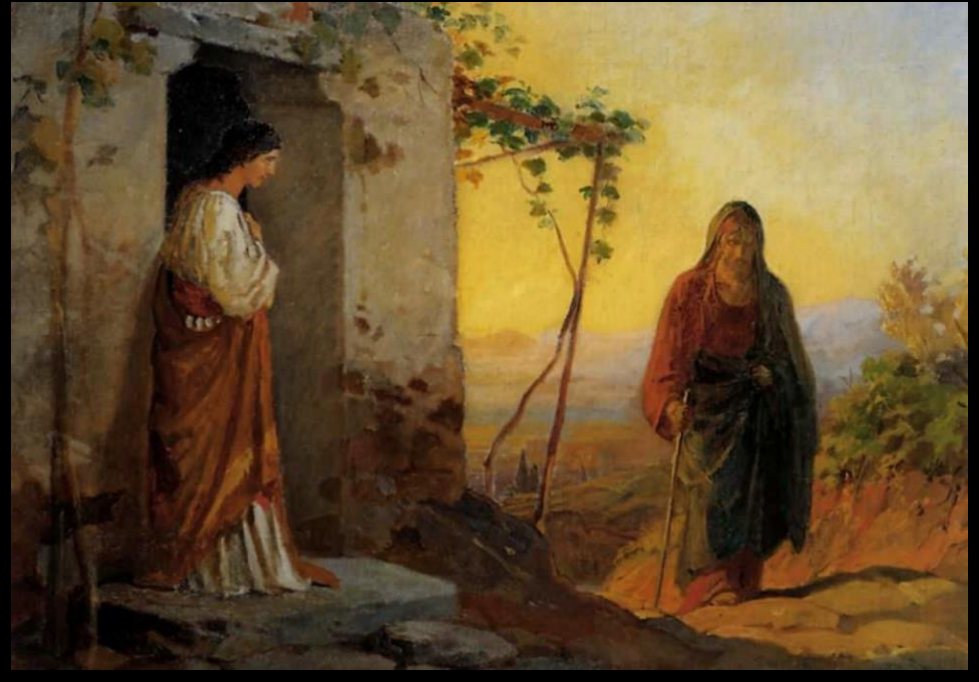
Mary, Sister of Lazarus, Greets Jesus -- Nikolai Ge, Russian, 1864