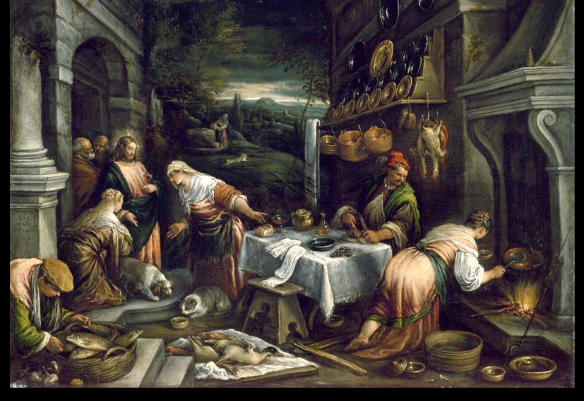
Christ in the House of Mary, Martha, and Lazarus -- Jacopo Bassano, Museum of Fine Arts, Houston, TX