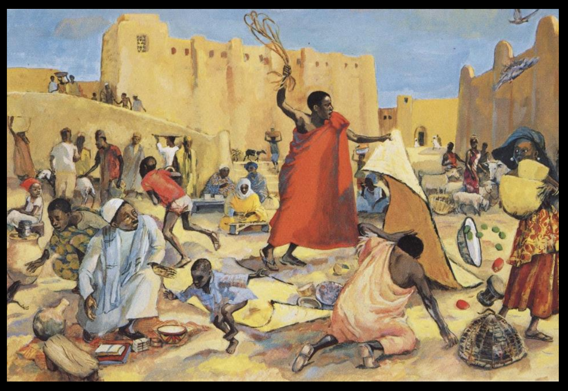
Jesus Drives Out the Merchants -- JESUS MAFA