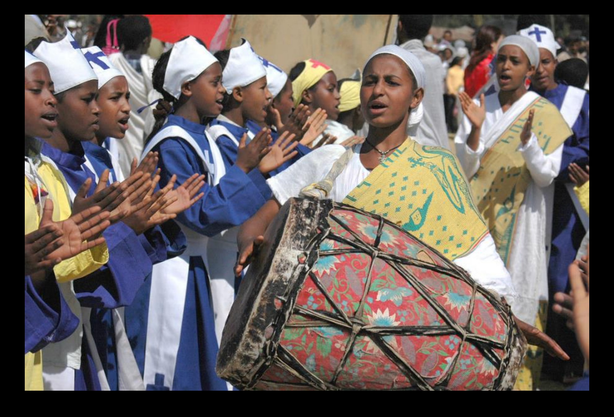
Celebration of Timket, the Ethiopian Orthodox Festival of Epiphany, Addis Ababa, Ethiopia