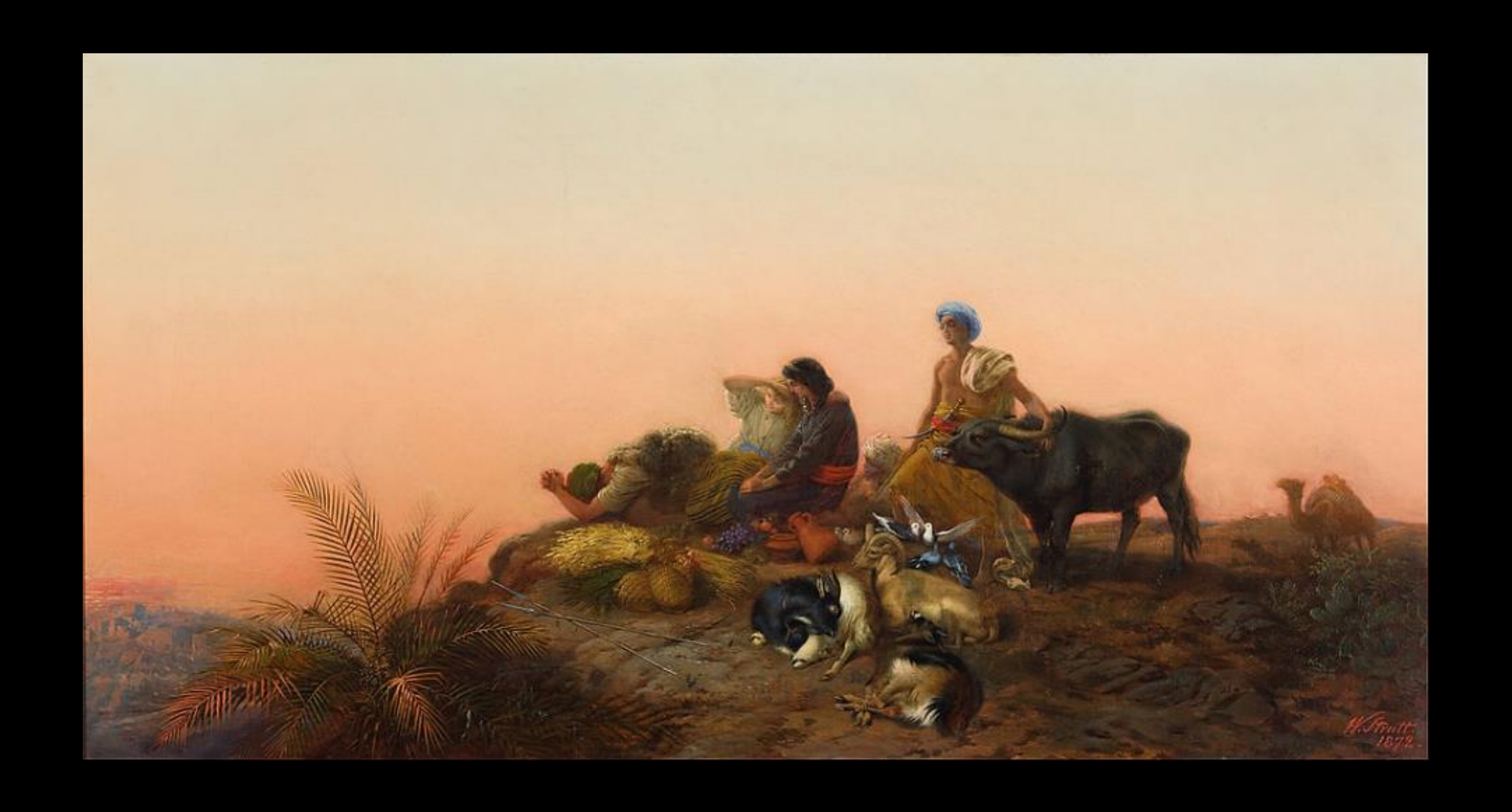
Jerusalem Pilgrims -- William Strutt, Art Gallery of South Australia, Adelaide, Australia