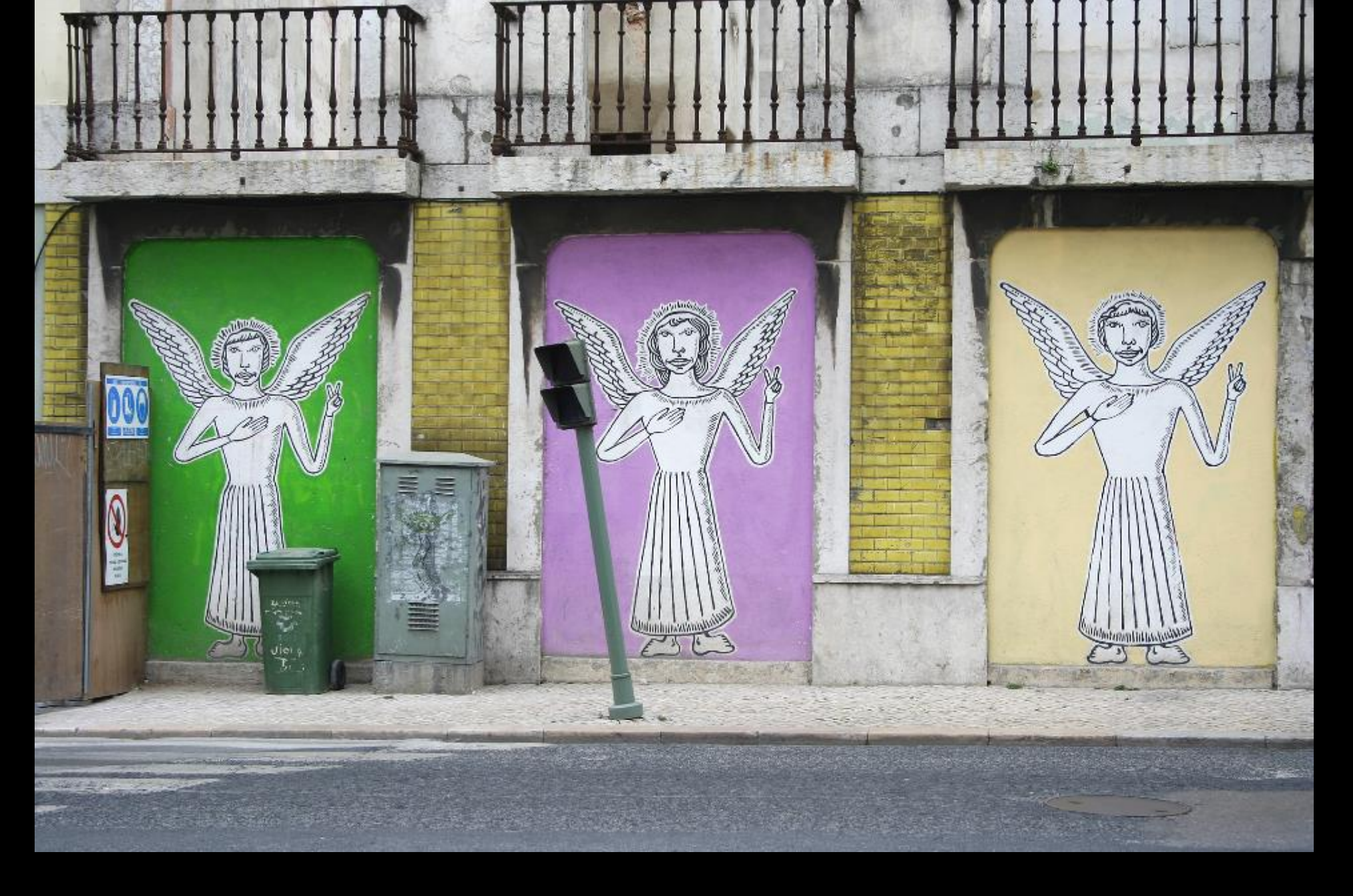
Lisbon's Angels 2 -- Lisbon, Portugal