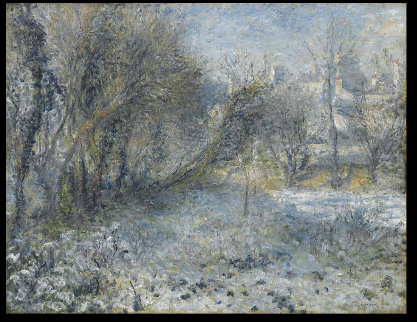
Snow-covered Landscape -- Pierre-Auguste Renoir, Musee de l'Orangerie, Paris, France