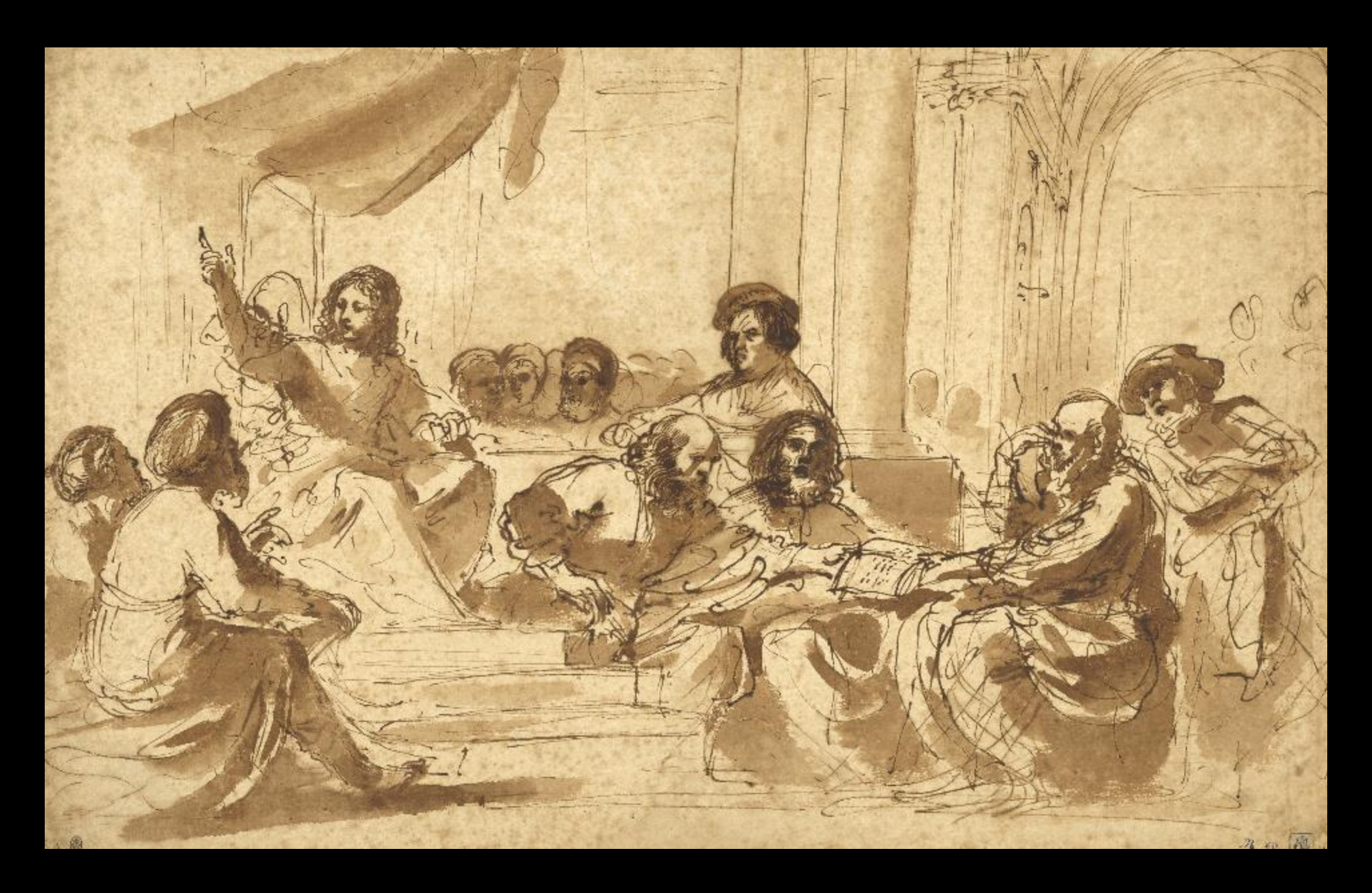
Christ Preaching in the Temple -- Guercino, J. Paul Getty Museum, Los Angeles, CA