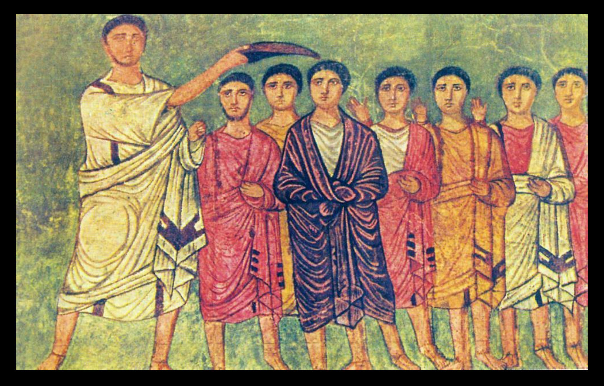
David is Anointed and Affirmed as King -- Dura Europos Synagogue, Syria