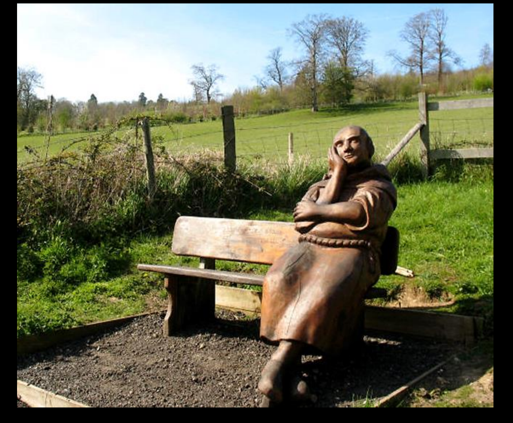
"Pilgrim bound by staff and faith, rest thy bones" -- Wood sculpture, Harrietsham, England