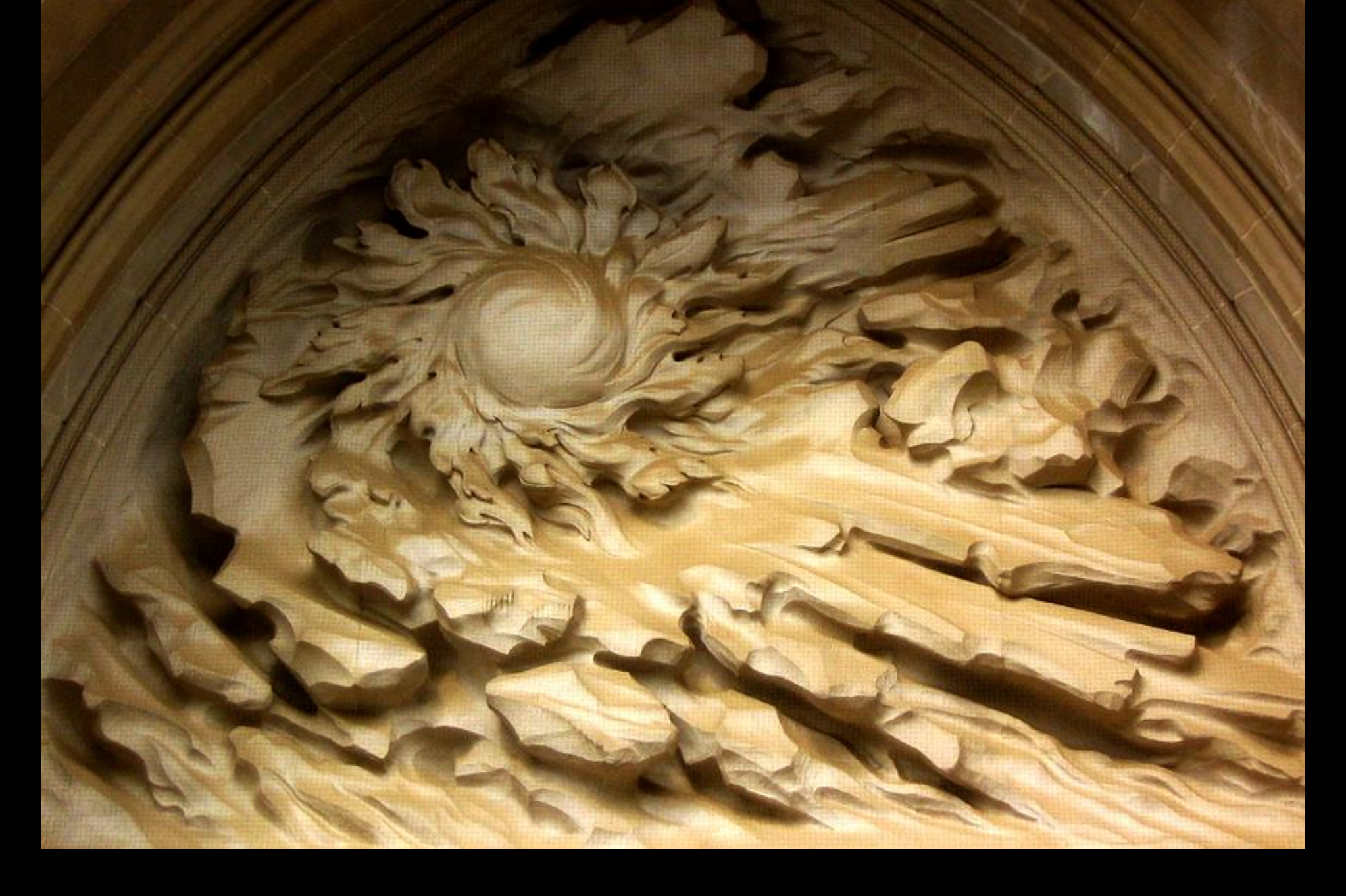
Separation of Light from Darkness -- Frederick Hart, National Cathedral, Washington, DC