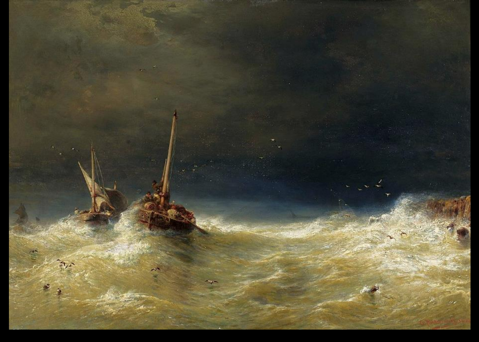
Sea Storm -- Eduard Hildebrandt, National Museum in Warsaw, Warsaw, Poland