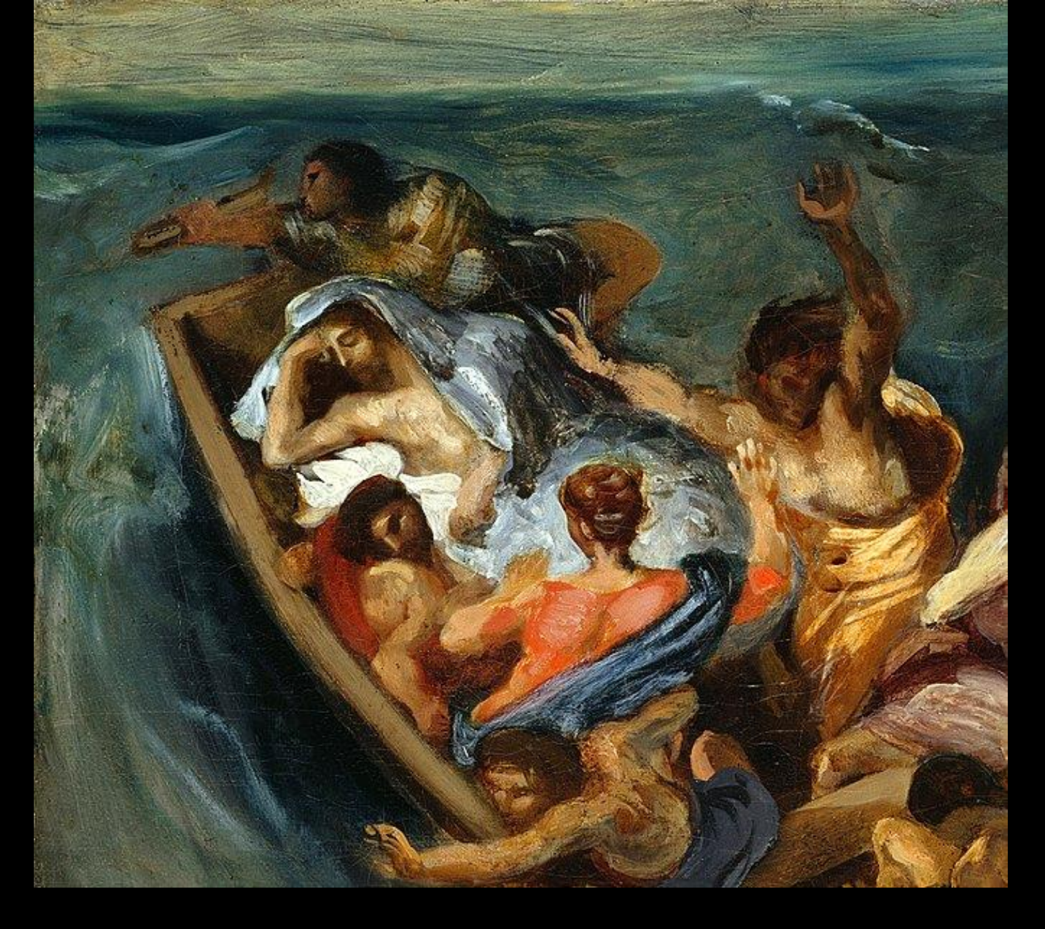
Christ on the Sea of Galilee, detail -- Eugene Delacroix, Nelson-Atkins Museum of Art, Kansas City, MO