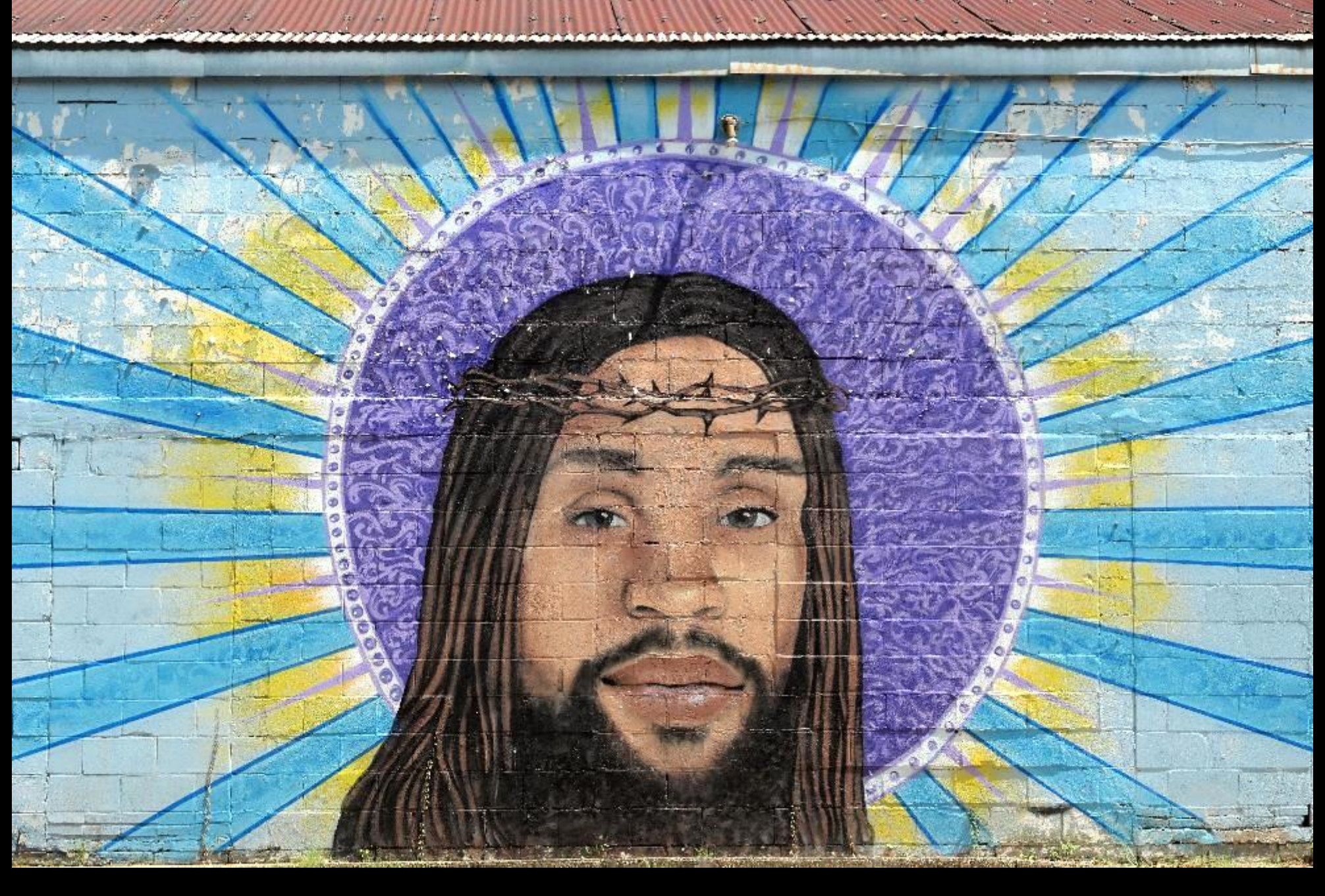
Jesus, the Holy Mural -- The Way Jesus Christ Christian Church, New Orleans