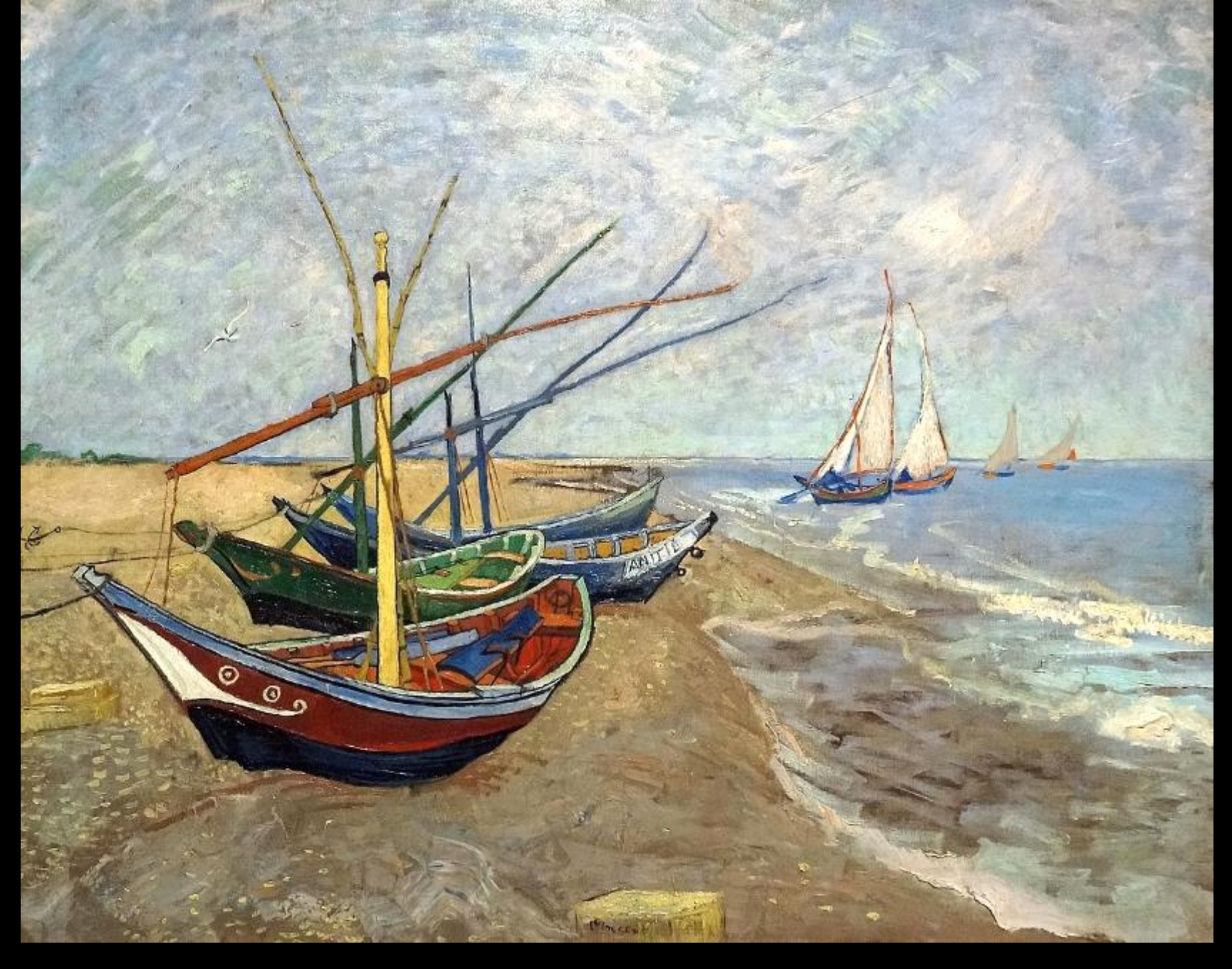
Fishing Boats on the Beach -- Vincent Van Gogh, Van Gogh Museum, Amsterdam