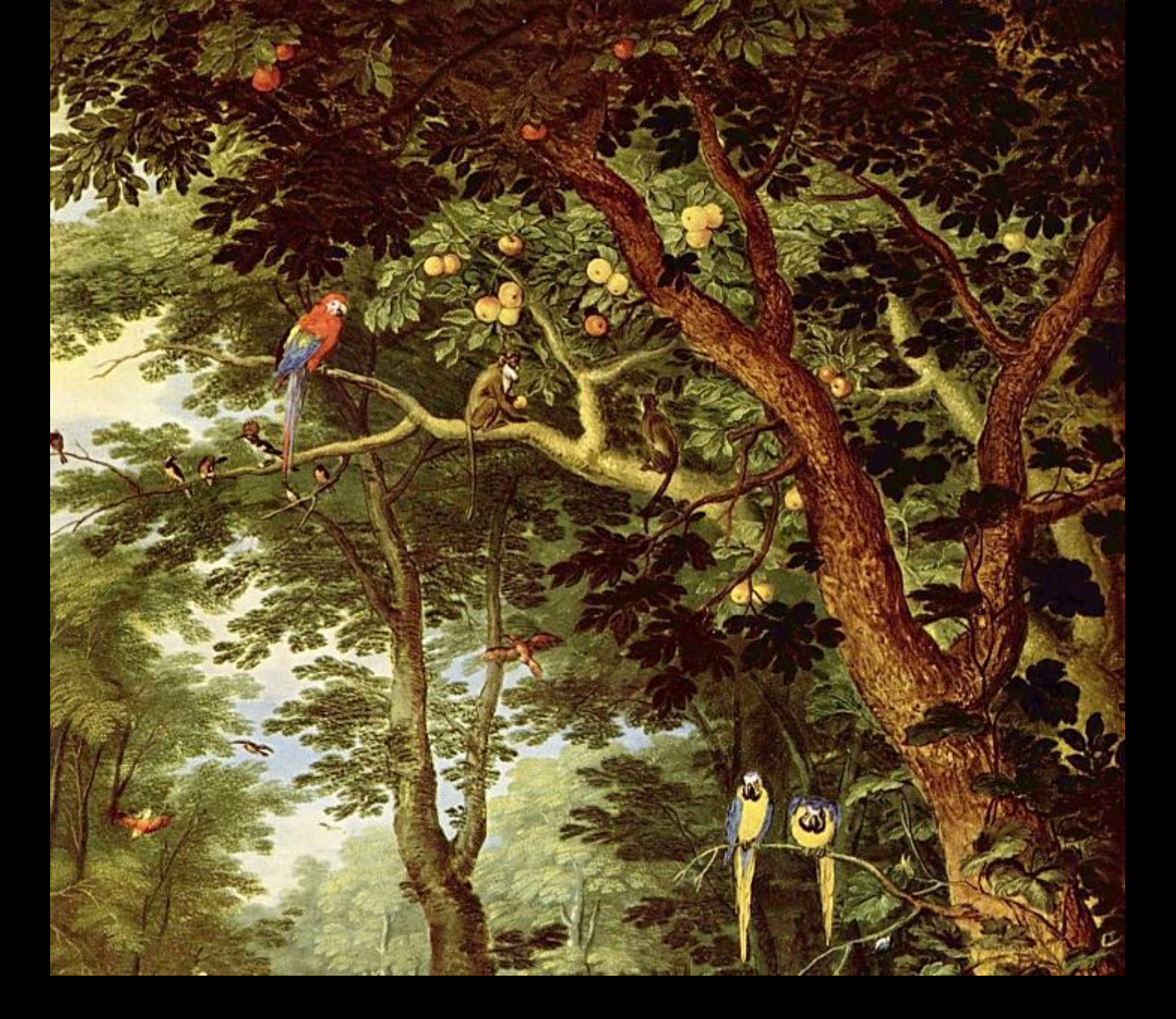
Jan Bruegel -- Paradise, Gemaldegalerie, Berlin, Germany