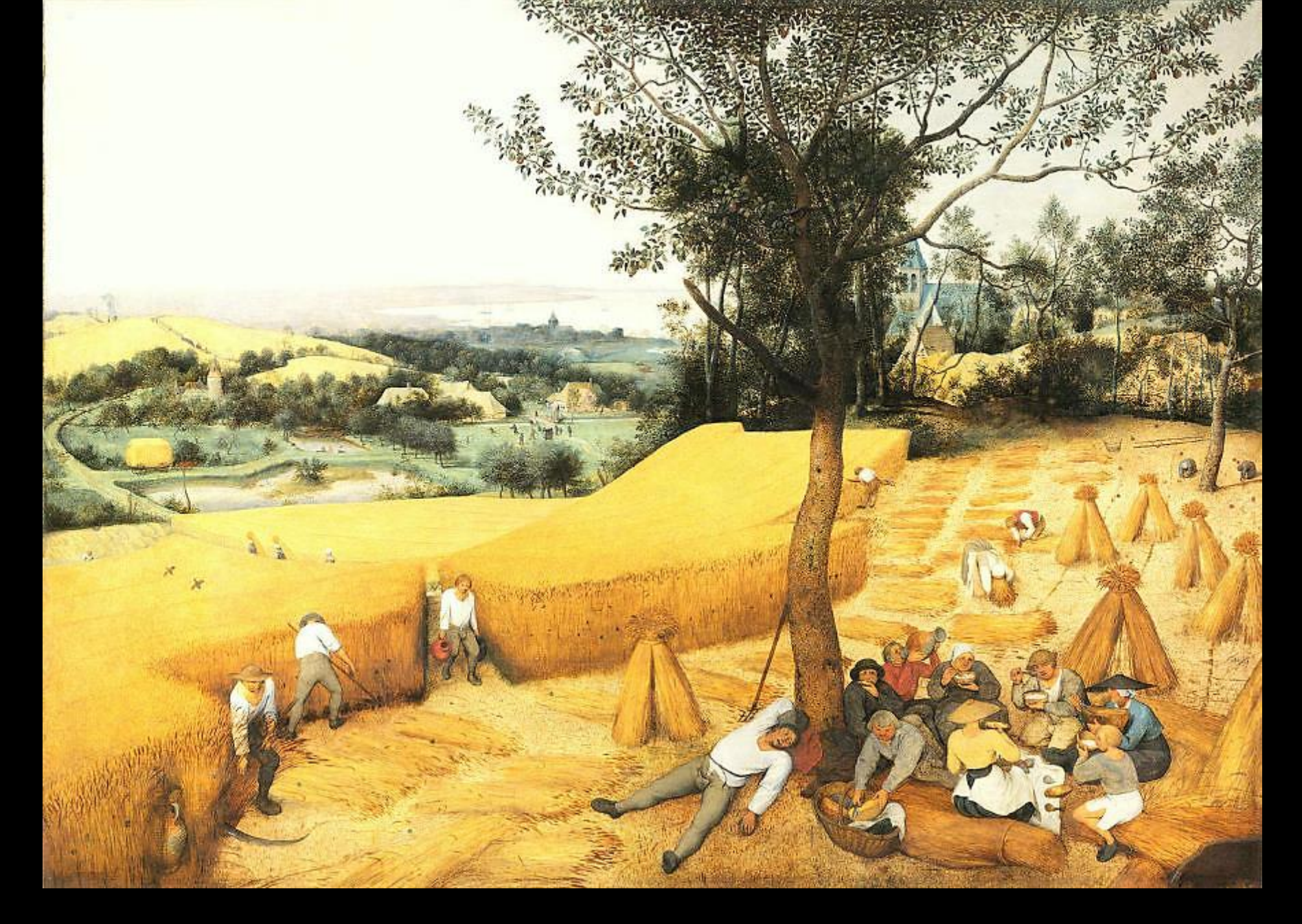
Harvesters -- Pieter Brueghel, Metropolitan Museum of Art, New York, NY