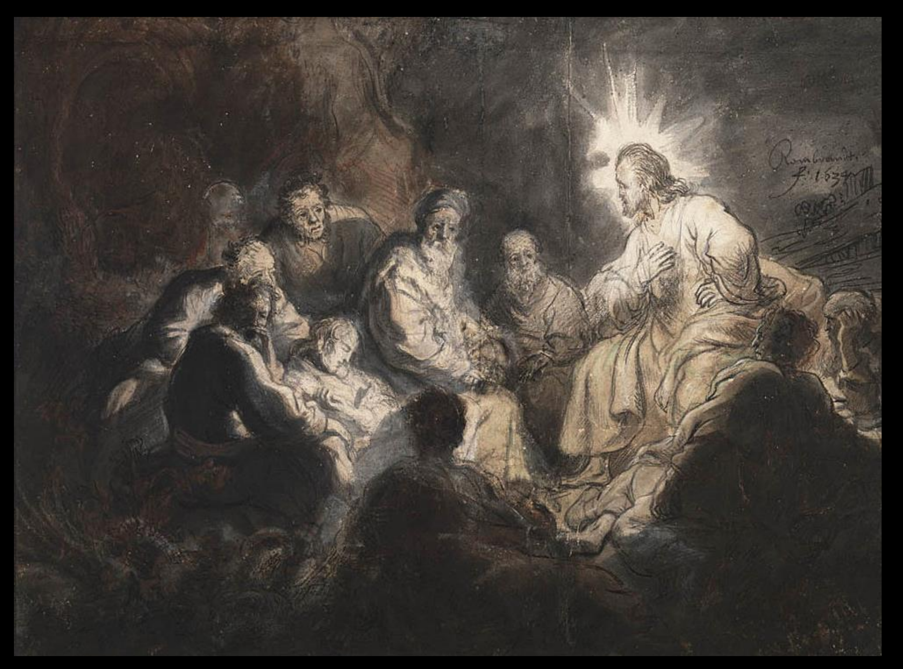
Christ and His Disciples -- Rembrandt, Teylers Museum, Haarlem, Netherlands