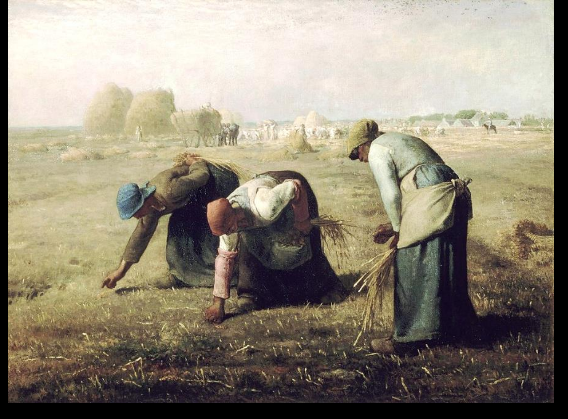
The Gleaners -- Jean Francois Millet, Musée d'Orsay, Paris, France