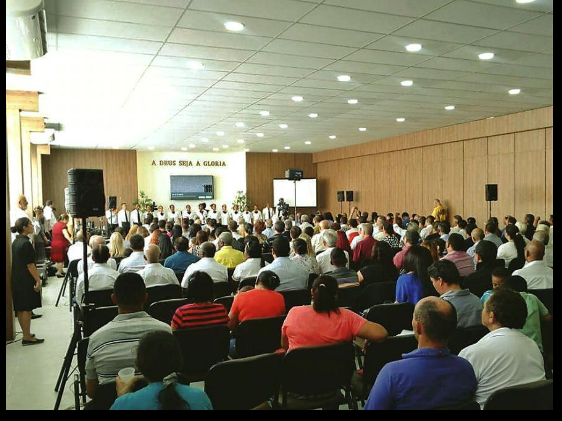
Church of God International Worship service, Sao Paolo, Brazil