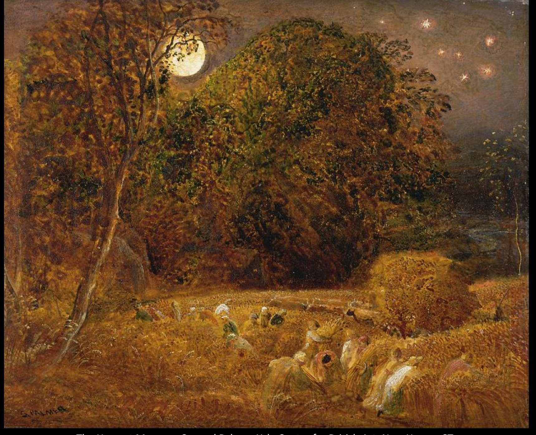
The Harvest Moon -- Samuel Palmer, Yale Center for British Art, New Haven, CT