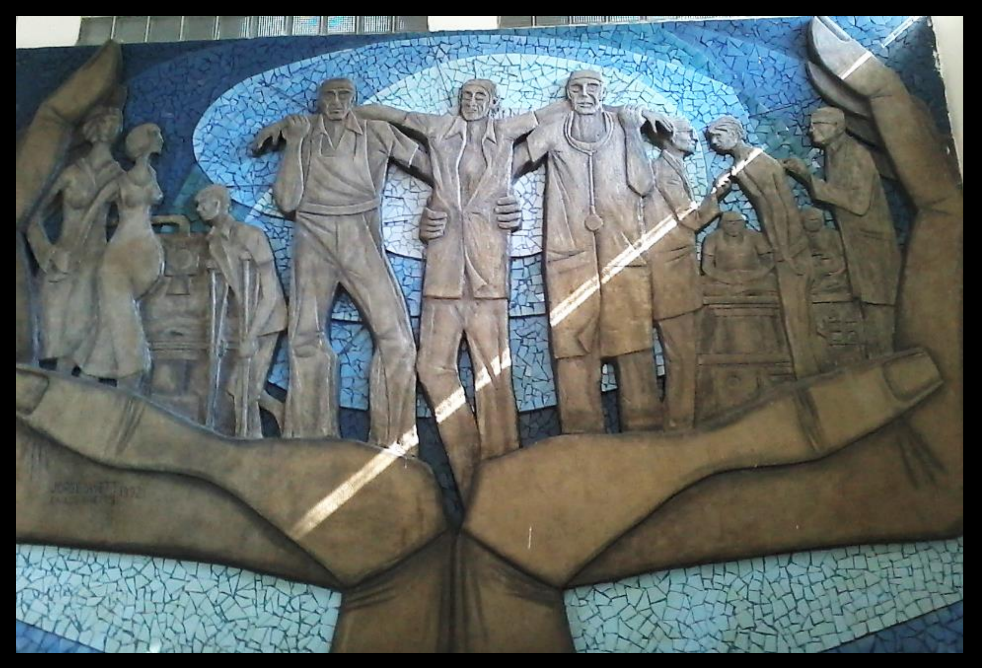
Healing Mural -- Hospital Teodoro Maldonado Carbo, Guayaquil, Ecuador