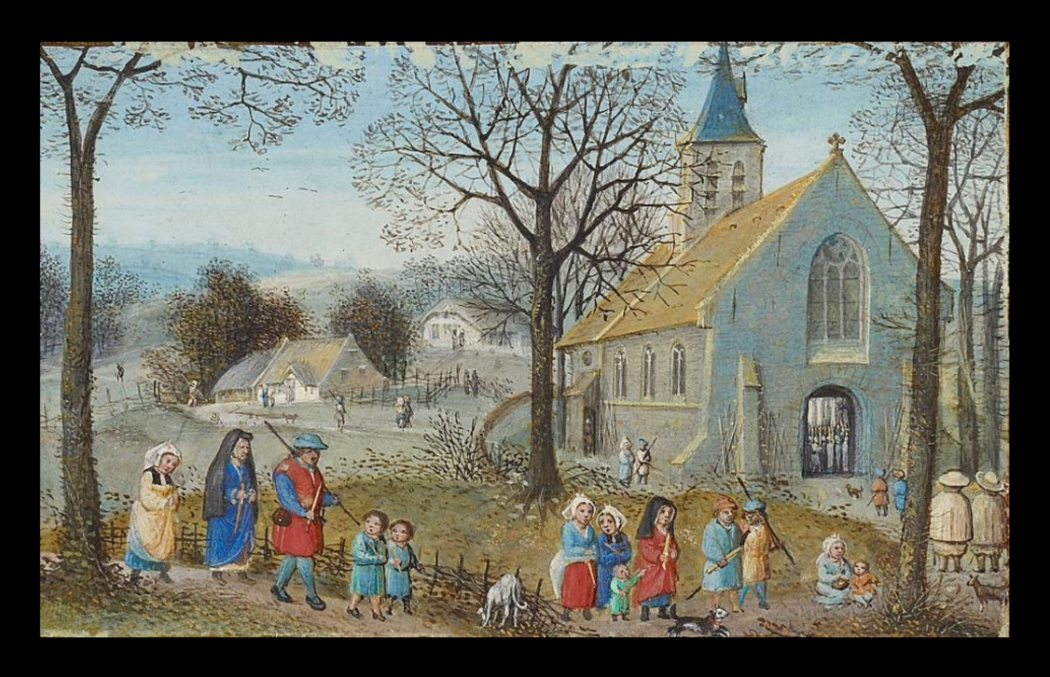
Villagers on Their Way to Church -- Simon Bening, Getty Center, Los Angeles, CA