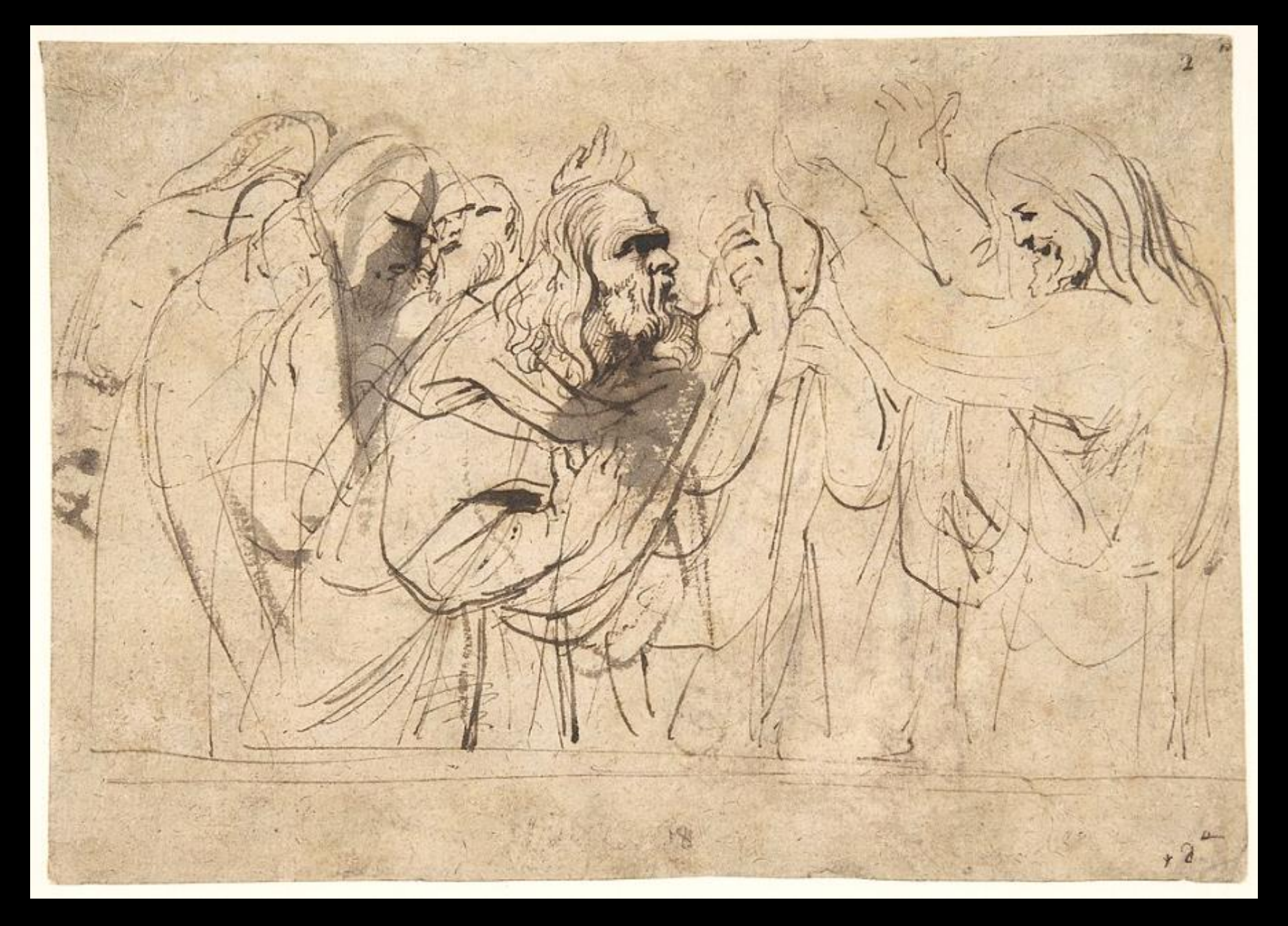
Christ and the Pharisees -- Anthony van Dyck, Metropolitan Museum of Art, NY