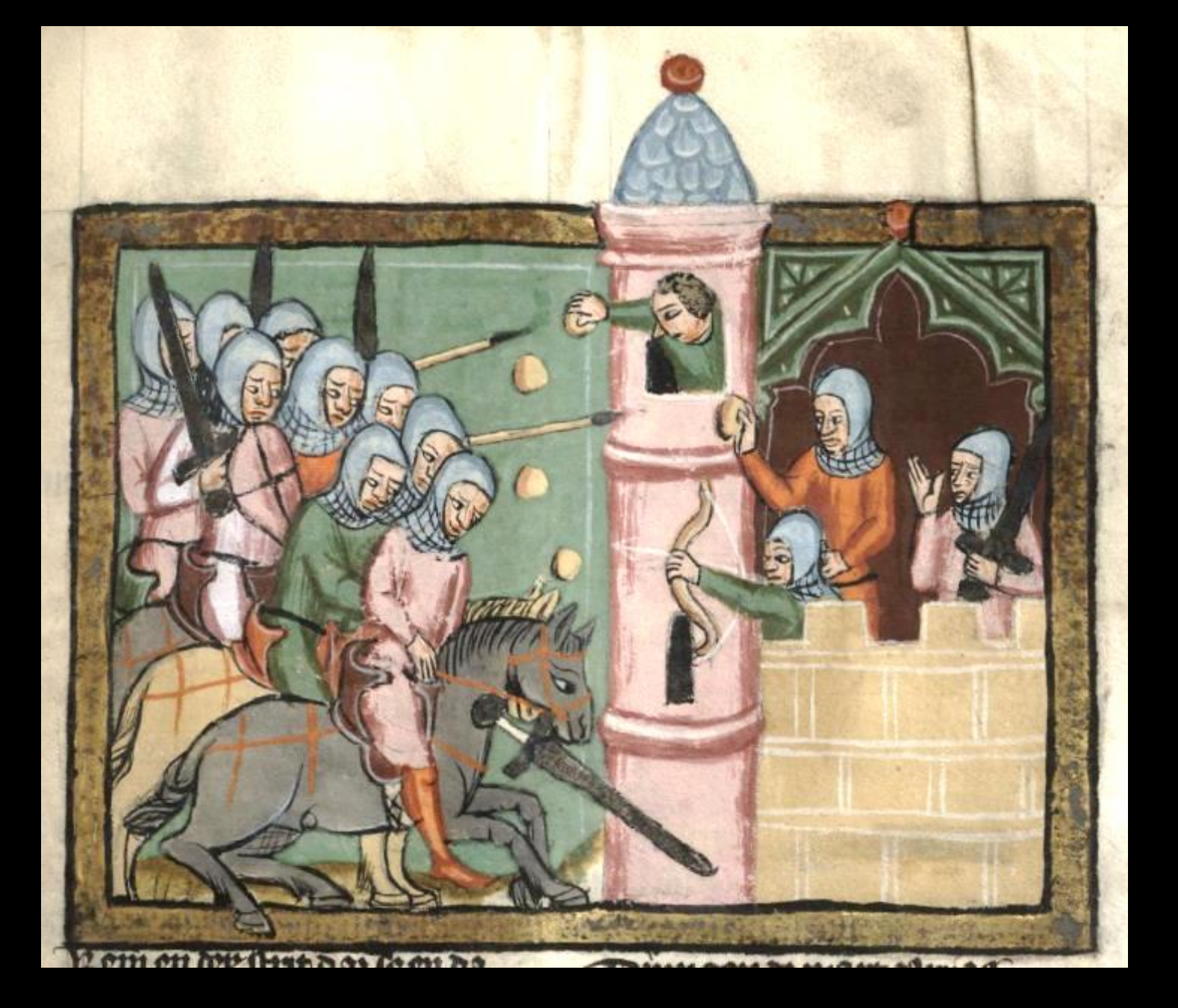
Uriah Falls at the Siege of Rabbas -- Rudolf von Ems, World Chronicle, Fulda University Library, Germany