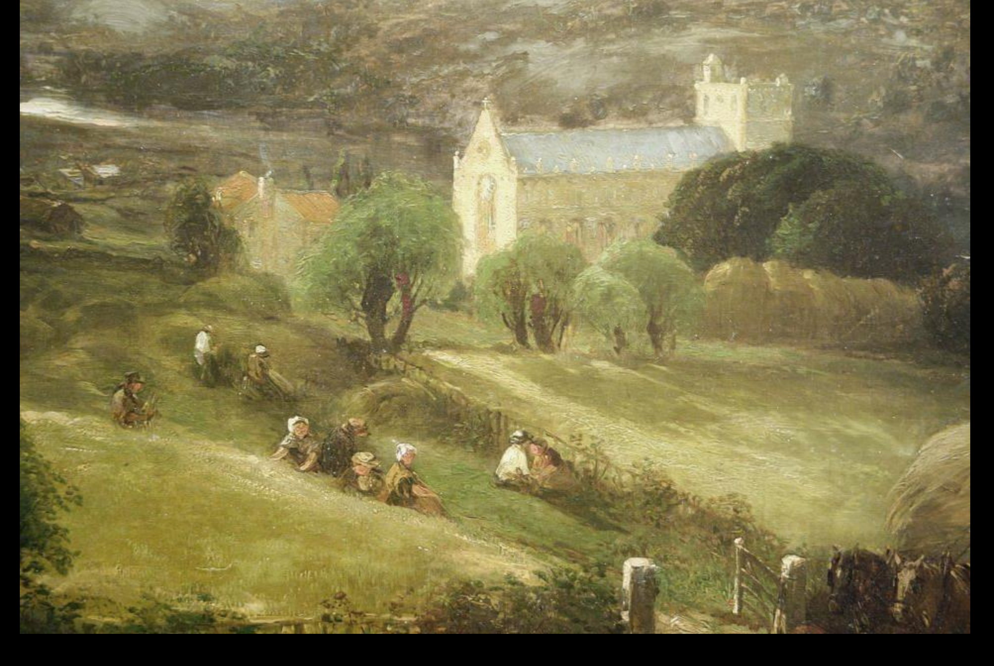
Peace and Plenty -- William Hart, New Britain Museum of American Art, New Britain, CT