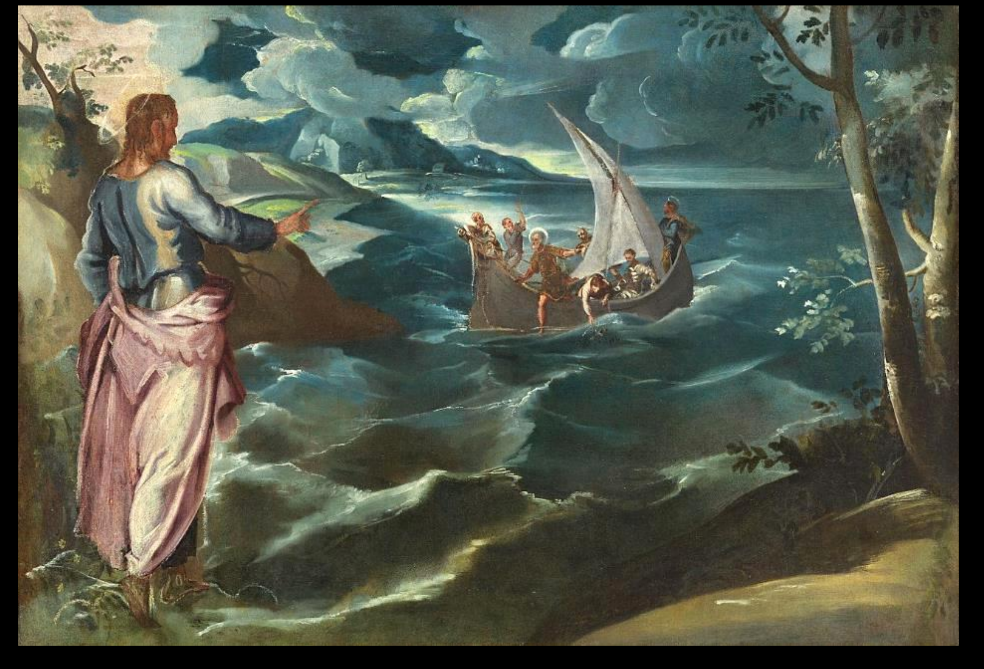
Christ at the Sea of Galilee -- Tintoretto, National Gallery of Art, Washington, DC