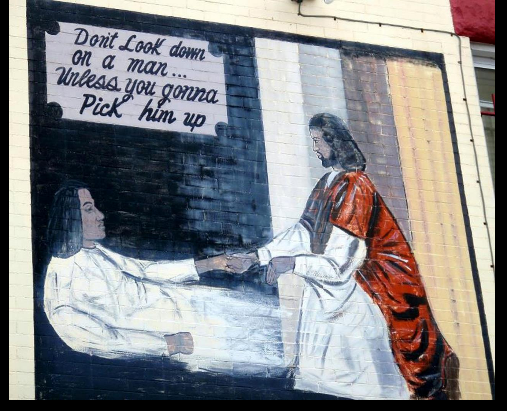
"Don't Look Down..." -- Mural, Washington, DC