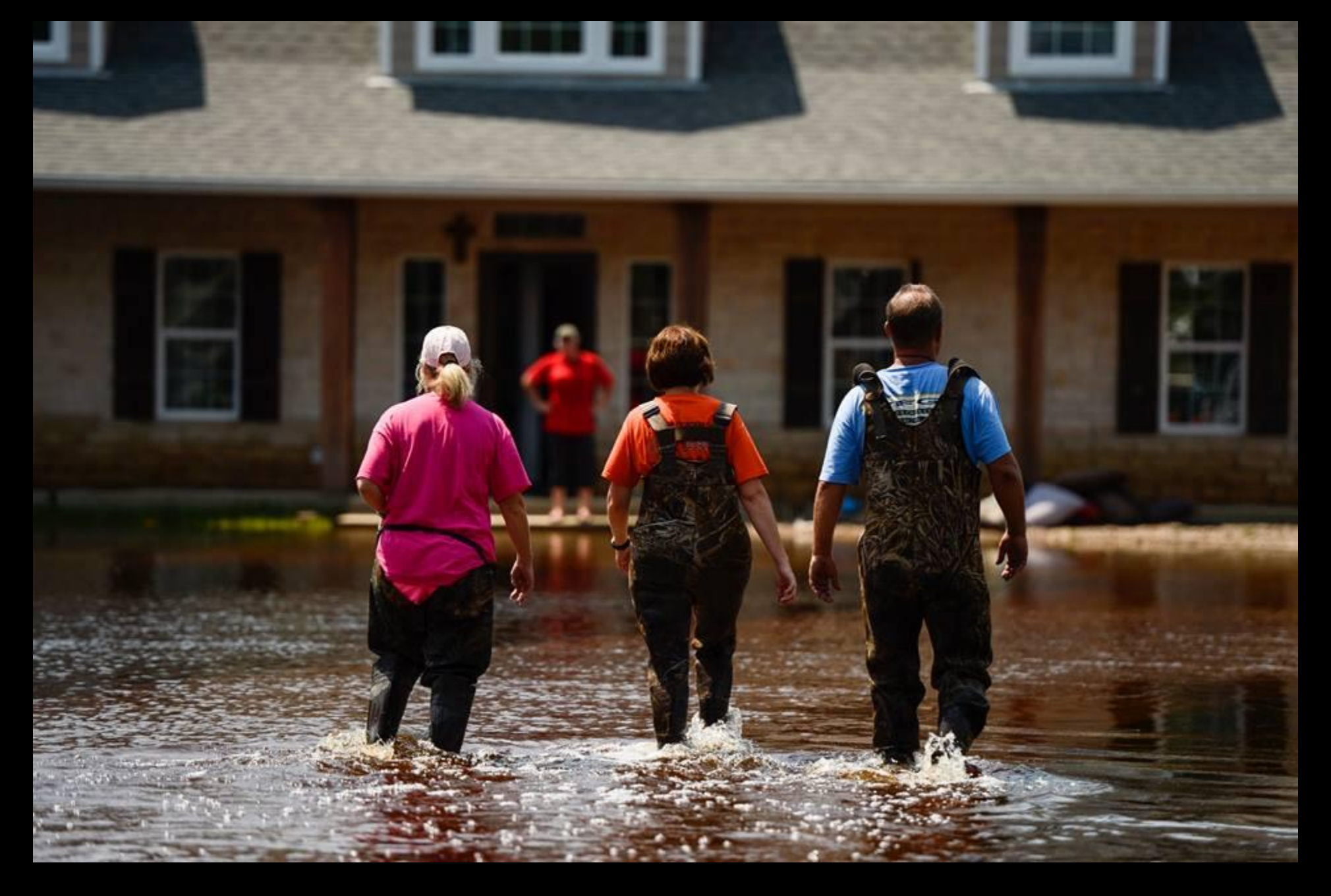
Hurricane Harvey Relief -- Orange, Texas