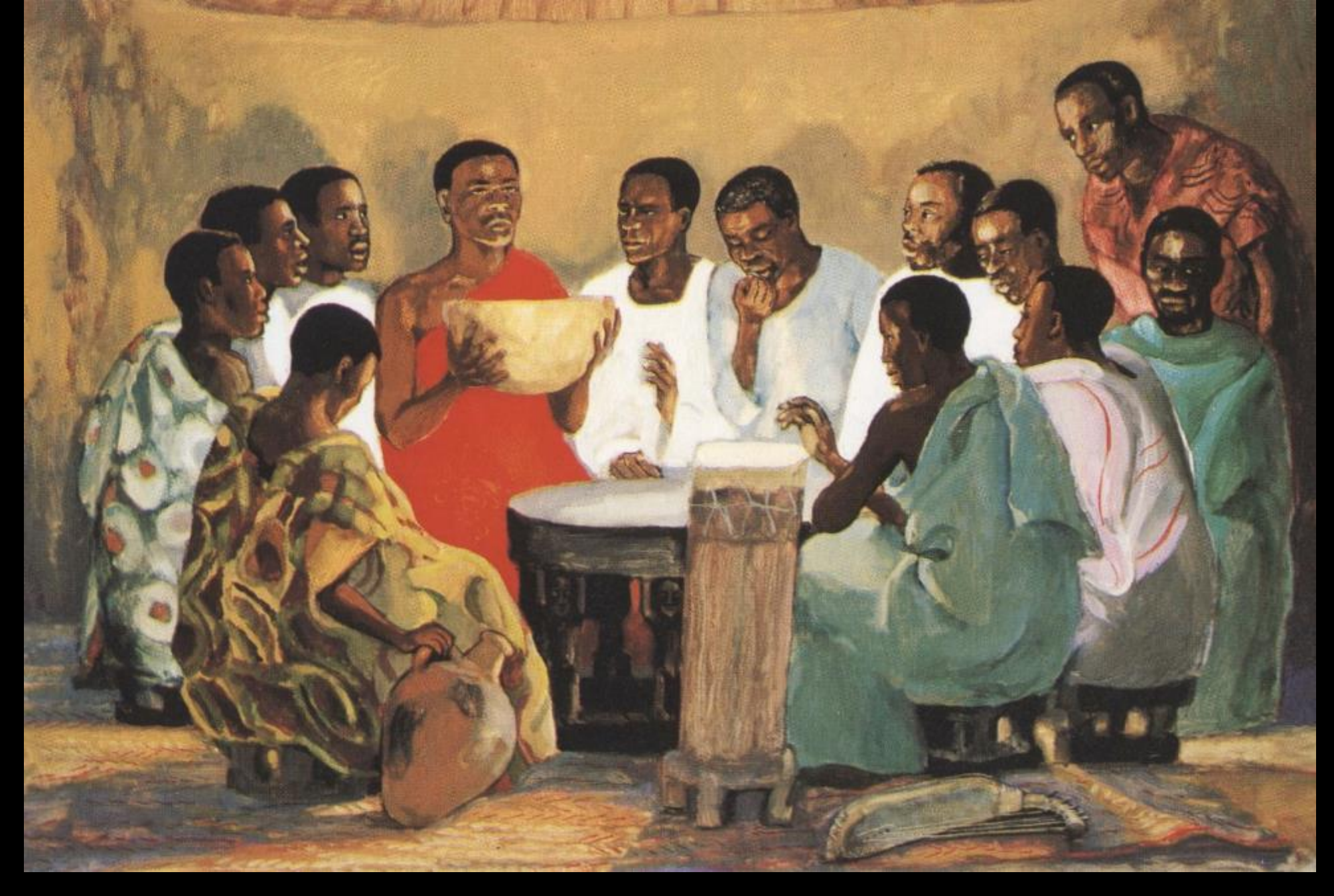
The Lord's Supper -- JESUS MAFA, Cameroon