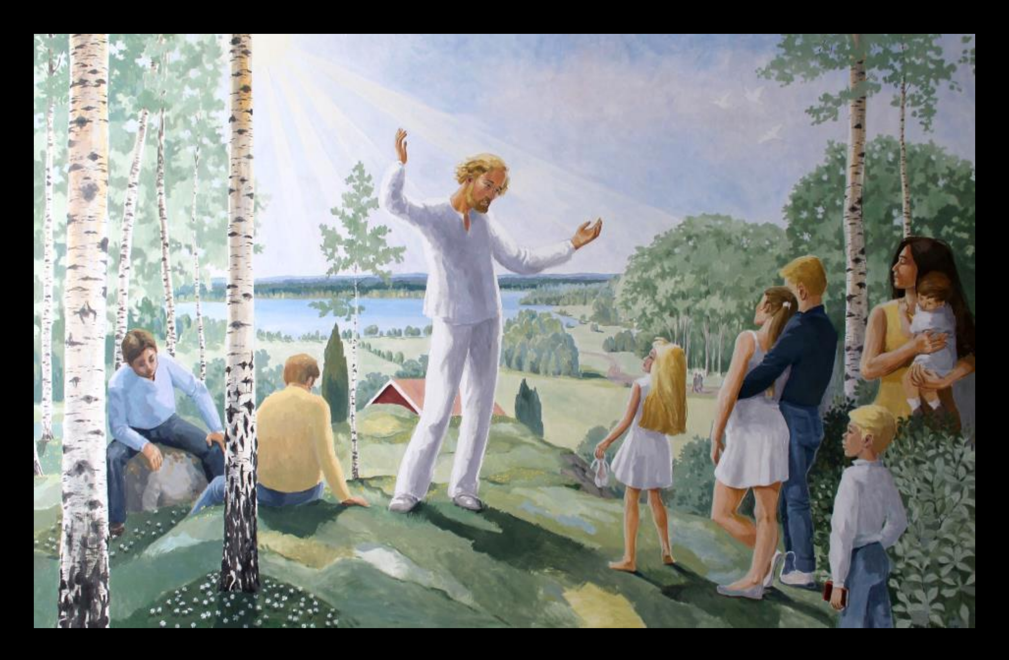
Jesus Preaching in the Present -- Soraby Kyrka, Rottne, Sweden