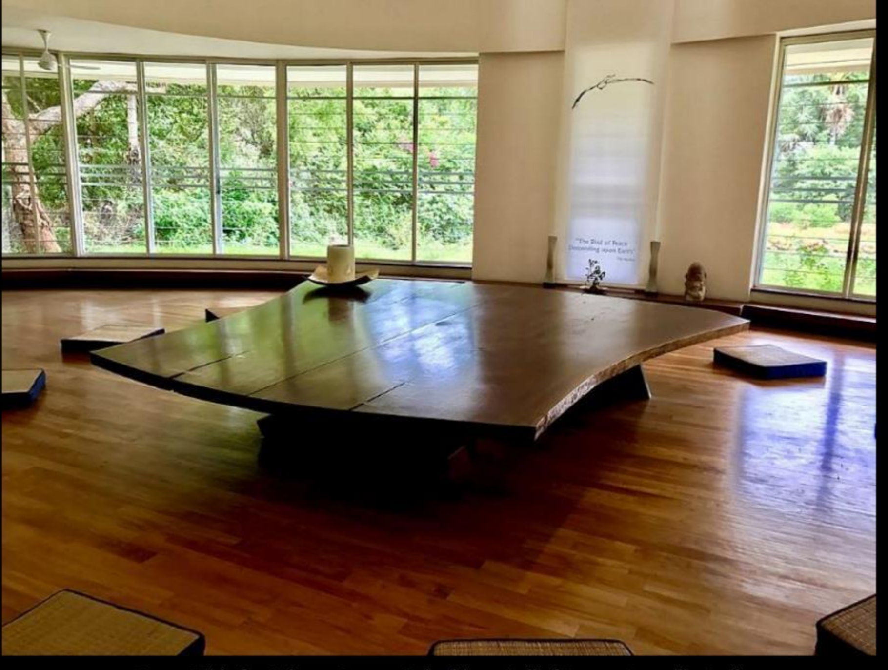
Peace Table for Asia -- George Nakashima, Hall of Peace, Auroville, India