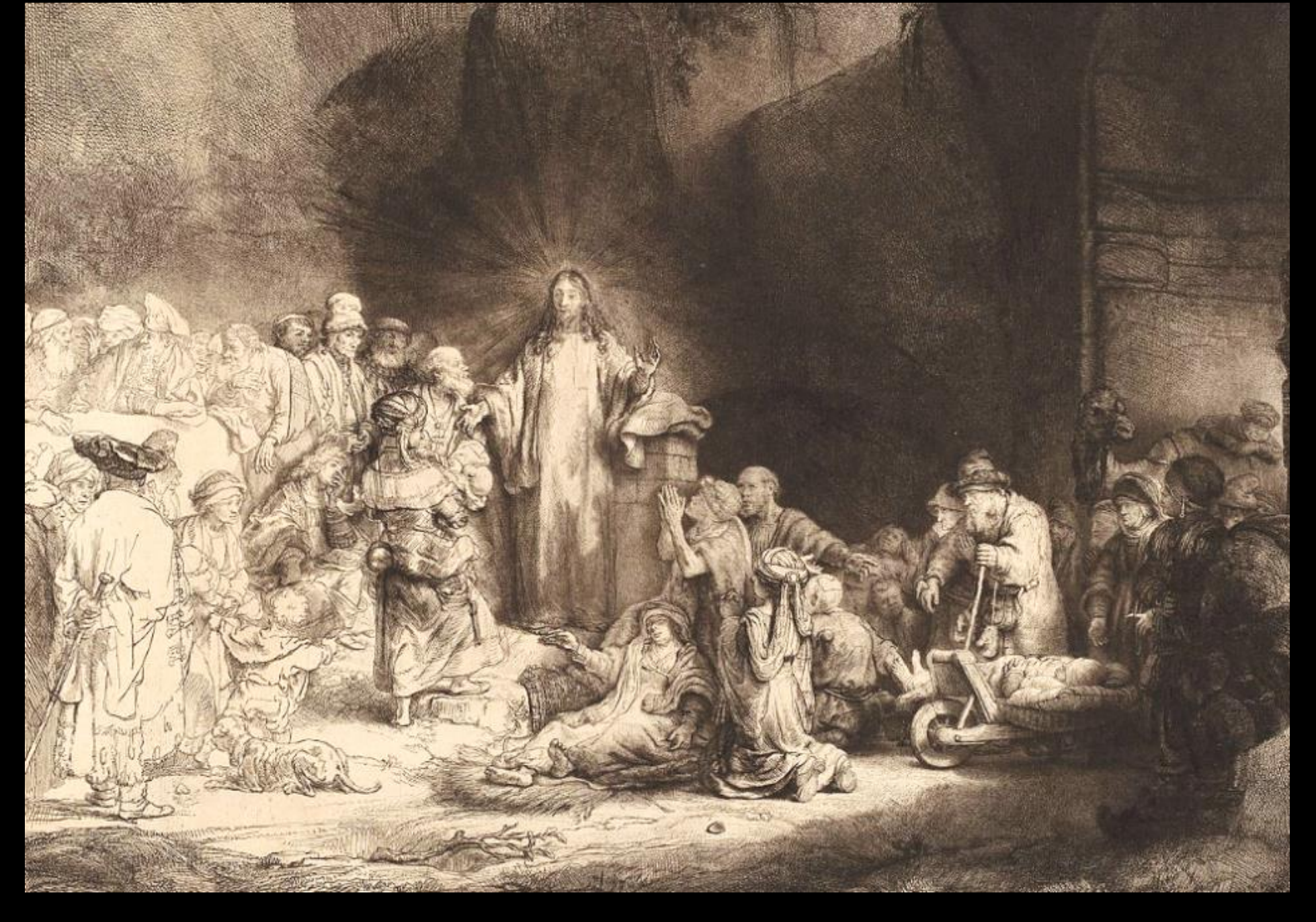
Christ Preaching -- Rembrandt, Rijksmuseum, Amsterdam, Netherlands