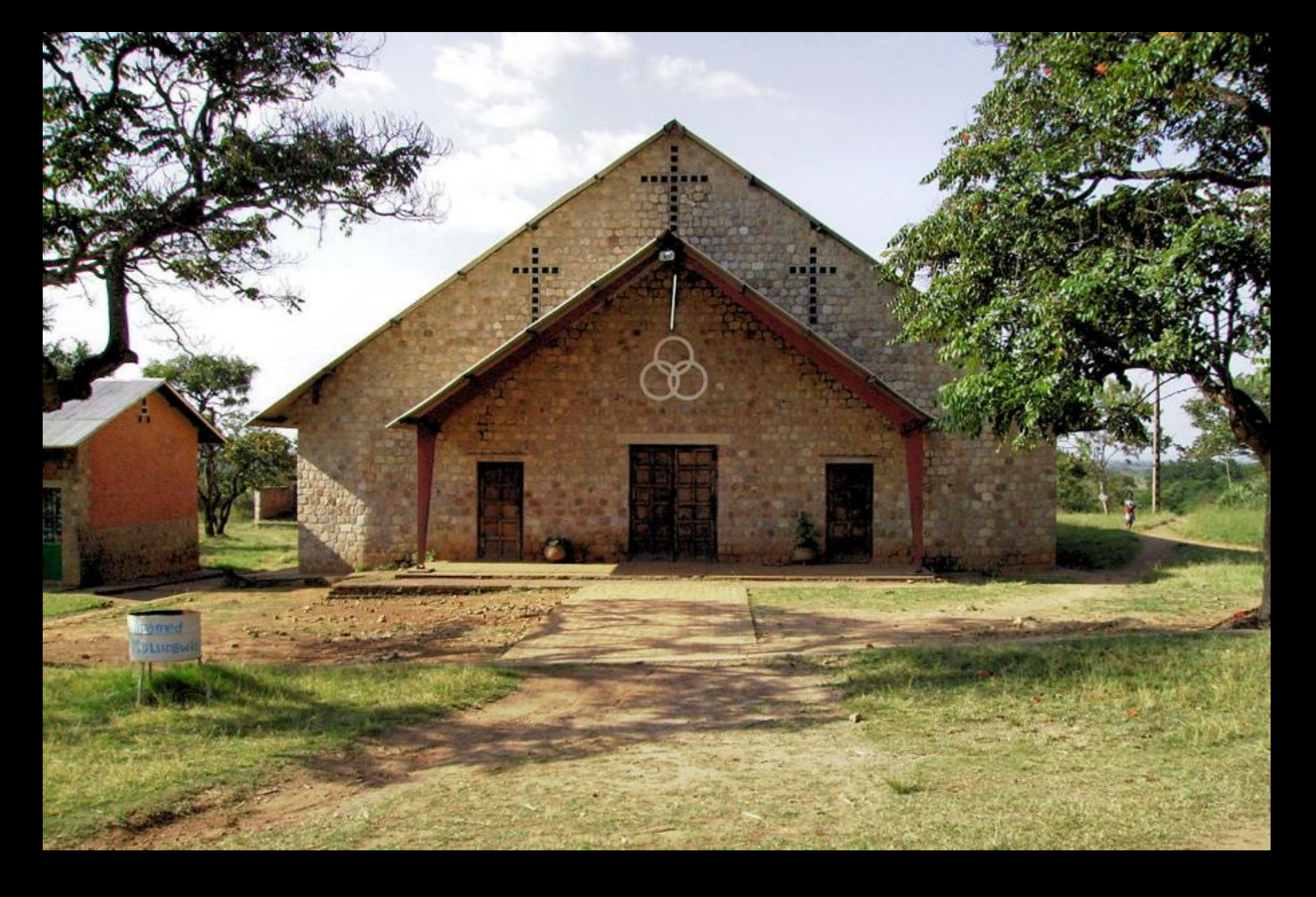
Mulungwishi United Methodist Church, Mulungwishi, Democratic Republic of Congo