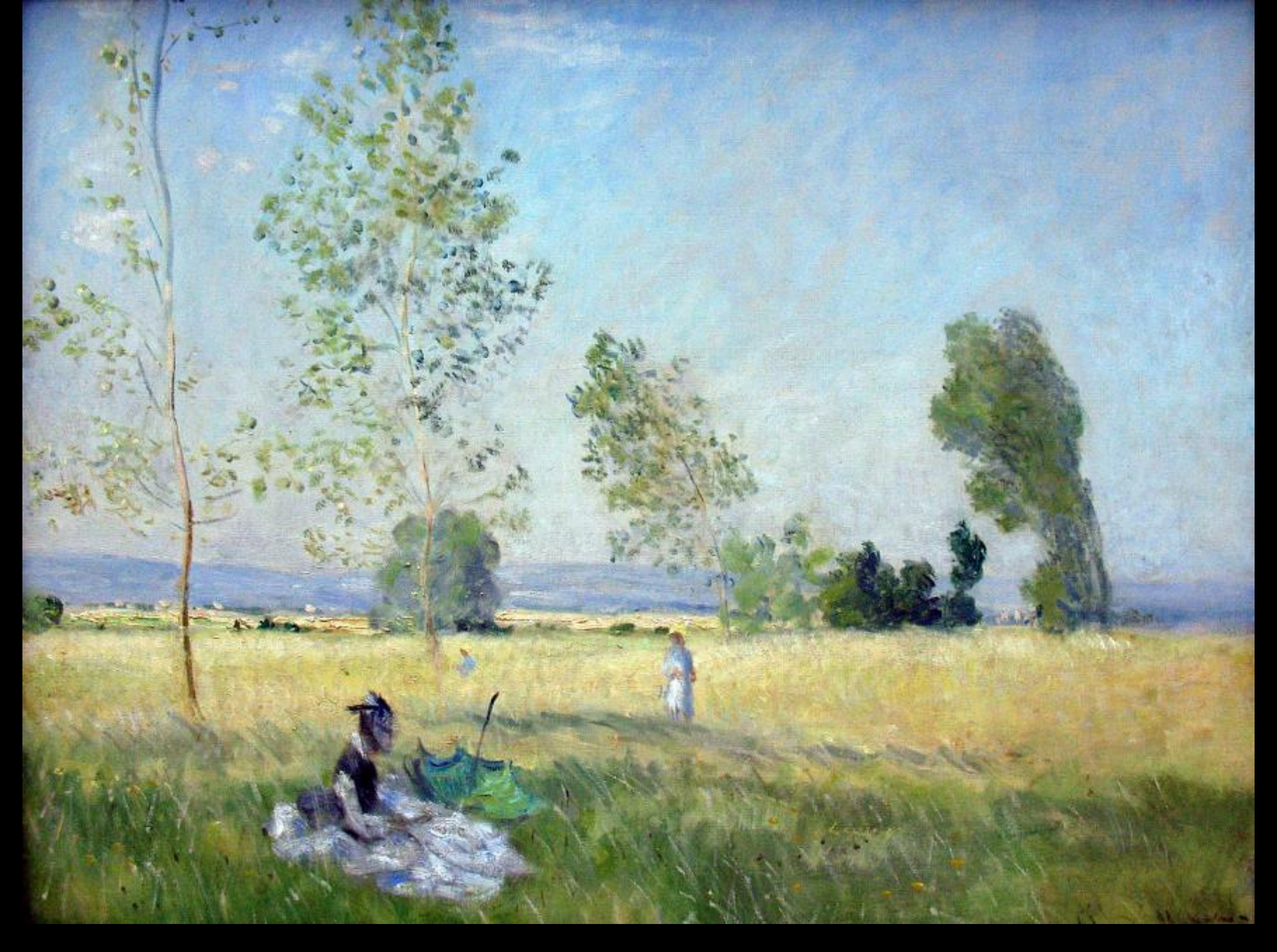
Summer -- Claude Monet, Alte Nationalgalerie, Berlin, Germany