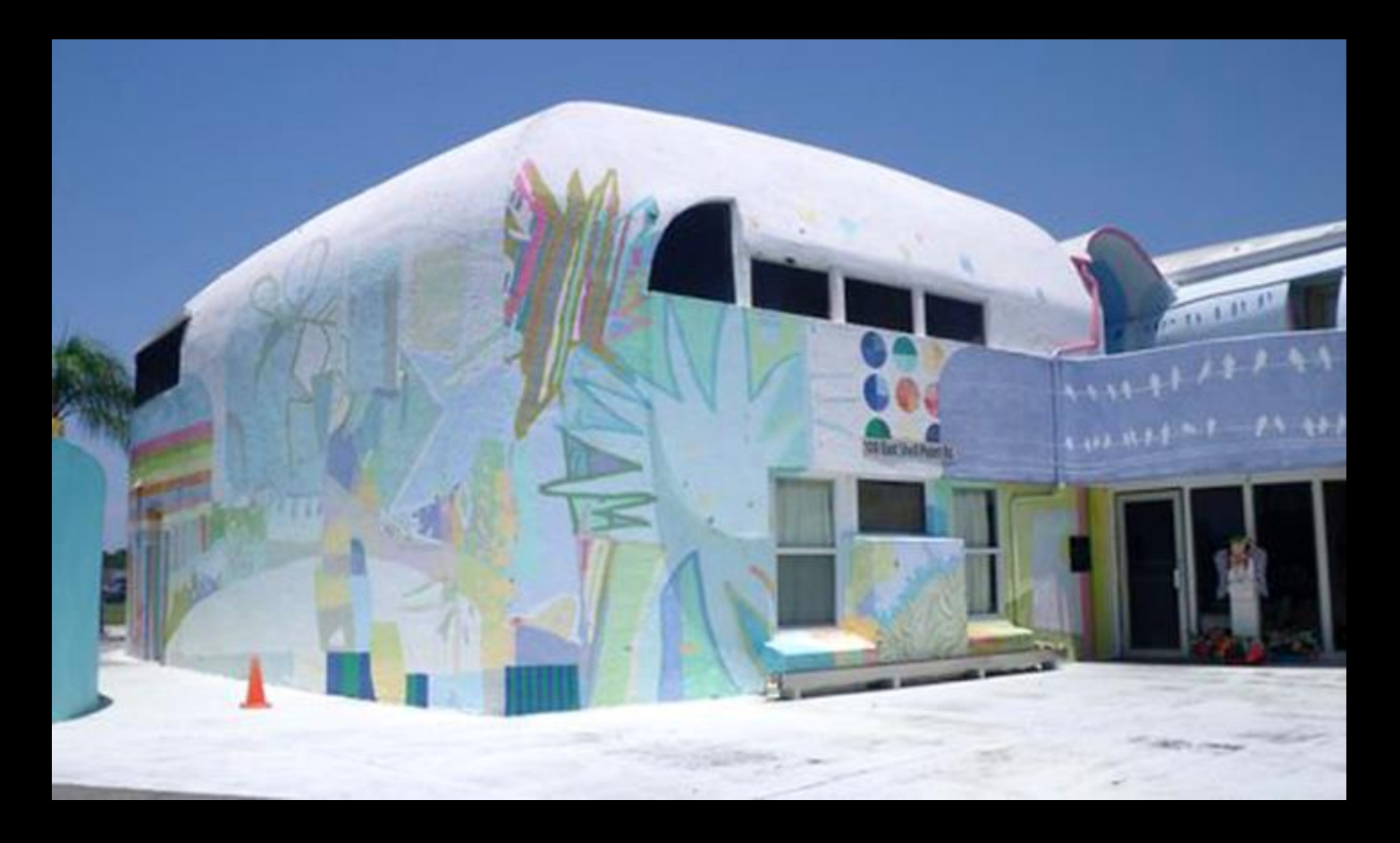
Mary and Martha House -- Domestic Violence Homeless Shelter for Women in Ruskin, FL