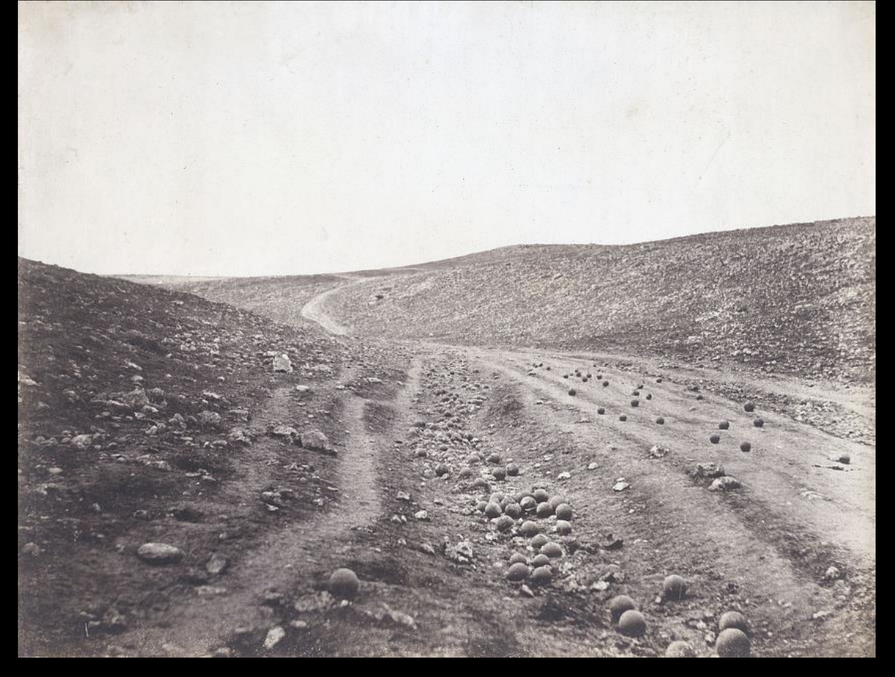
Valley of the Shadow of Death, Crimean War -- Roger Fenton, V&A Museum, London