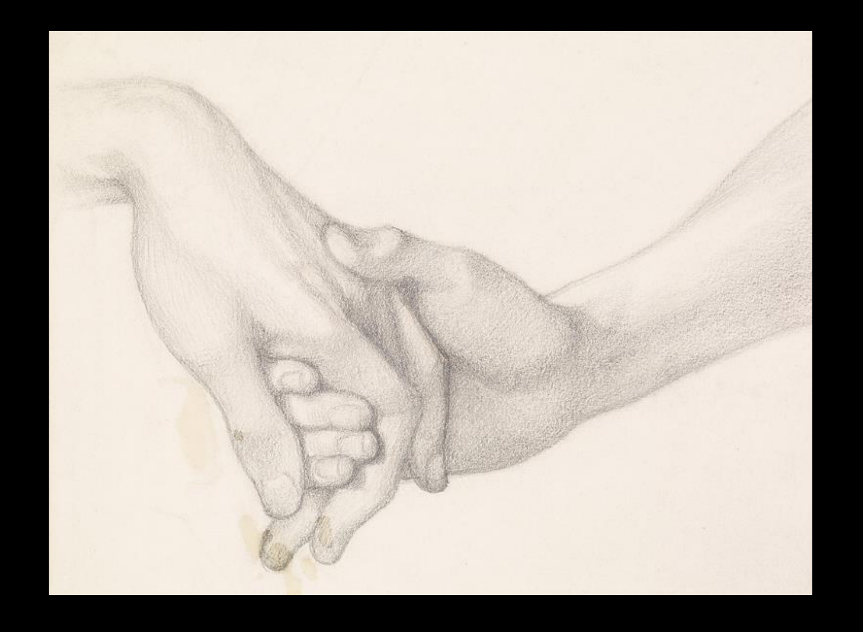
Hand of Love (study) -- Dante Rossetti, Birmingham Museum, Birmingham, England