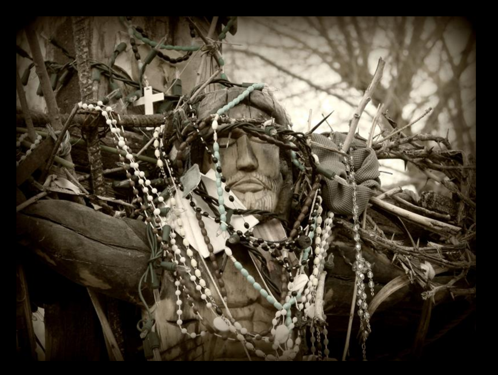
Crucifixion -- Chimayo, New Mexico