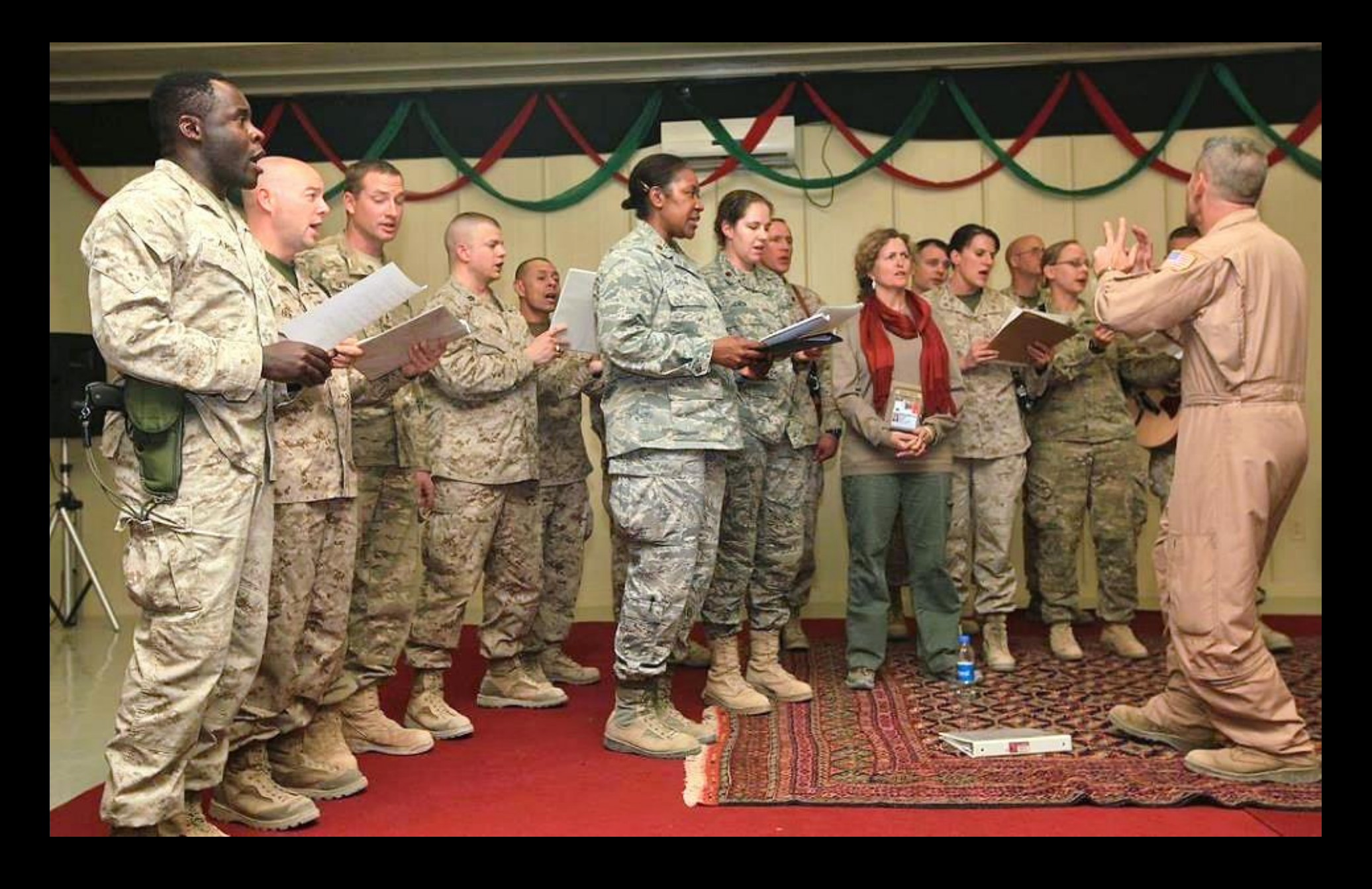
Christmas Choir, US Armed Forces -- Afghan Cultural Center, Helmand, Afghanistan