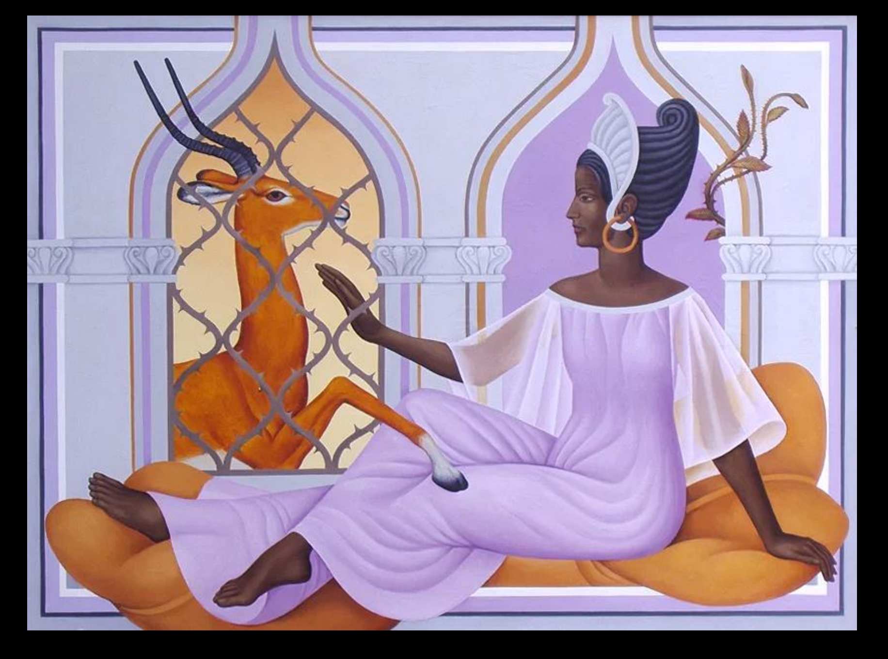
Lattice Window – Song of Solomon -- Peter Koenig