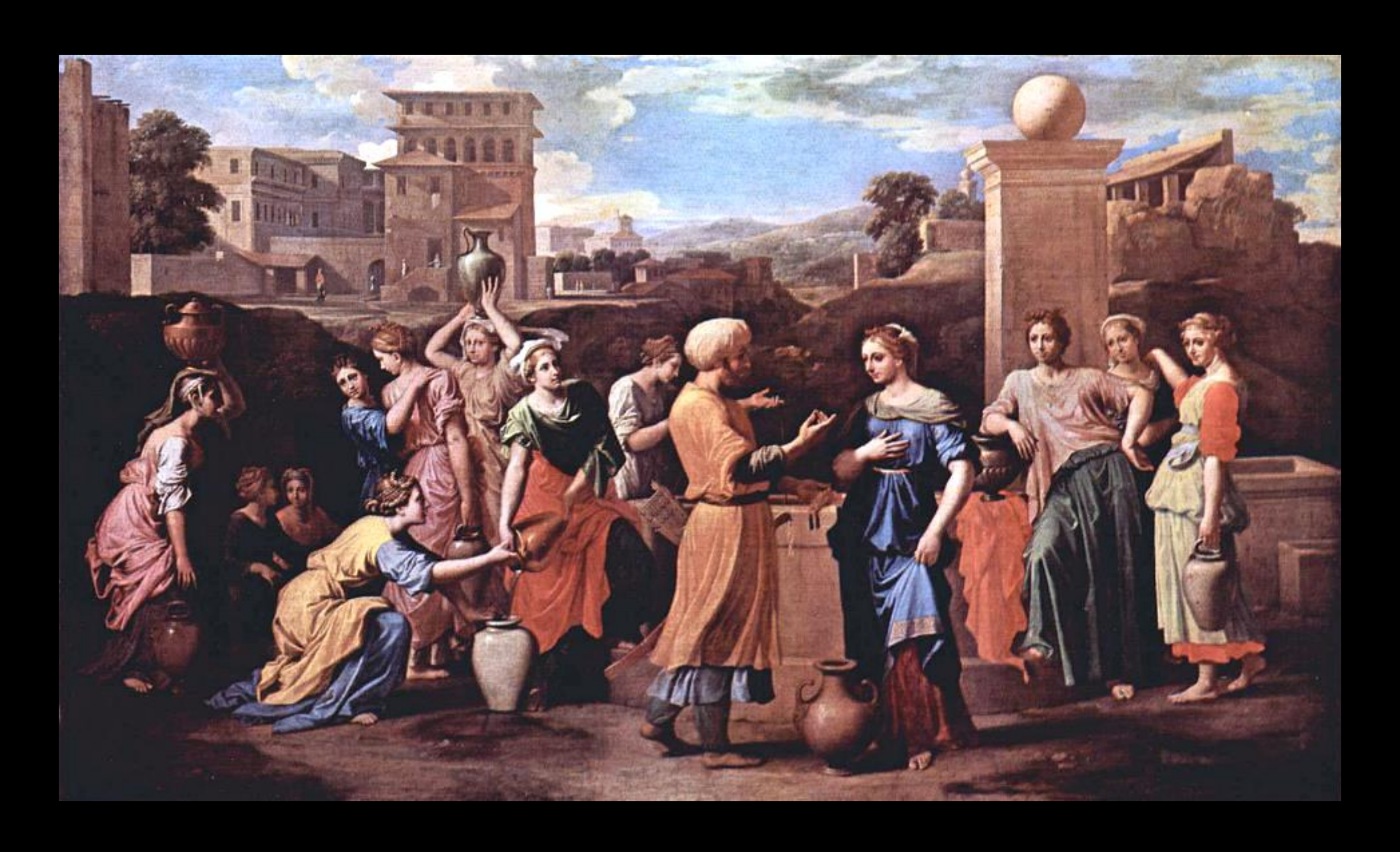
Rebecca at the Well -- Nicolas Poussin, Louvre Museum, Paris, France