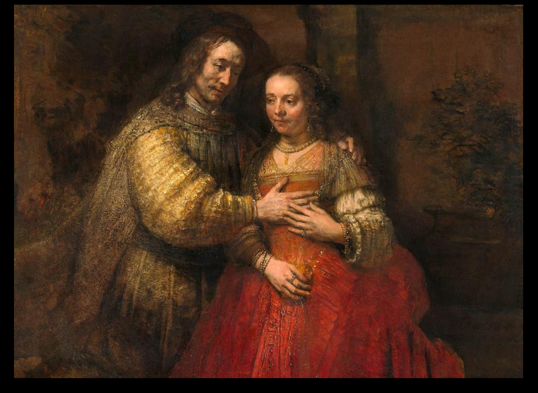
Isaac and Rebecca -- Rembrandt, Rijksmuseum, Amsterdam, Netherlands