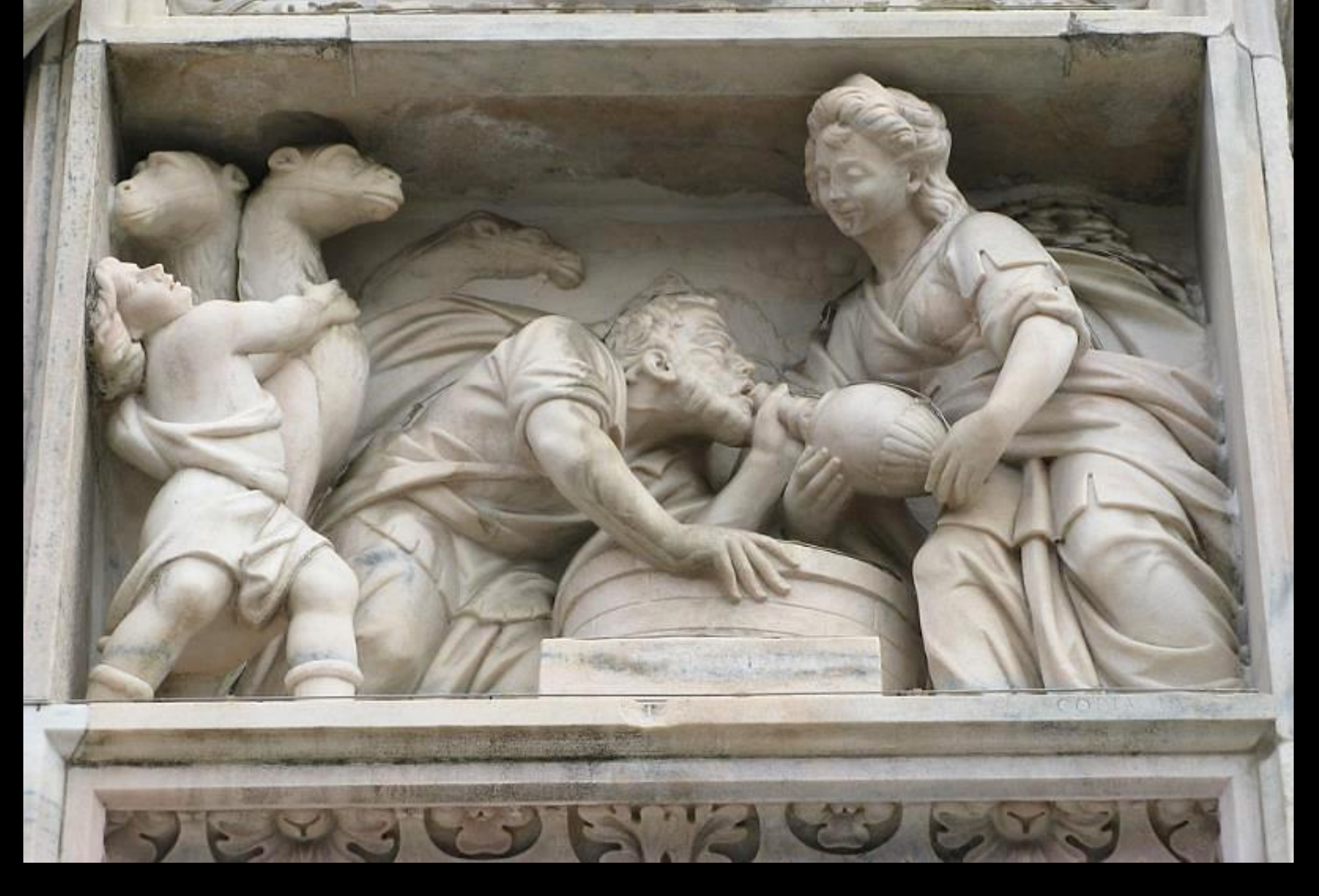
Isaac's Messenger Drinks from Rebecca's Jug -- Duomo, Milan, Italy