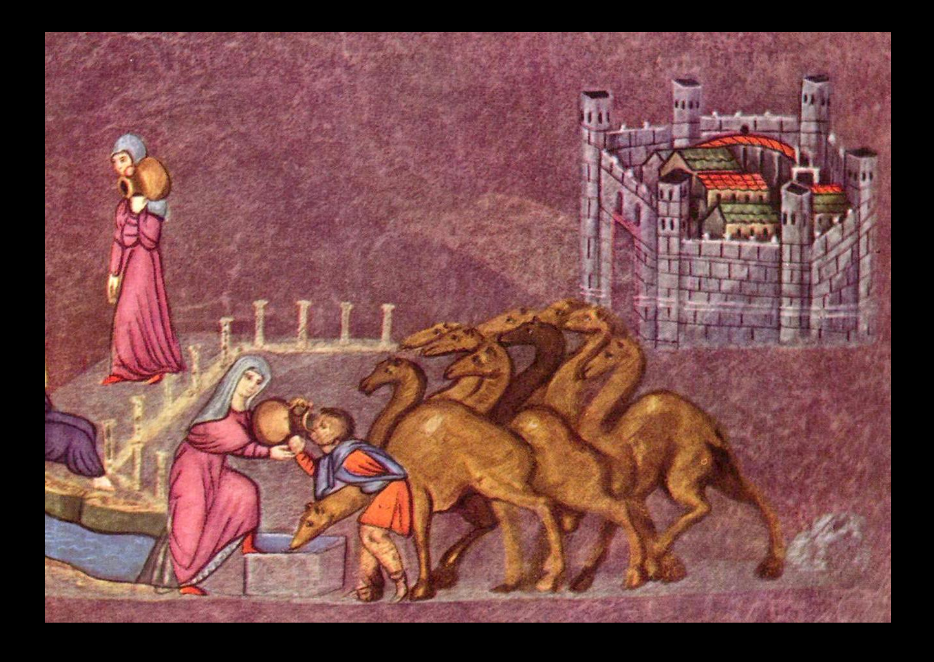
Rebecca at the Well -- Österreichische Nationalbibliothek, Vienna, Austria