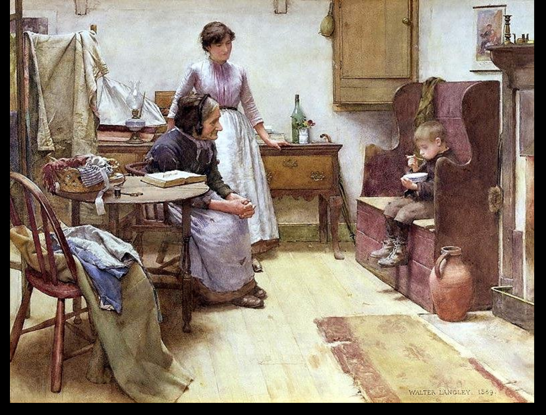
The Waif -- Walter Langley