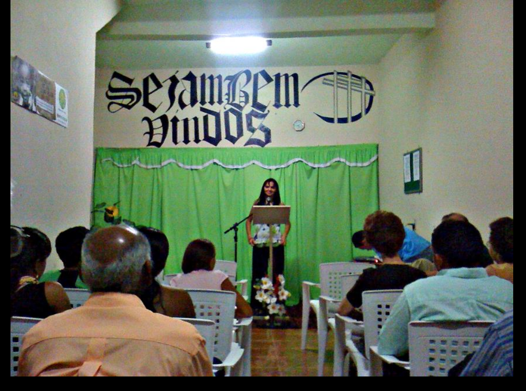
"Everyone is Welcome" -- Calvary Baptist Church, Brazil, Indiana