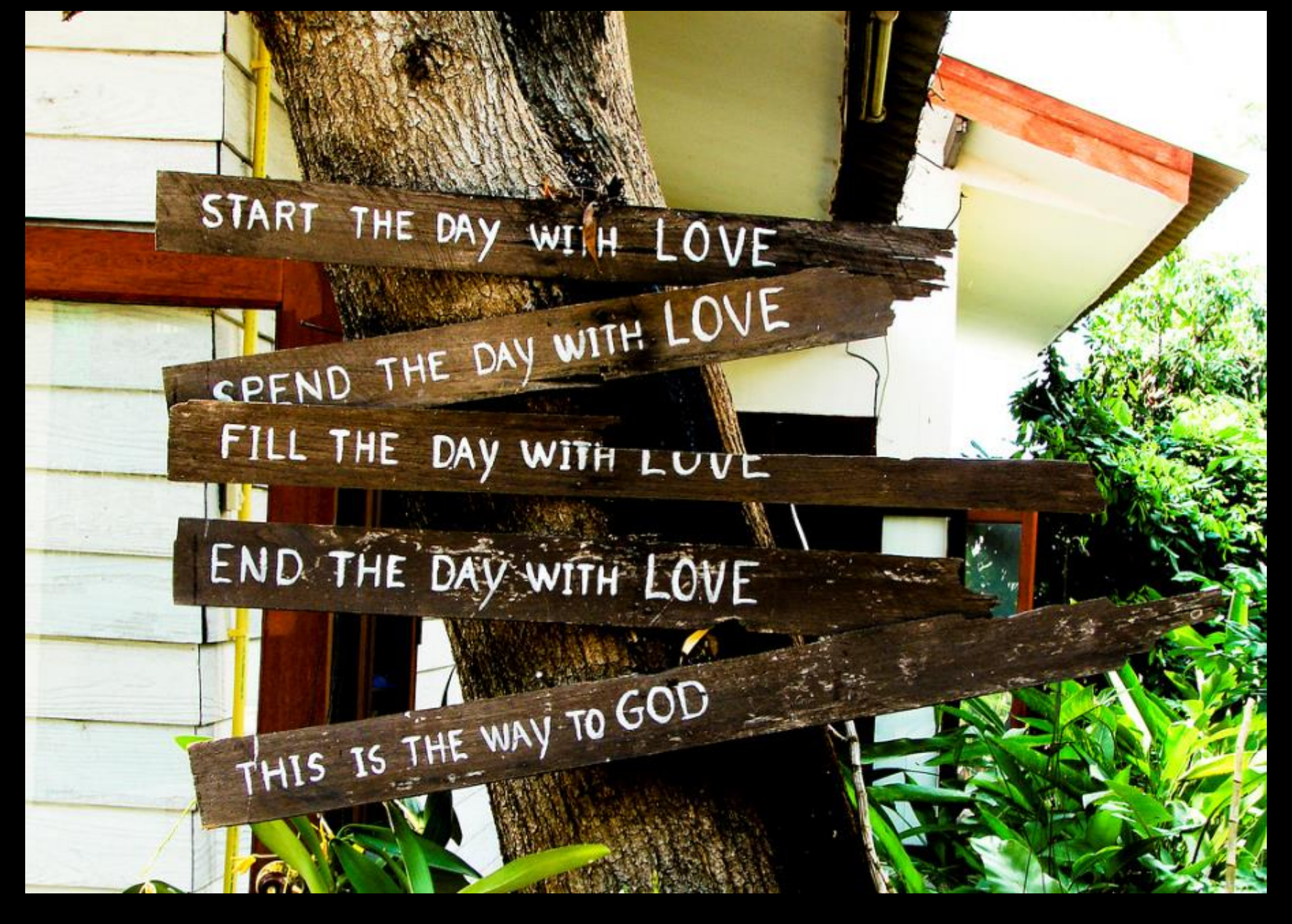
Wooden Sign, Doi Inthanon National Park, Thailand