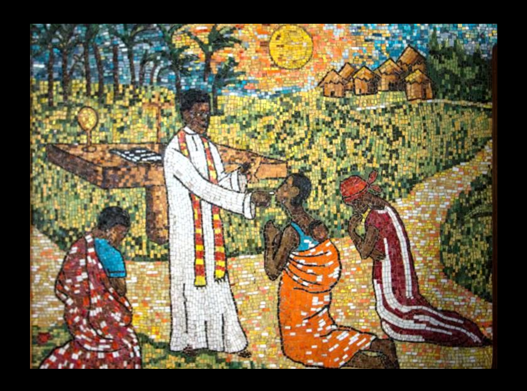
Sharing Communion -- Cathedral of St. Paul, Abidjan, Ivory Coast