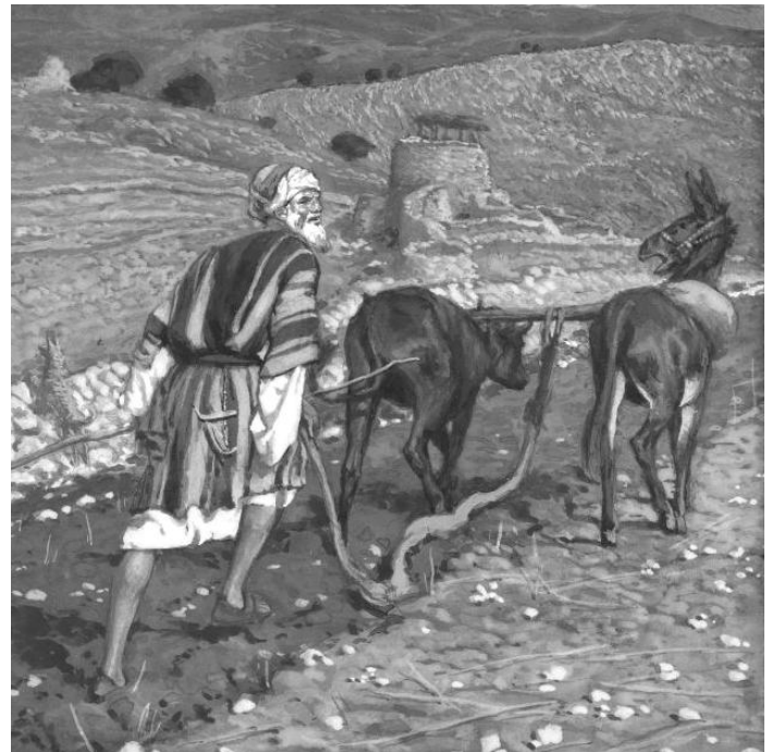
THE MAN AT THE PLOUGH, James Tissot, Brooklyn Museum, between 1886 and 1894

to the law. Now the works of the flesh are obvious: fornication, impurity, licentiousness, idolatry, sorcery, enmities, strife, jealousy, anger, quarrels, dissensions, factions, envy, drunkenness, carousing, and things like these. I am warning you, as I warned you before: those who do such things will not inherit the kingdom of God. By contrast, the fruit of the Spirit is love, joy, peace, patience, kindness, generosity, faithfulness, gentleness, and self-control. There is no law against such things. And those who belong to Christ Jesus have crucified the flesh with its passions and desires. If we live by the Spirit, let us also be guided by the Spirit.