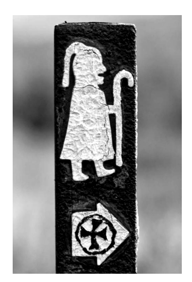
Pilgrim Path Waymarking Sign Ireland, photo Joe King, 2011.

July 7, 2024 Year B, Revised Common Lectionary